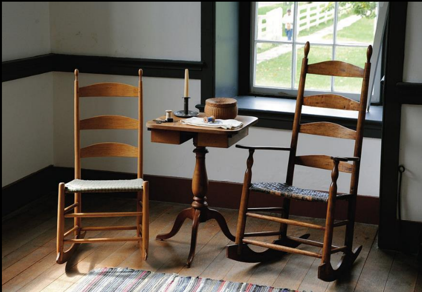
Handmade Rockers in the Shaker Village -- Harrodsburg, KY