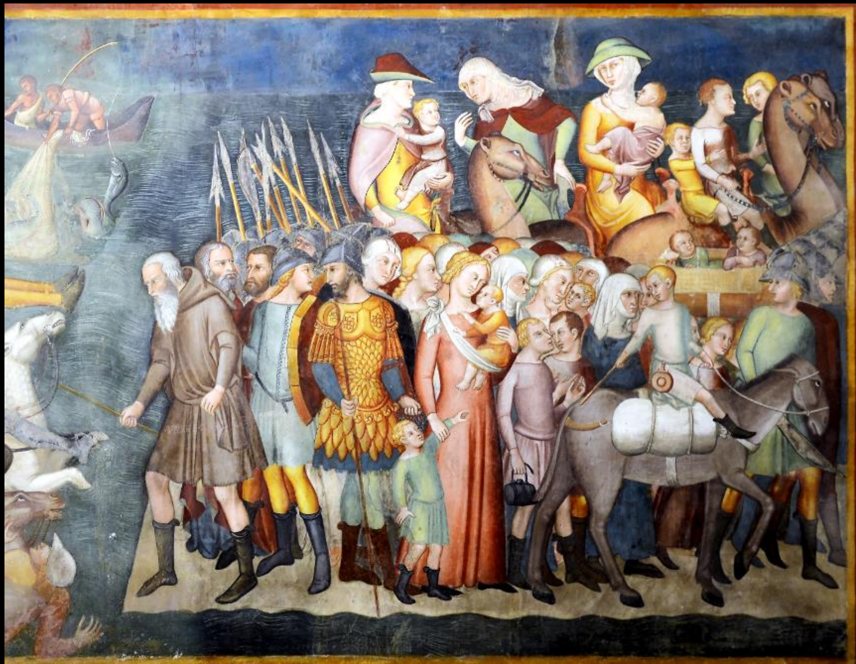
Crossing of the Red Sea -- Bartolo di Fredi, Collegiate Church, San Gimignano, Italy