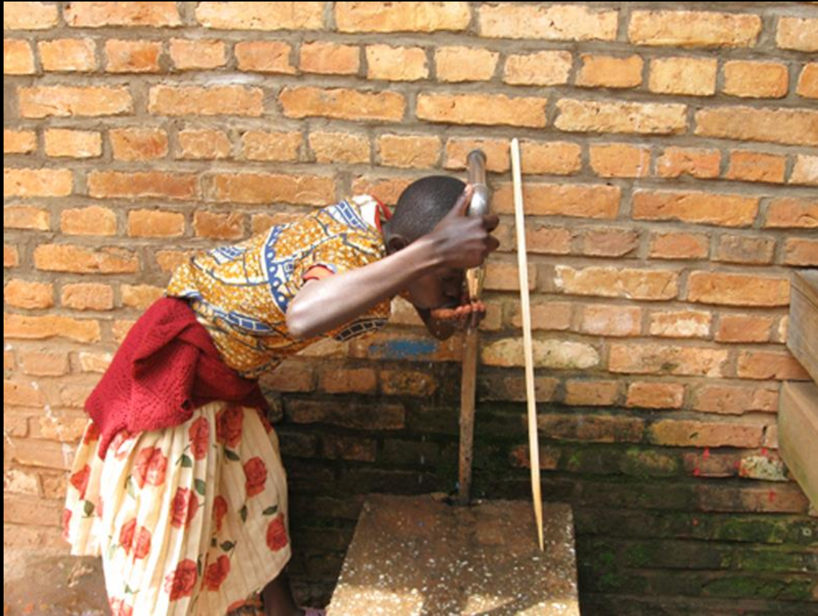
Girl drinking clean water in Rwanda (from Partners in Health initiative)