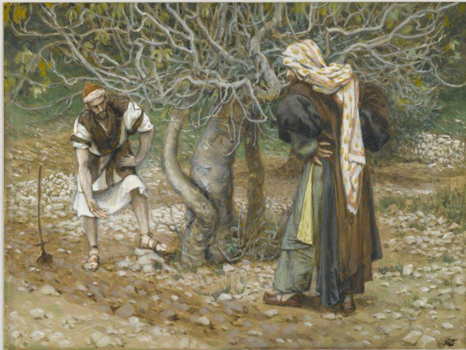
The Vine Dresser and the Fig Tree -- James Tissot, Brooklyn Museum, New York, NY