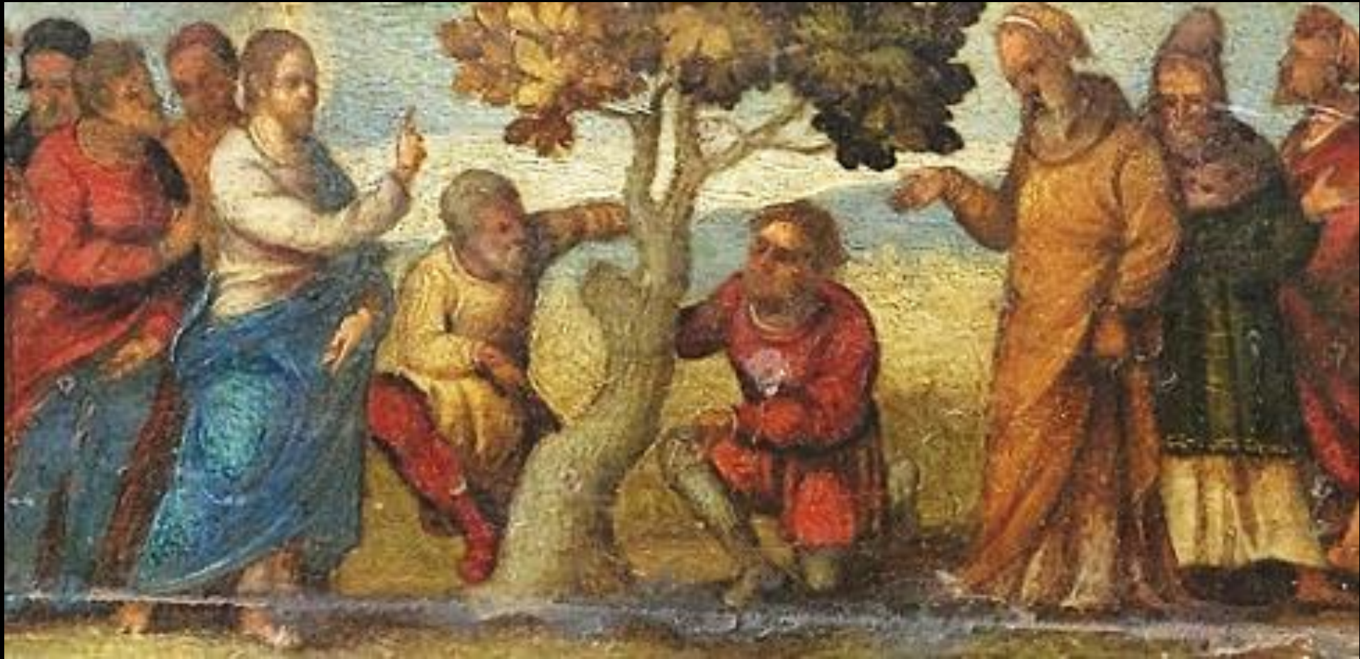
Parable of the Barren Fig Tree -- Ludovico Mazzolino, Rijksmuseum, Amsterdam, Netherlands