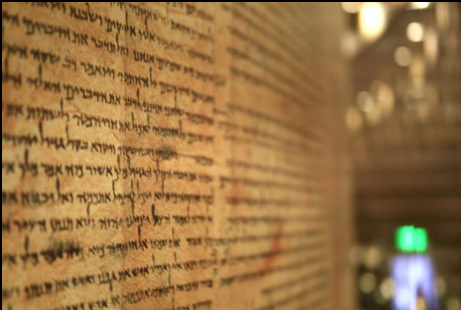
Scroll of Isaiah from Qumran -- Museum of Israel, Jerusalem