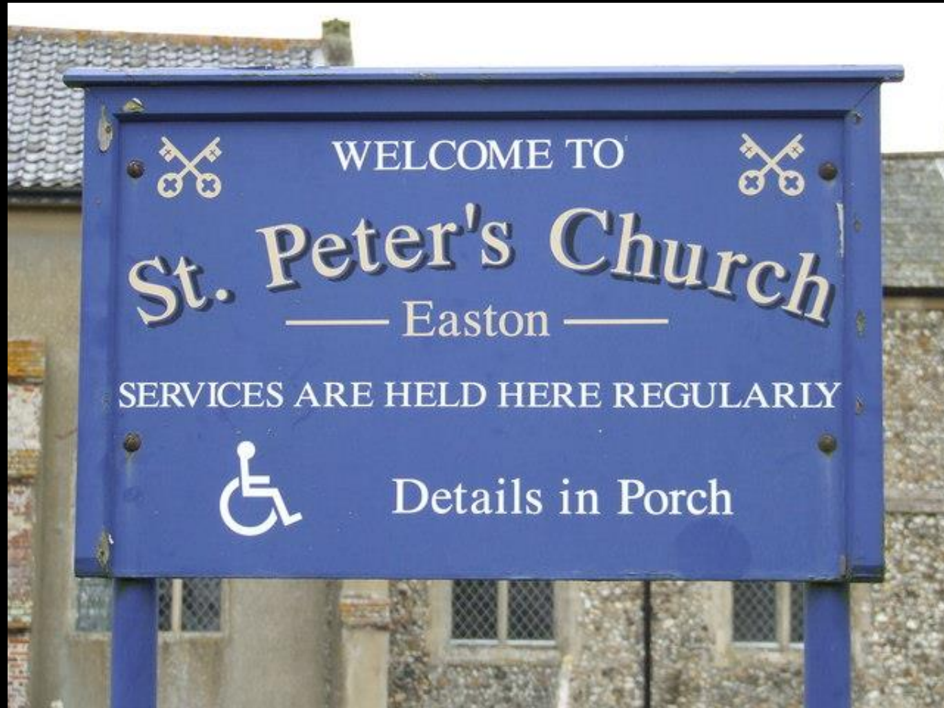
Welcoming Handicapped Information on Church Sign -- St. Peter's, Norfolk, England