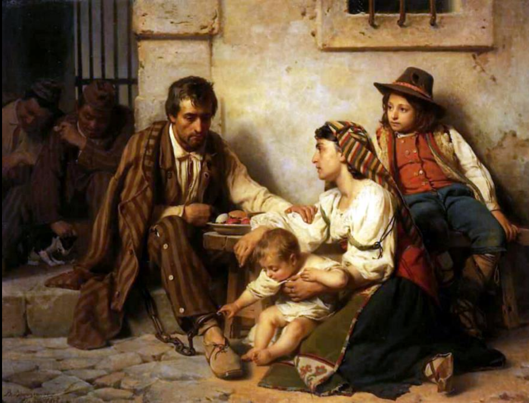
Appointment of a Prisoner with his Family -- V. P. Vereschchagin, Tretyakov Gallery, Moscow, Russia