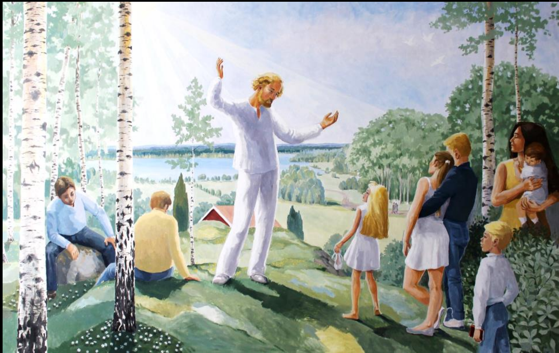
Jesus Preaching in the Present -- Söraby kyrka, Rottne, Sweden