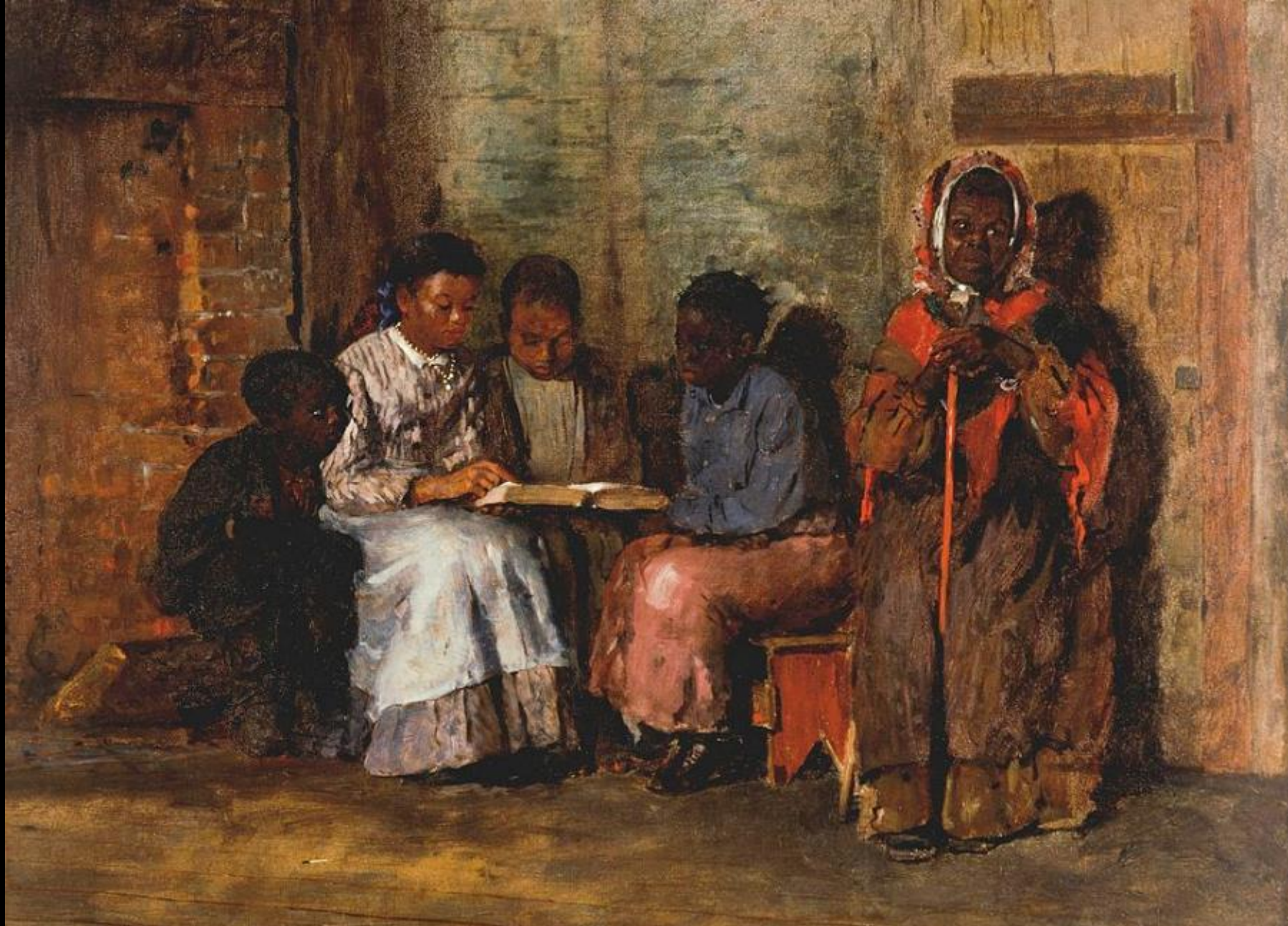
Sunday Morning in Virginia -- Winslow Homer, Cincinnati Art Museum, Cincinnati, Ohio