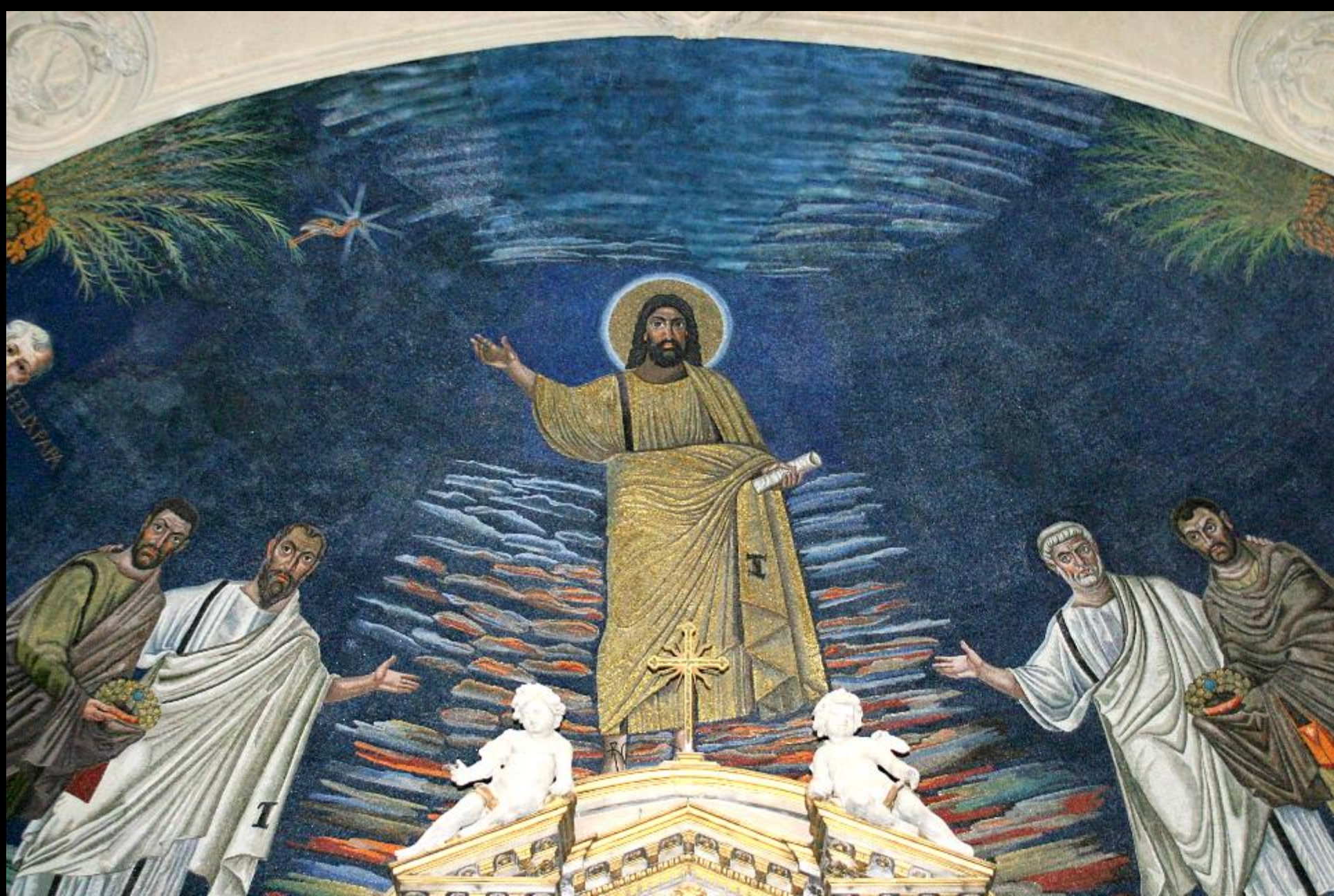
Apse Mosaic -- Basilica of Cosmas and Damien, Rome, Italy