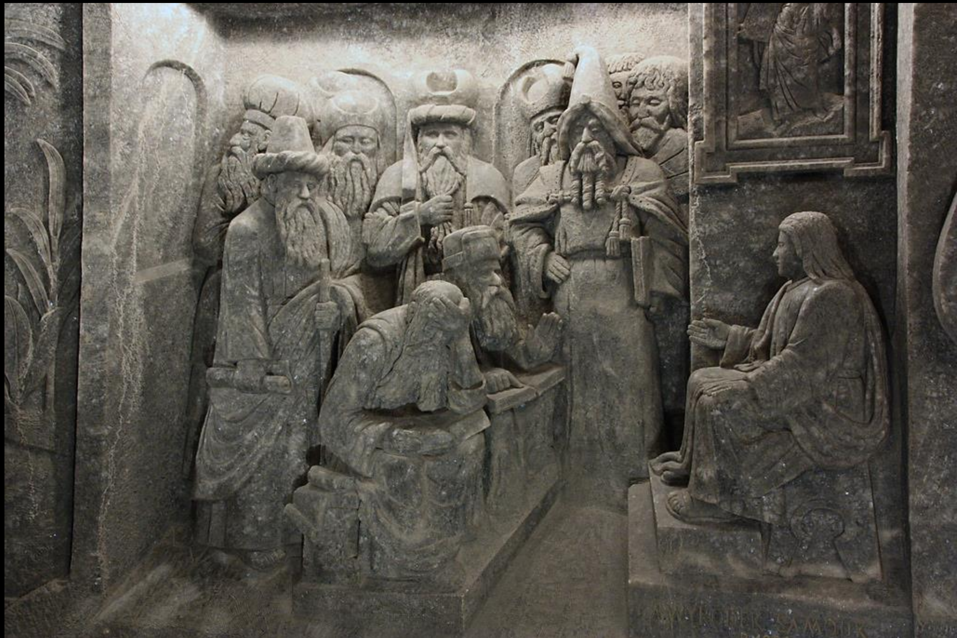
Christ Teaching -- Cathedral of Saint Kinga, in the salt mine of Wieliczka, Poland