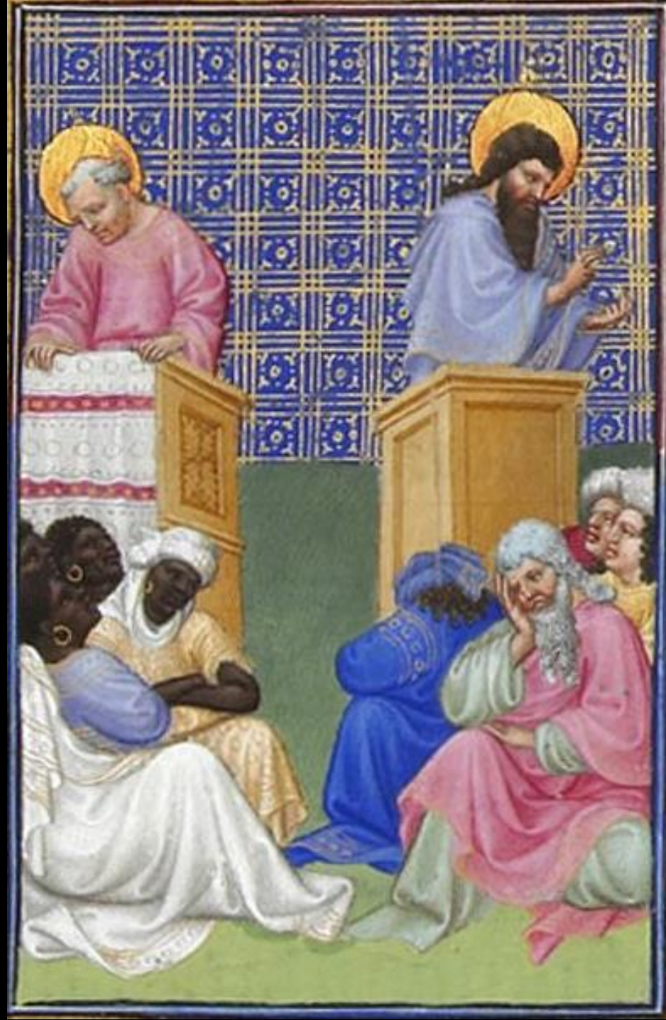
The Preaching of the Apostles

Les Très Riches Heures du duc de Berry Musée Condé Chantilly, France