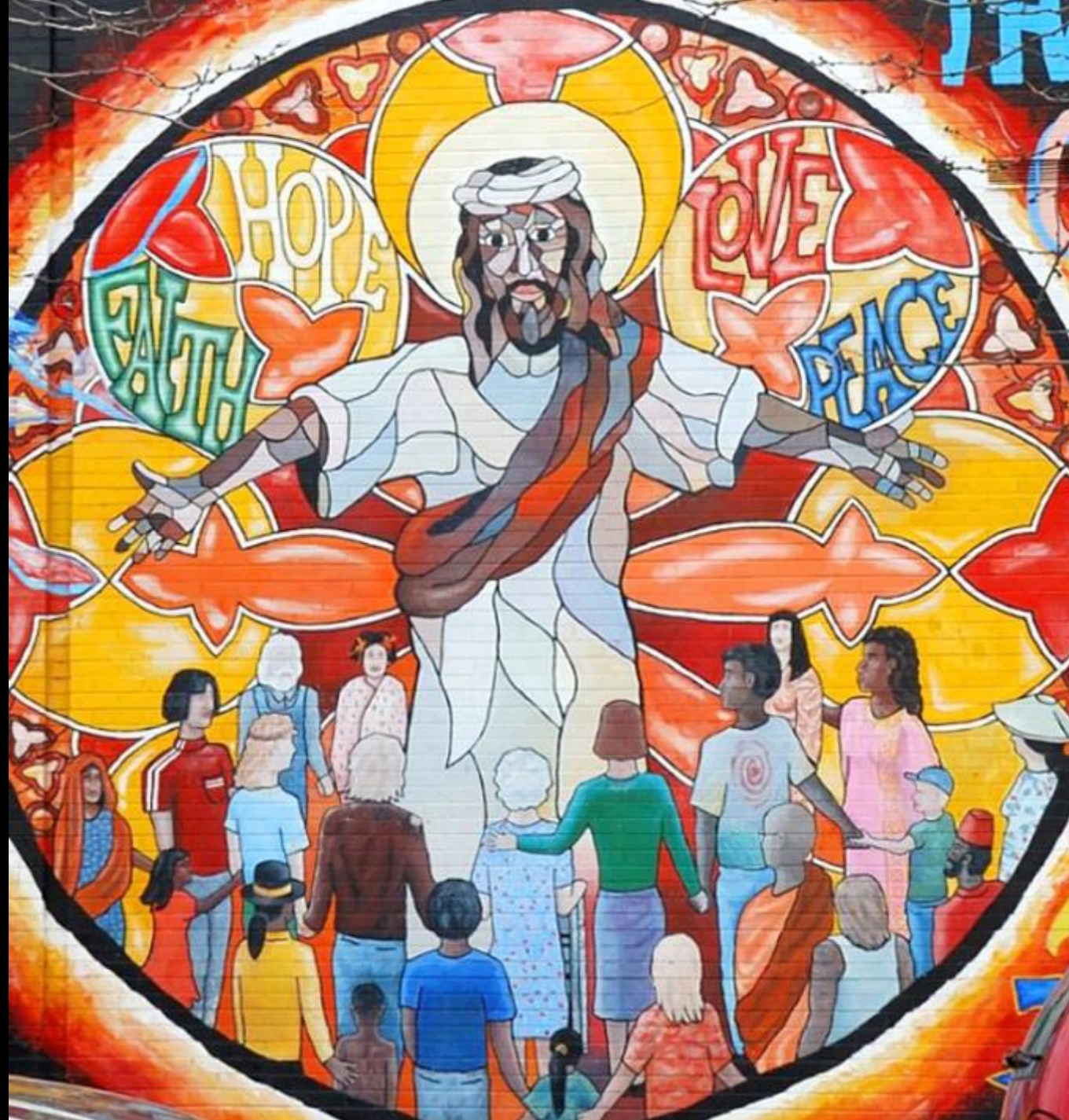
Jesus Mural of Faith, Hope, Love, and Peace