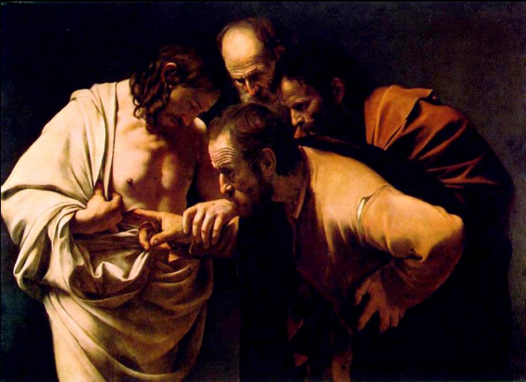
The Incredulity of Thomas -- Caravaggio, Sanssouci, Potsdam, Germany