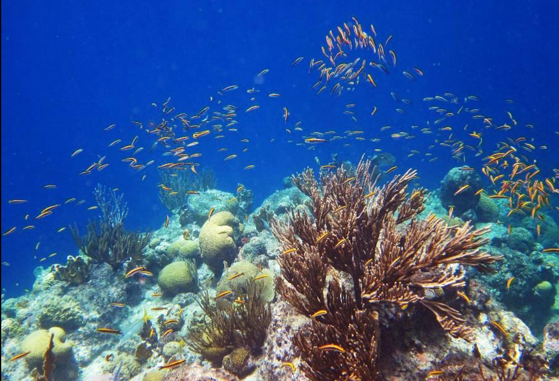
Coral Reef near Curacao