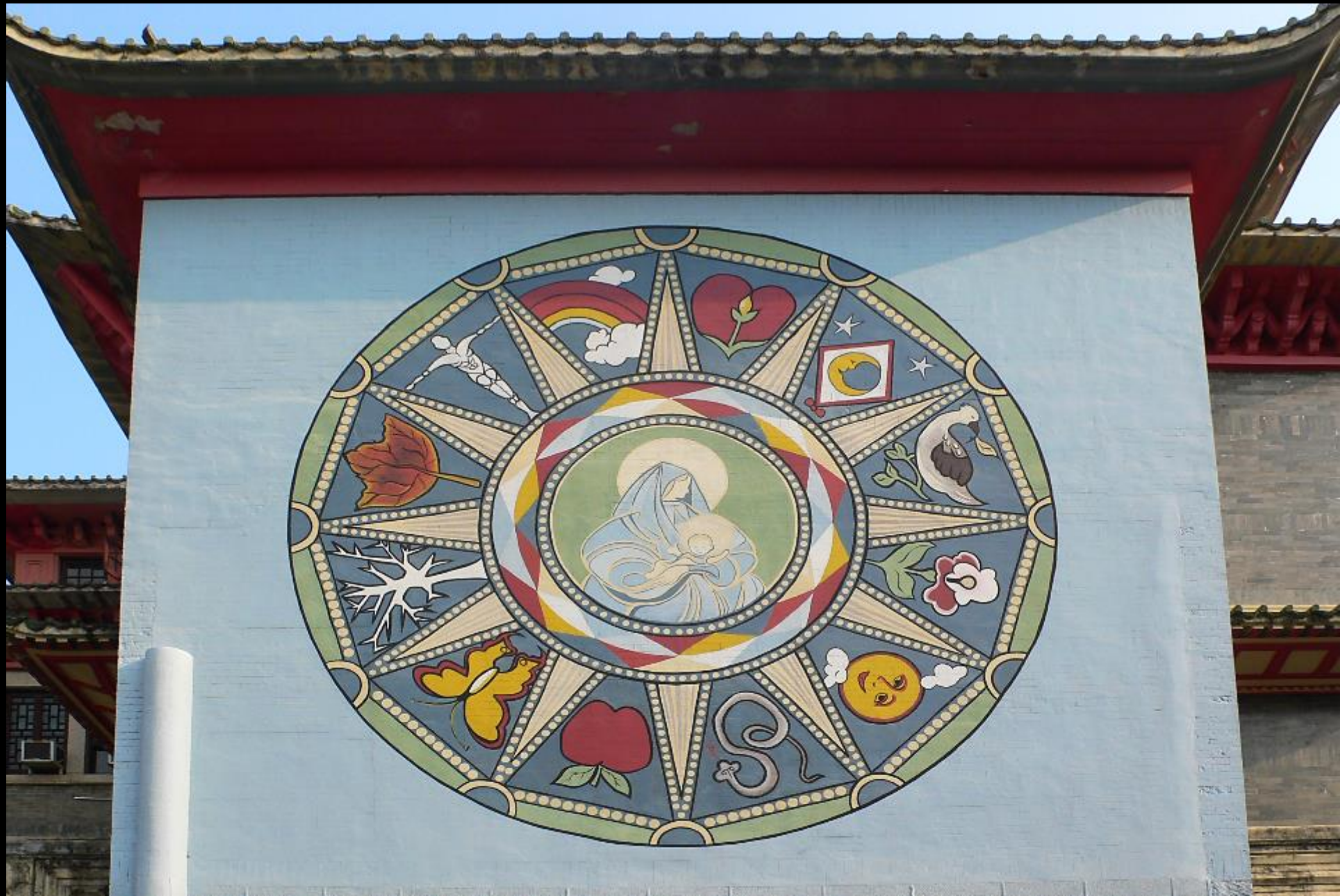
Holy Spirit -- Holy Spirit Seminary, Hong Kong, China