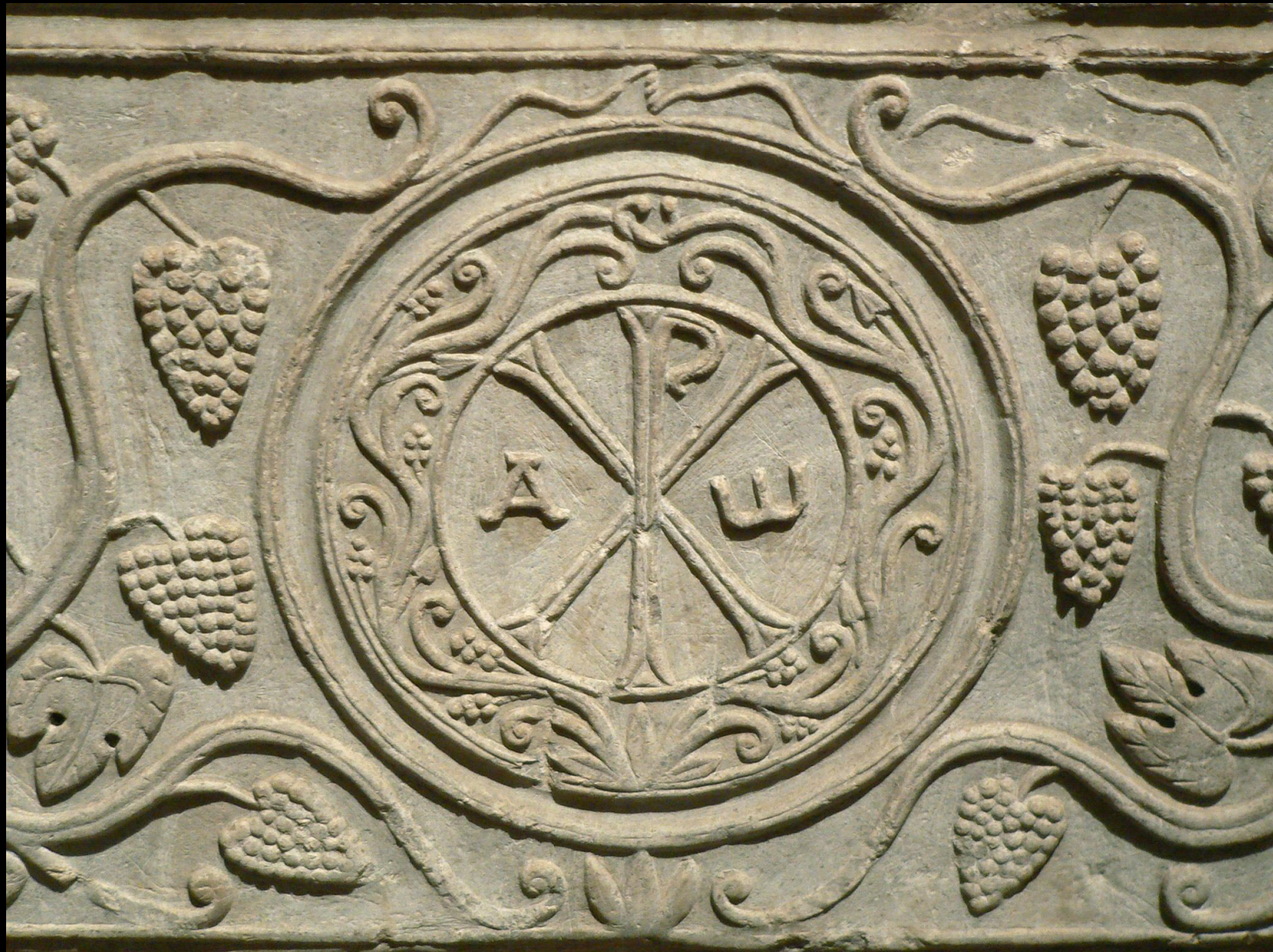
Sarcophagus of Drausin -- Louvre, Paris, France