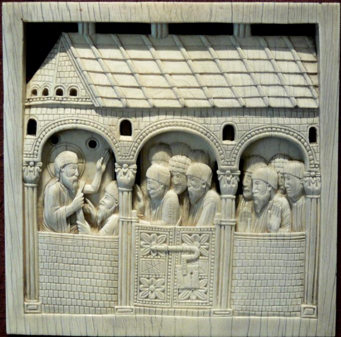
Christ Appearing to His Disciples

Bavarian National Museum, Munich, Germany