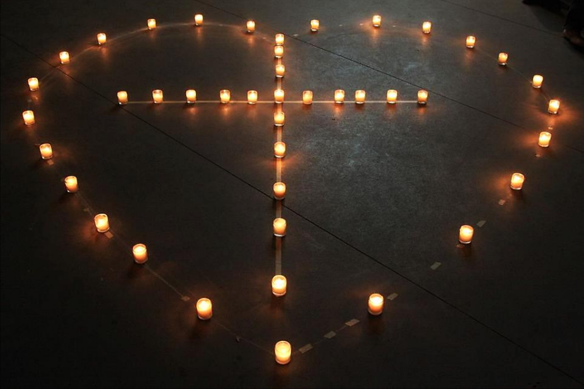
God is Love -- Camp Tejas, Giddings, Texas