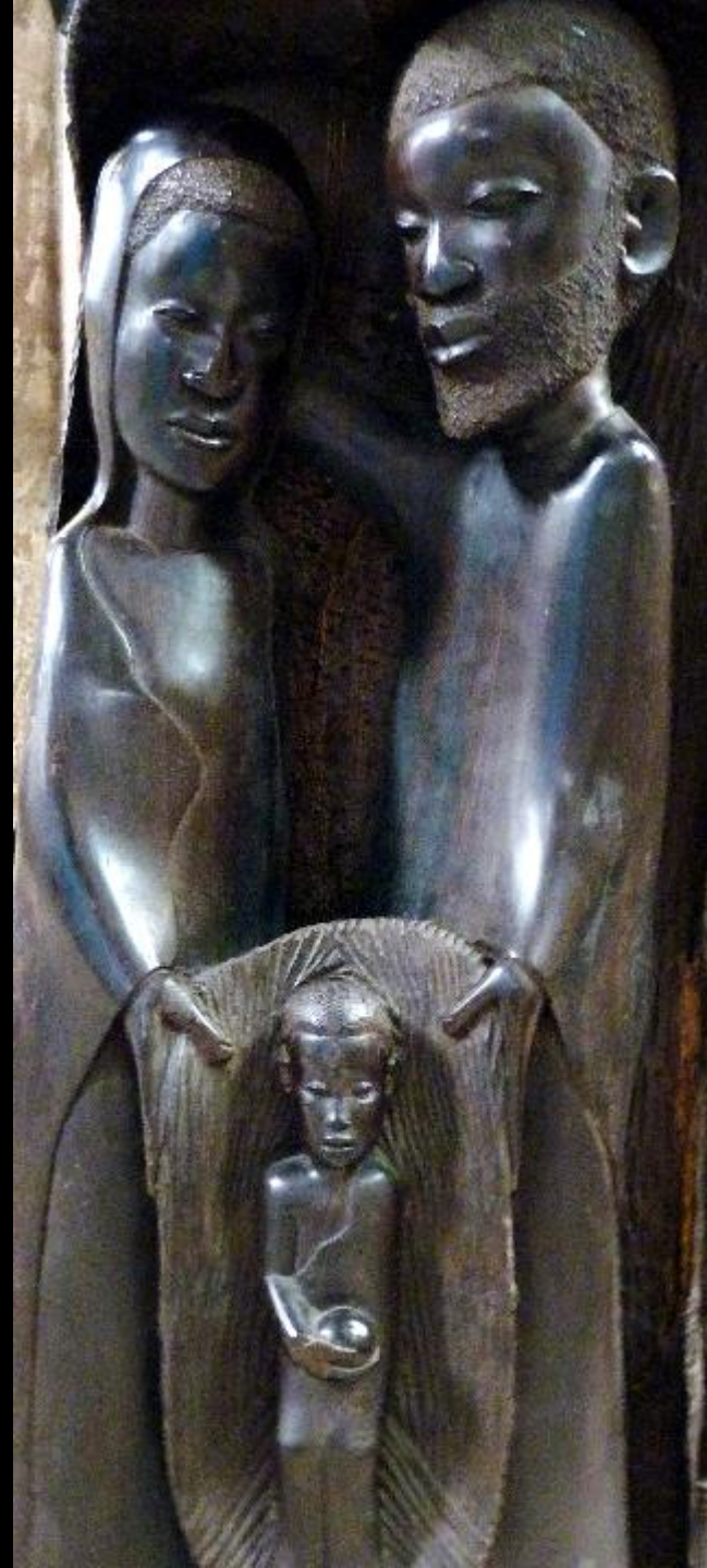
African Nativity St. Sebaldus Nuremburg, Germany