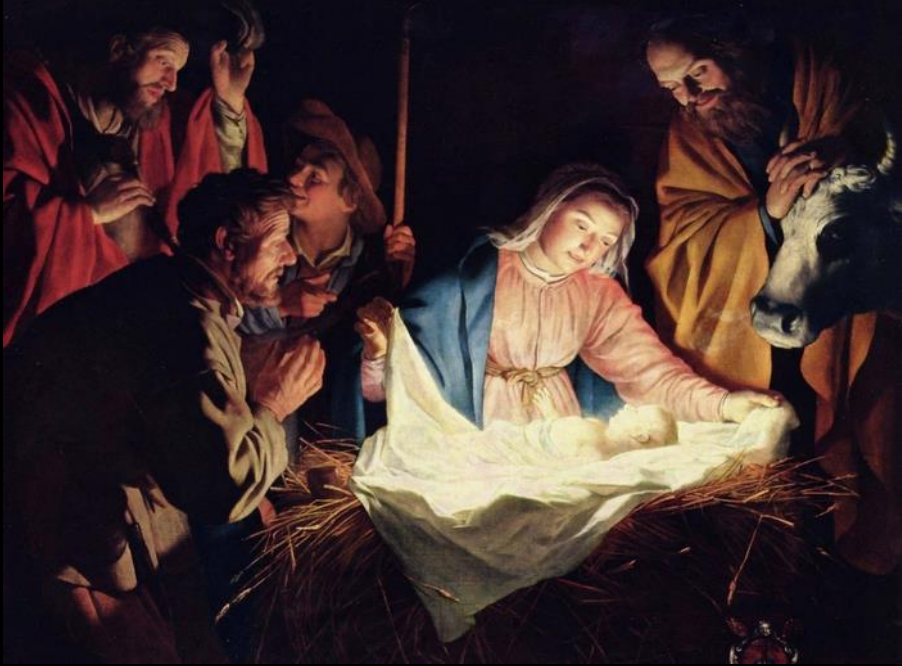
Adoration of the Shepherds -- Gerrit van Honthorst, Wallraf-Richartz Museum, Cologne, GDR