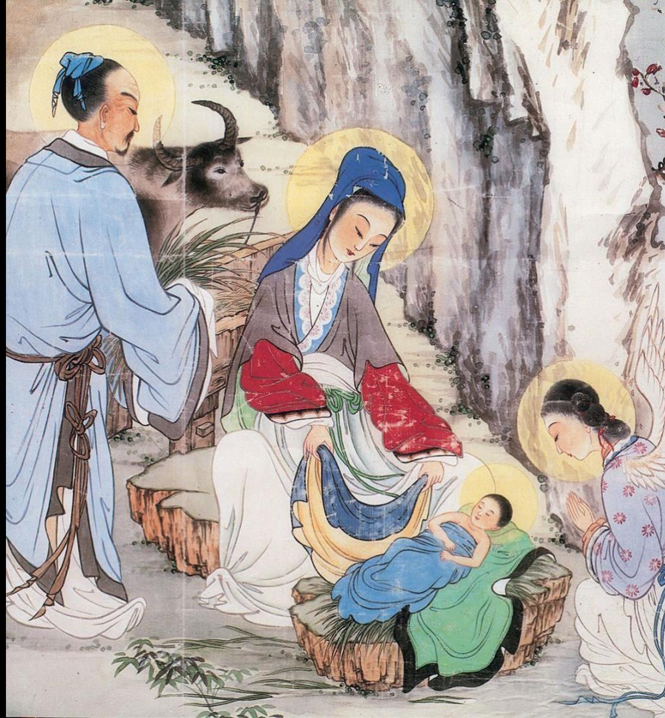
Birth of Christ