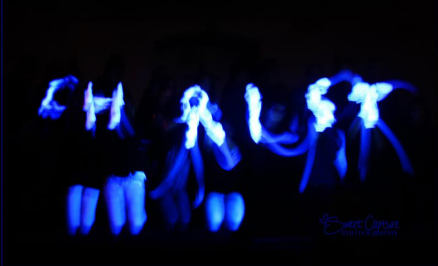
Light of the World -- Presentation by youth with gloves in dark space