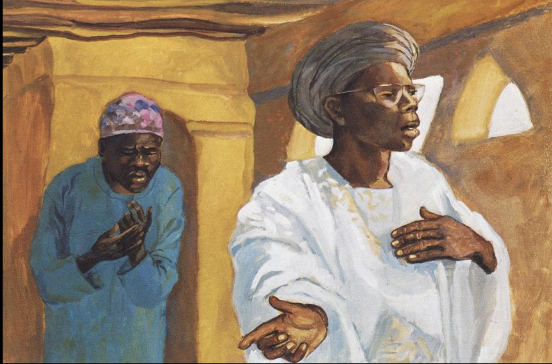
The Pharisee and the Tax Collector -- JESUS MAFA, Cameroon