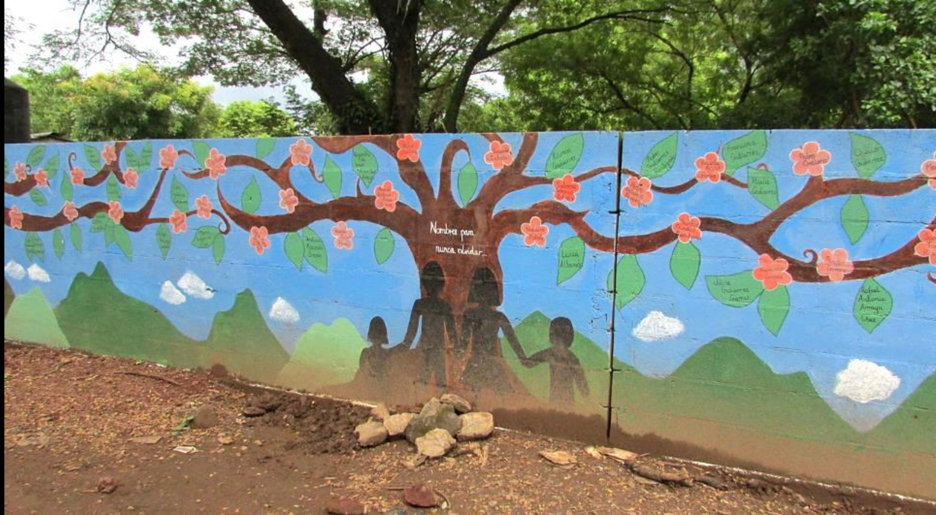
Tribute to the Lost Community Members from the Civil War -- Nuevo Gualcho, El Salvador