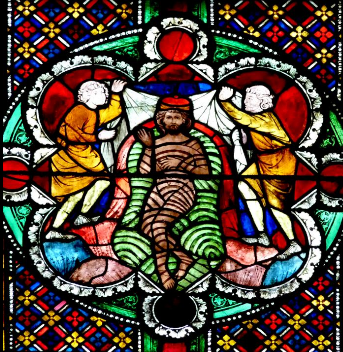
Naaman Bathes in the Jordan