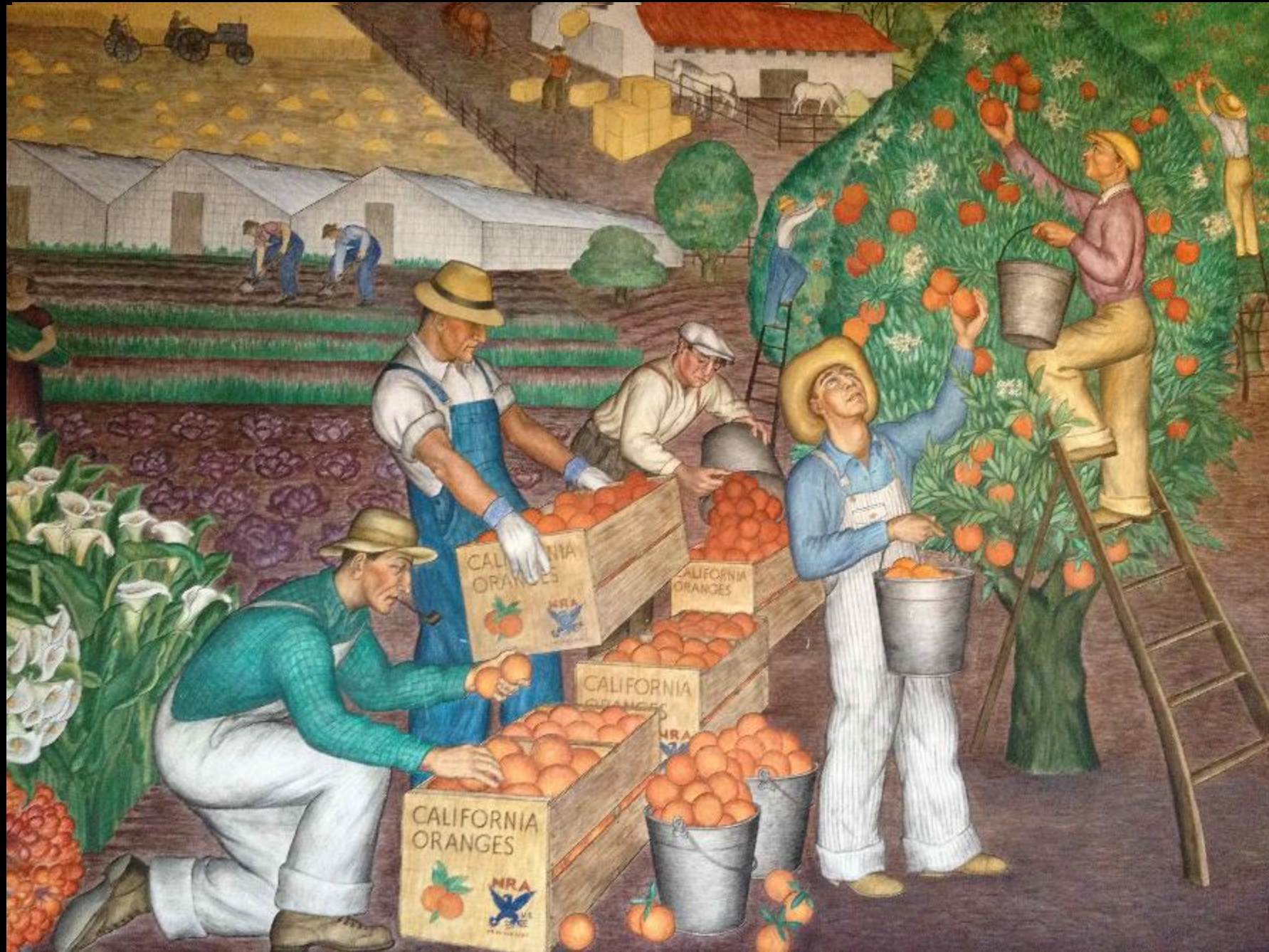
Migrant Farm Workers -- Mural, Coit Tower, San Francisco, CA