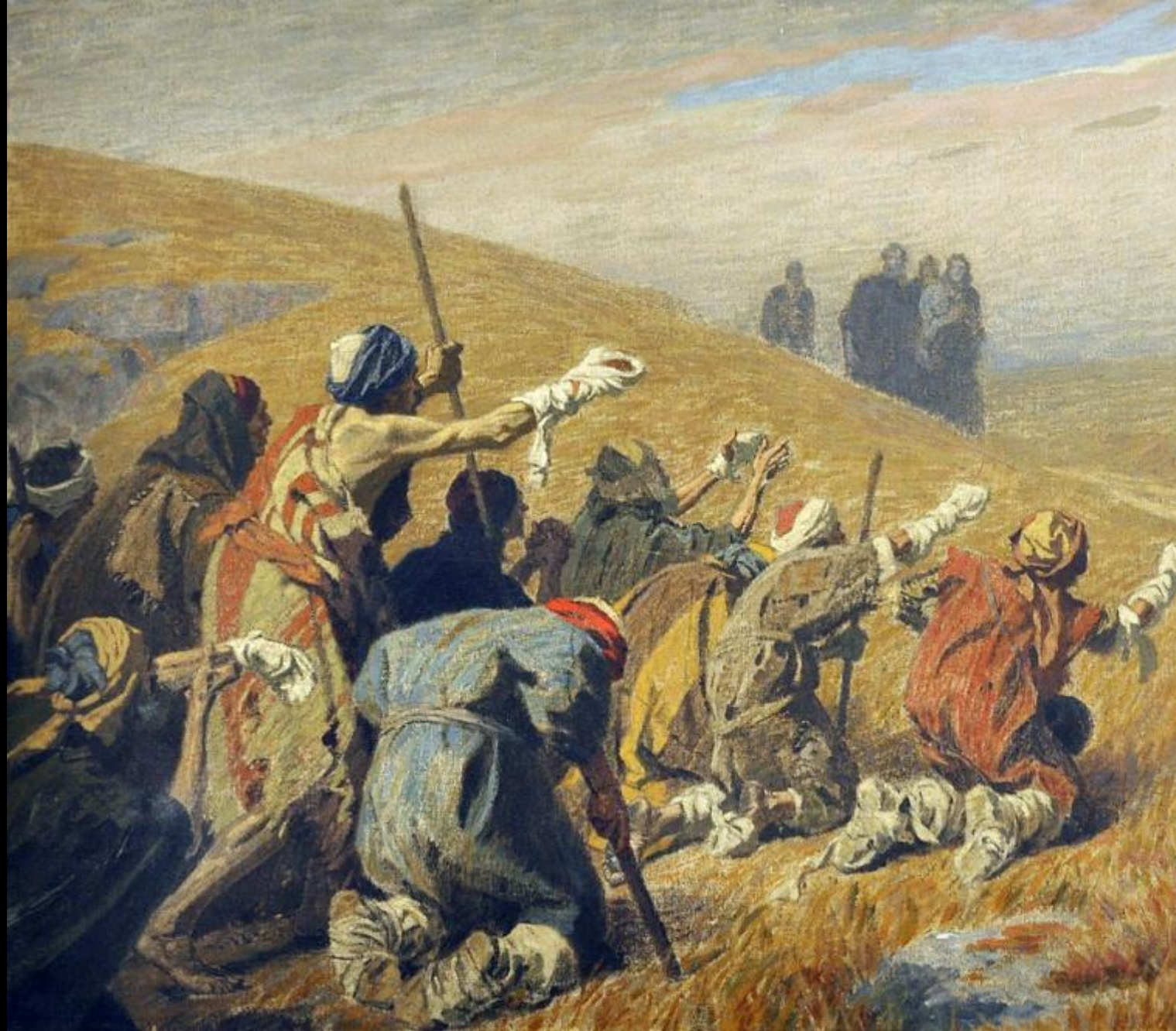
Ten Lepers Call Out to Jesus, detail -- Gebhard Fugel, Diocesan Museum, Freising, Germany