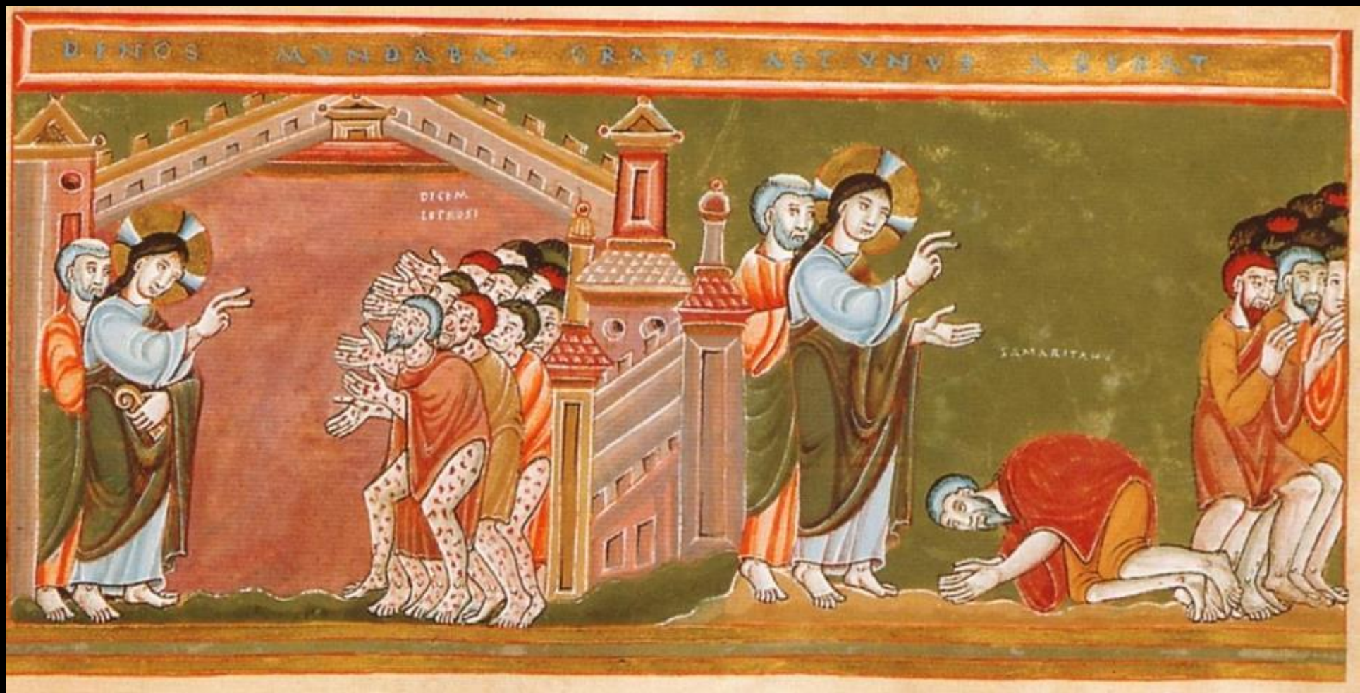
Christ and the Ten Lepers -- Codex Aureus Epternacensis, Freising, Germany