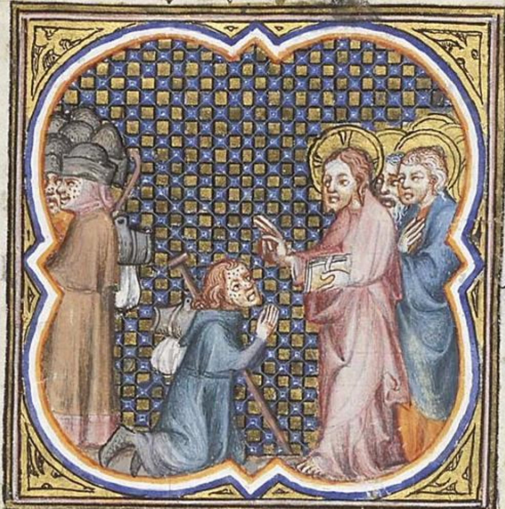
Christ Heals the Ten Lepers

National Library of the Netherlands Hague, Netherlands