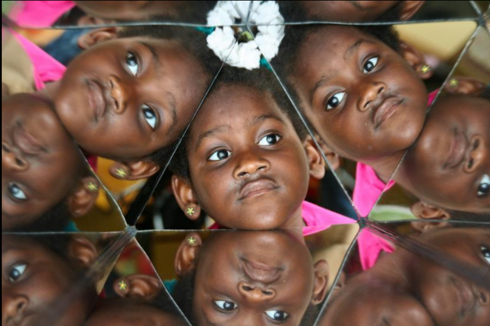
Lourdie Prism Mirror Reflections -- Children's Museum, Grand Rapids, MI