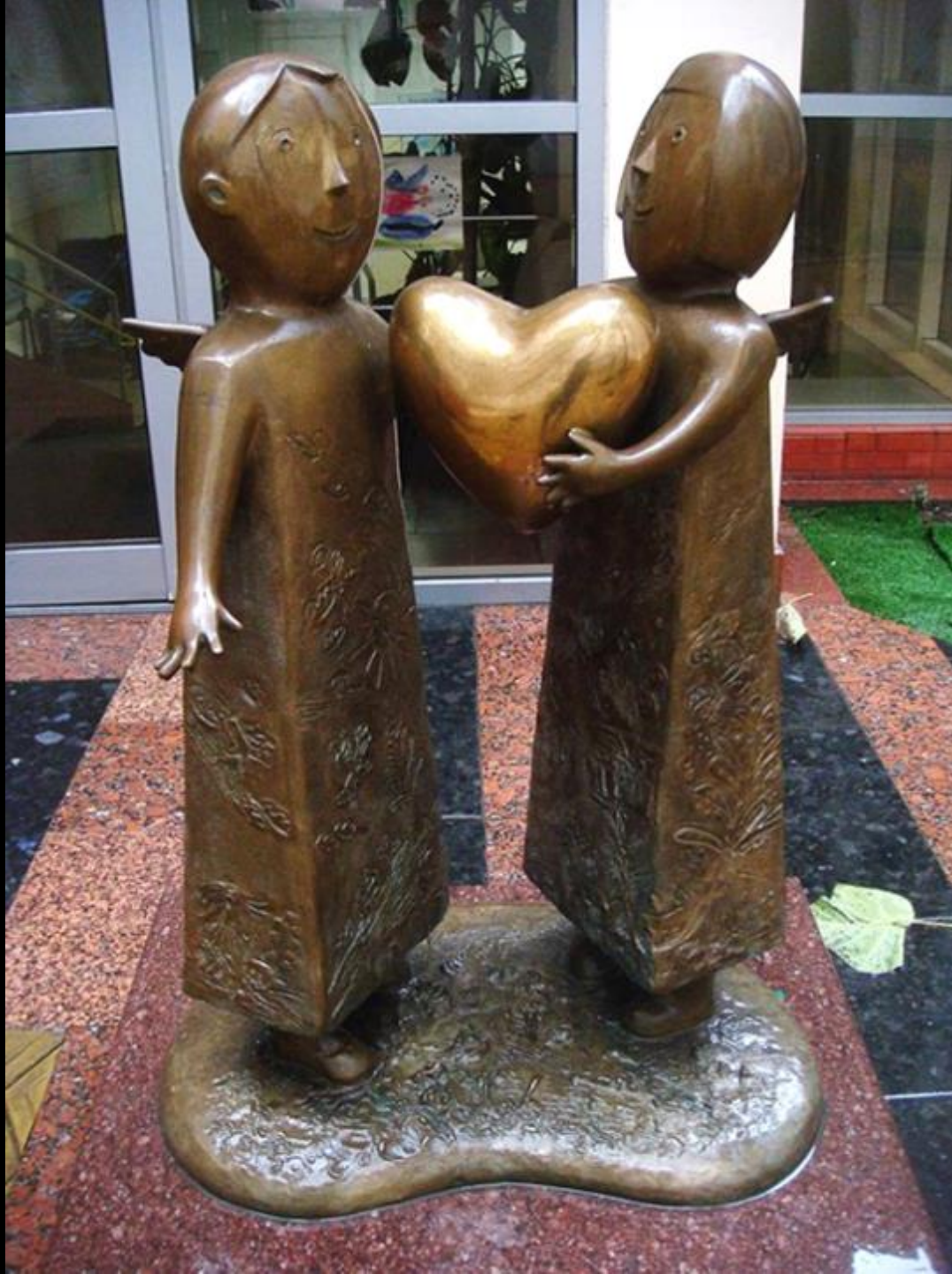
Heart of the World

Mikhail Reva Odessa Children's Hospital Odessa, Ukraine