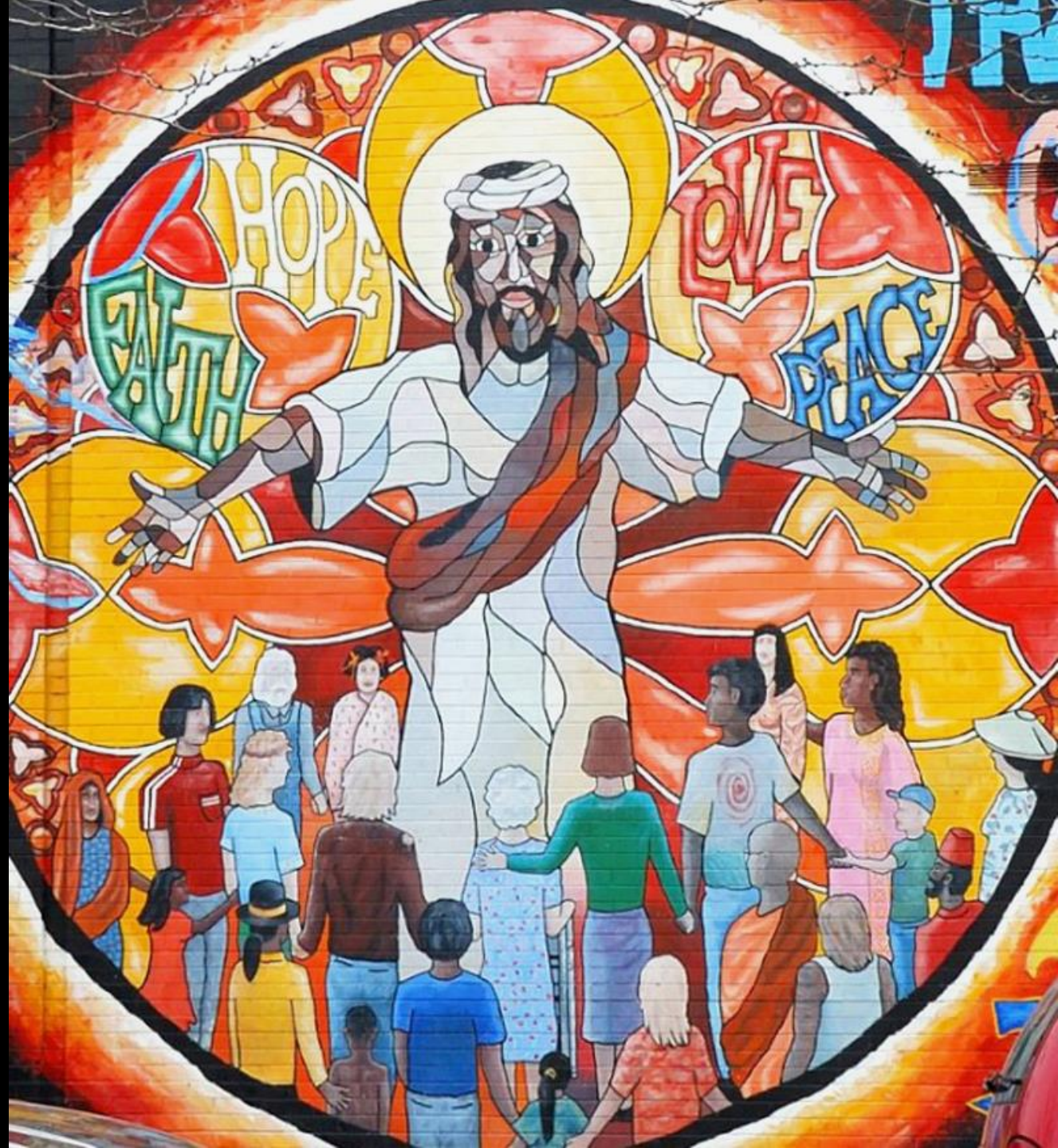
Jesus Mural of Faith, Hope, Love, and Peace