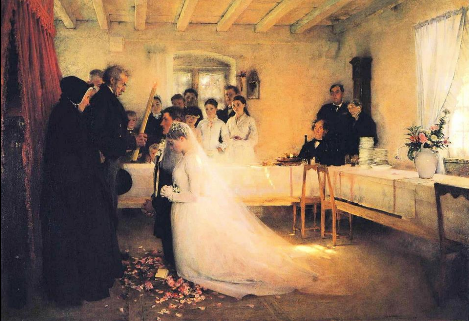
Blessing the Young Couple -- Pascal Dagnan-Bouveret, Pushkin Museum of Fine Arts, Moscow, Russia