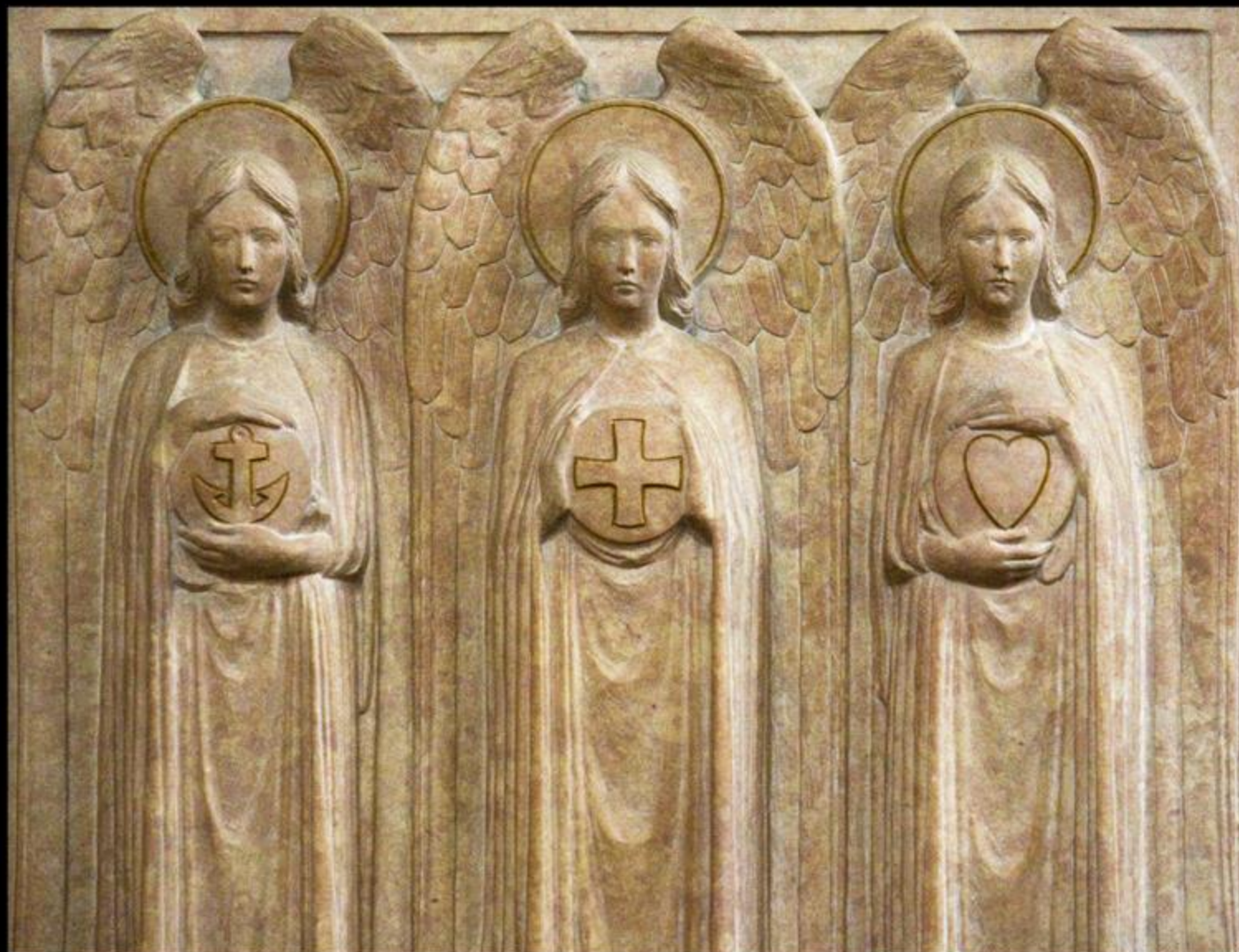
Faith, Hope, and Love -- St. Giles Cathedral, Edinburgh, Scotland