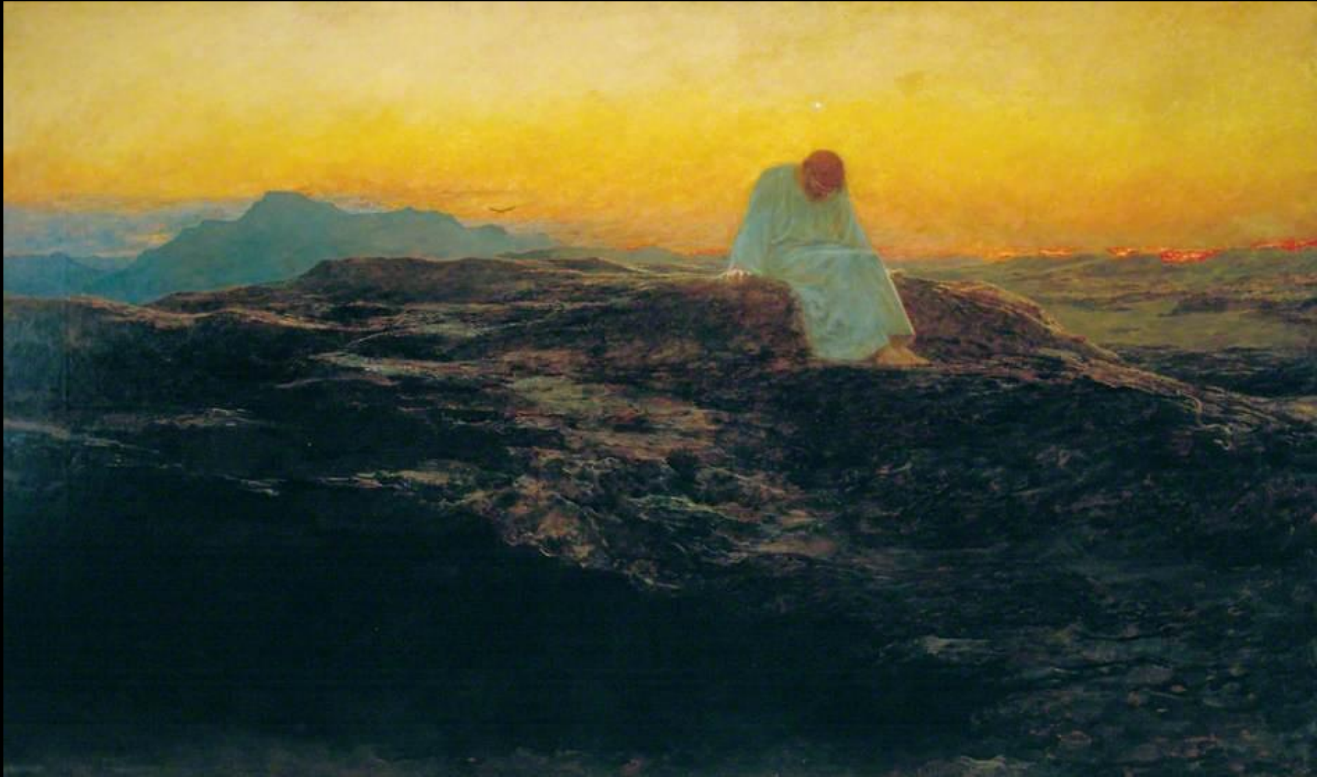
Temptation in the Wilderness -- Briton Riviere, Guildhall Art Gallery, London, England