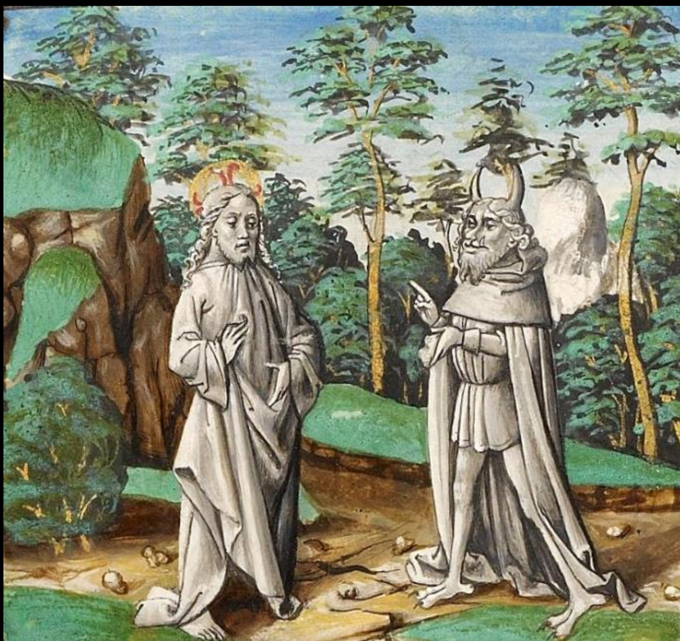
First Temptation of Christ -- Late 15 th c. manuscript, Getty Center, Los Angeles, CA