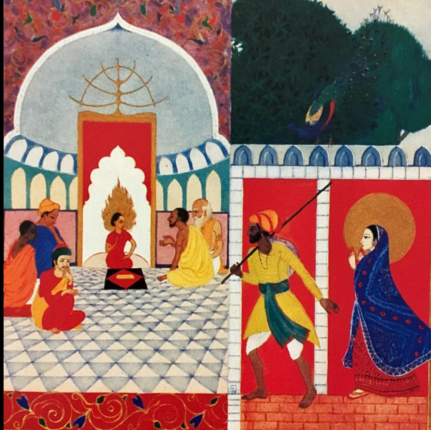
Boy Jesus in the Temple