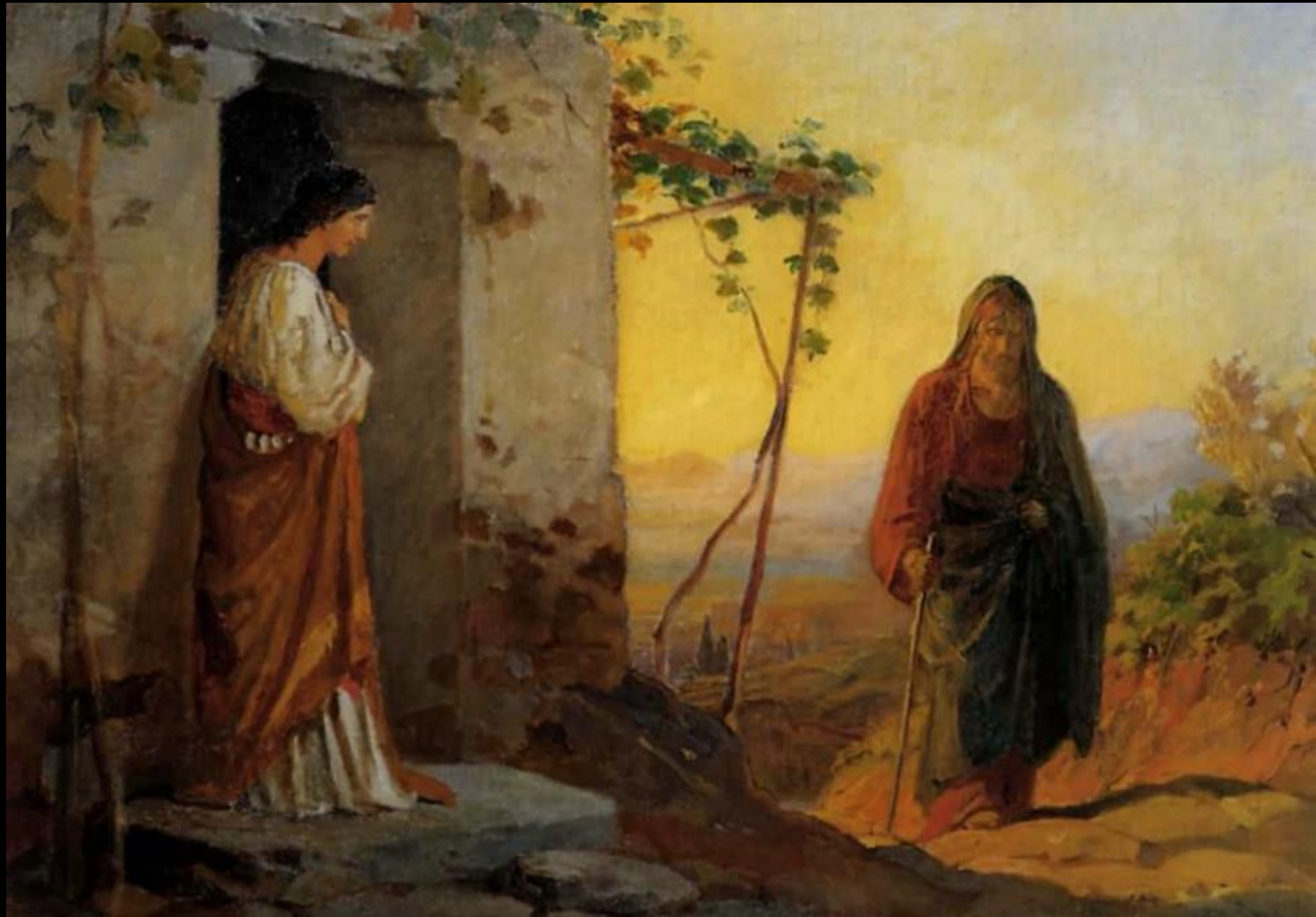
Mary, Sister of Lazarus, Greets Jesus -- Nikolai Ge, Russian, 1864