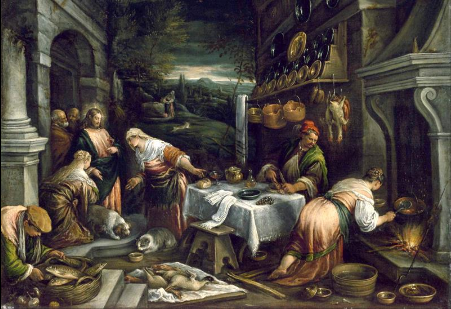
Christ in the House of Mary, Martha, and Lazarus -- Jacopo Bassano, Museum of Fine Arts, Houston, TX