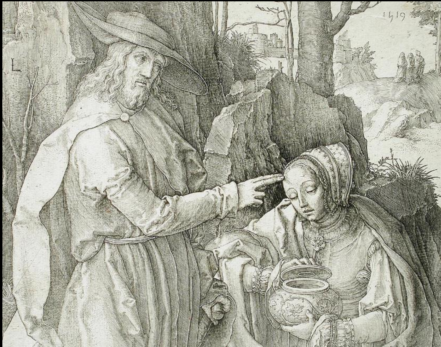
Christ Appears to Mary in the Garden -- Lucas van Leyden, Los Angeles County Museum of Art, CA