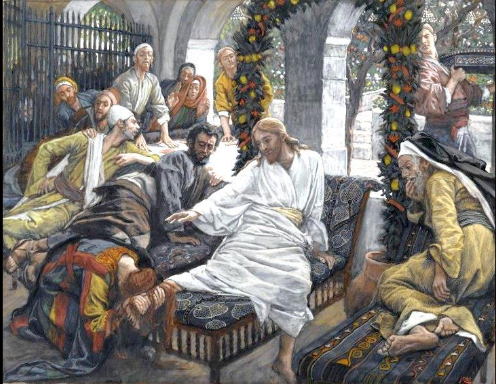
The Perfume of the Magdalene -- James Tissot, Brooklyn Museum, New York, NY