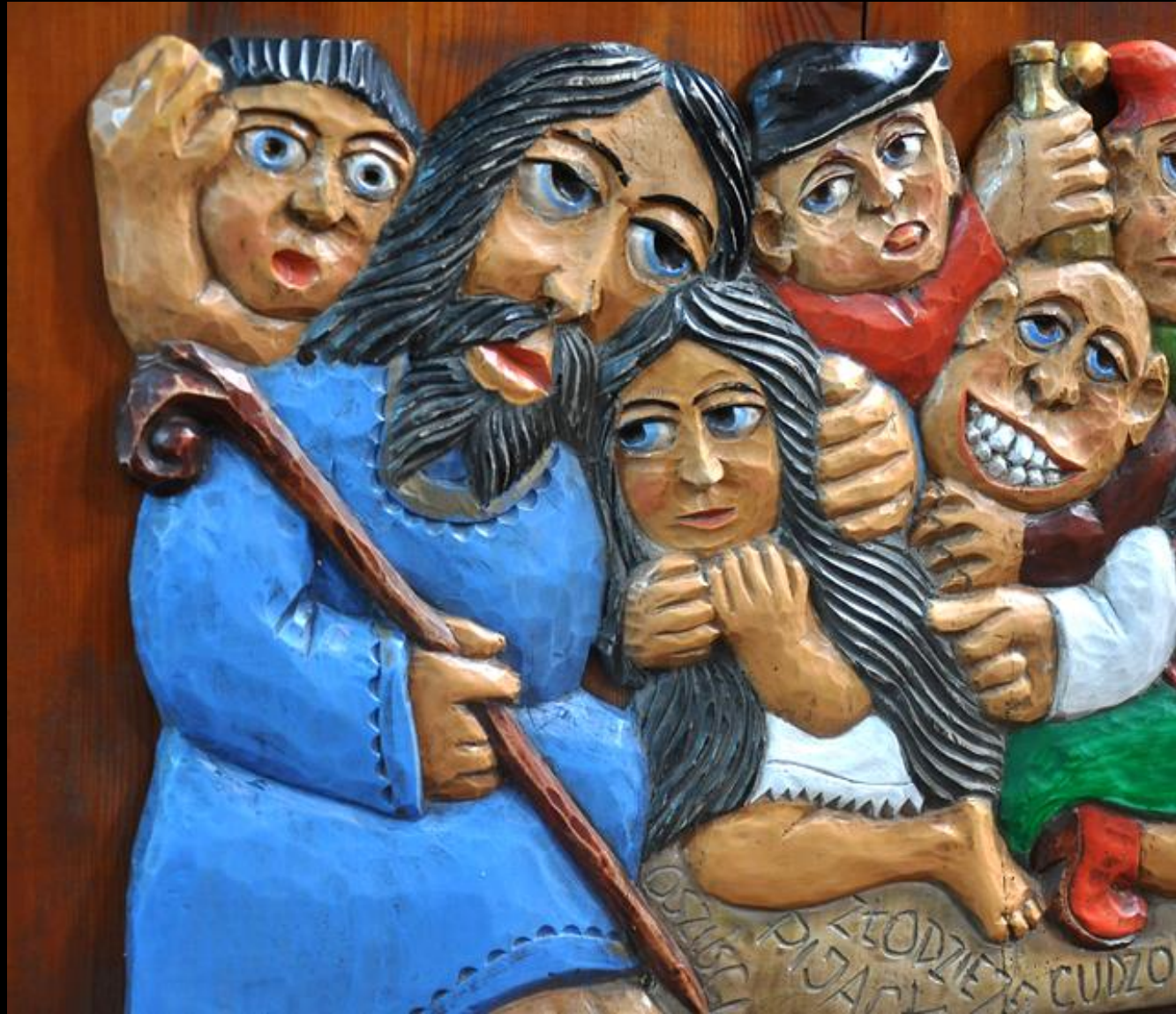
Mary of Bethany and Jesus -- Woodcarving, Paszyn, Poland