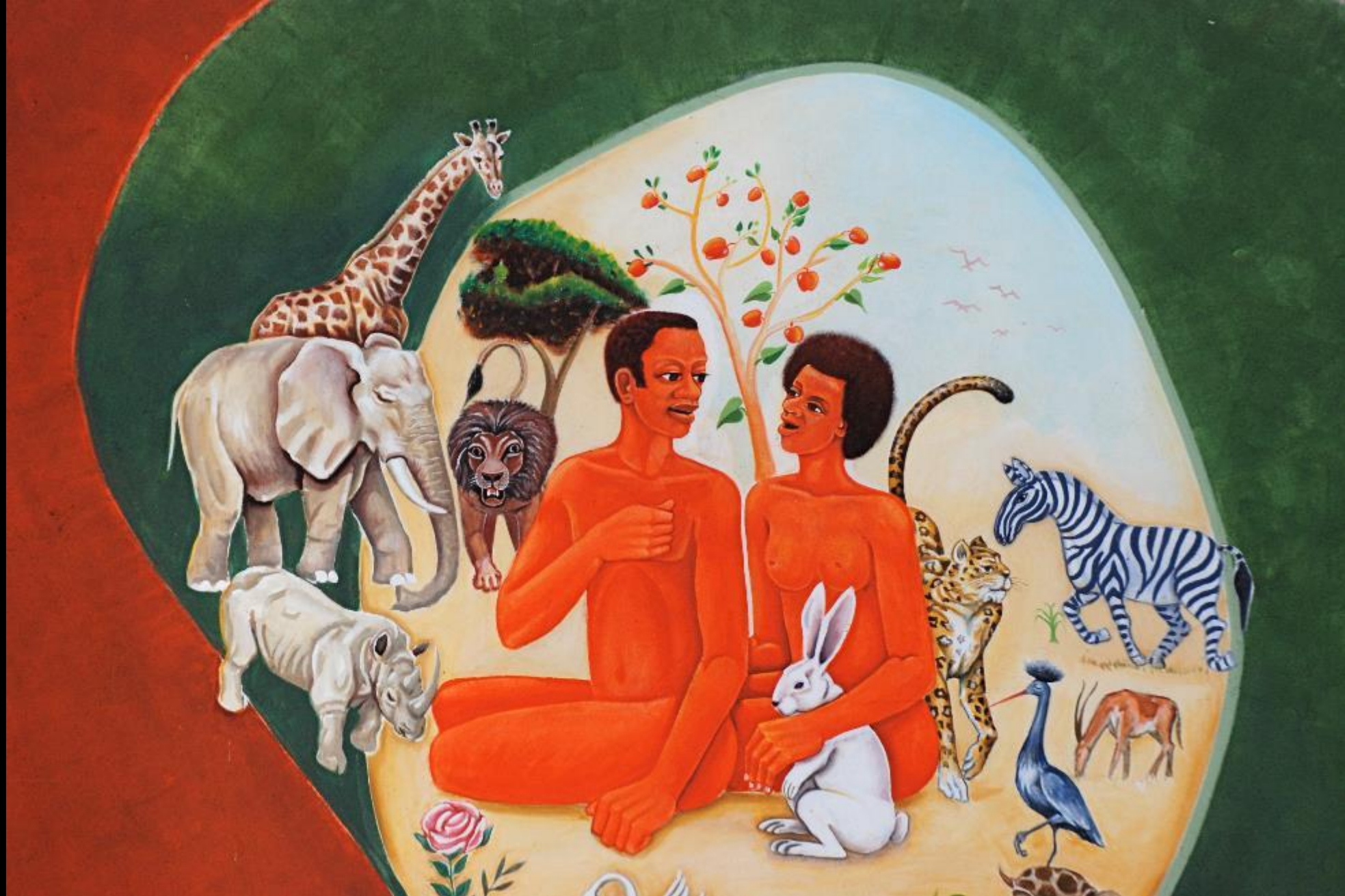
Creation -- Songea Cathedral, Tanzania