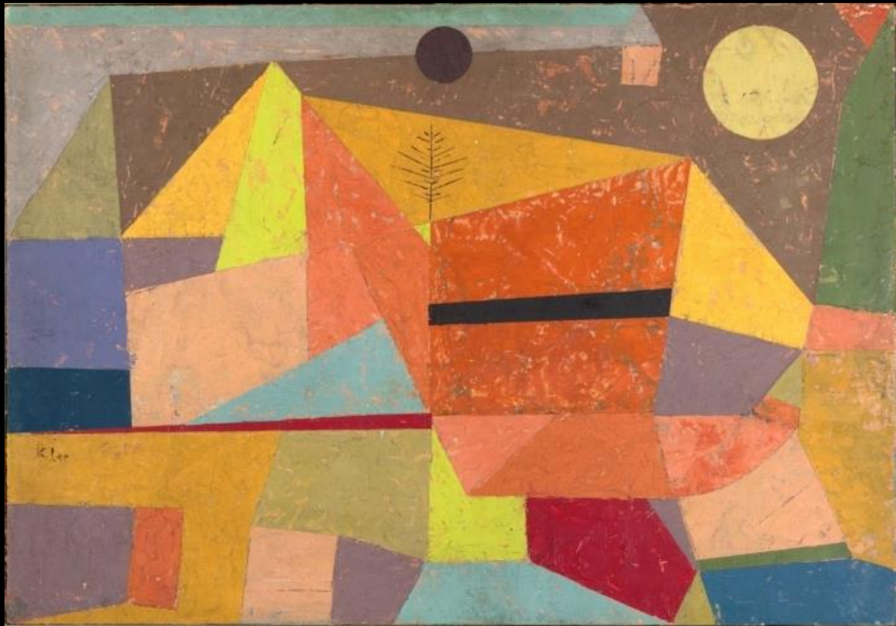
Joyful Mountain Landscape -- Paul Klee, Yale University Art Gallery, New Haven , CT