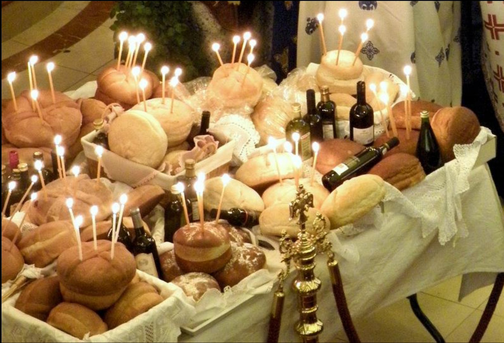
Breaking of Bread Service -- Annunciation Greek Orthodox Cathedral, Toronto, Canada