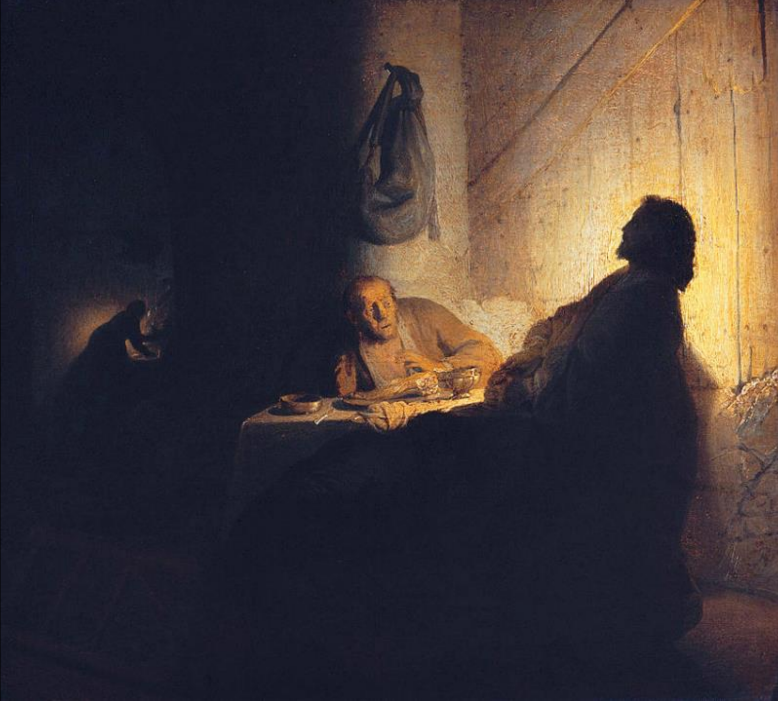
Supper at Emmaus