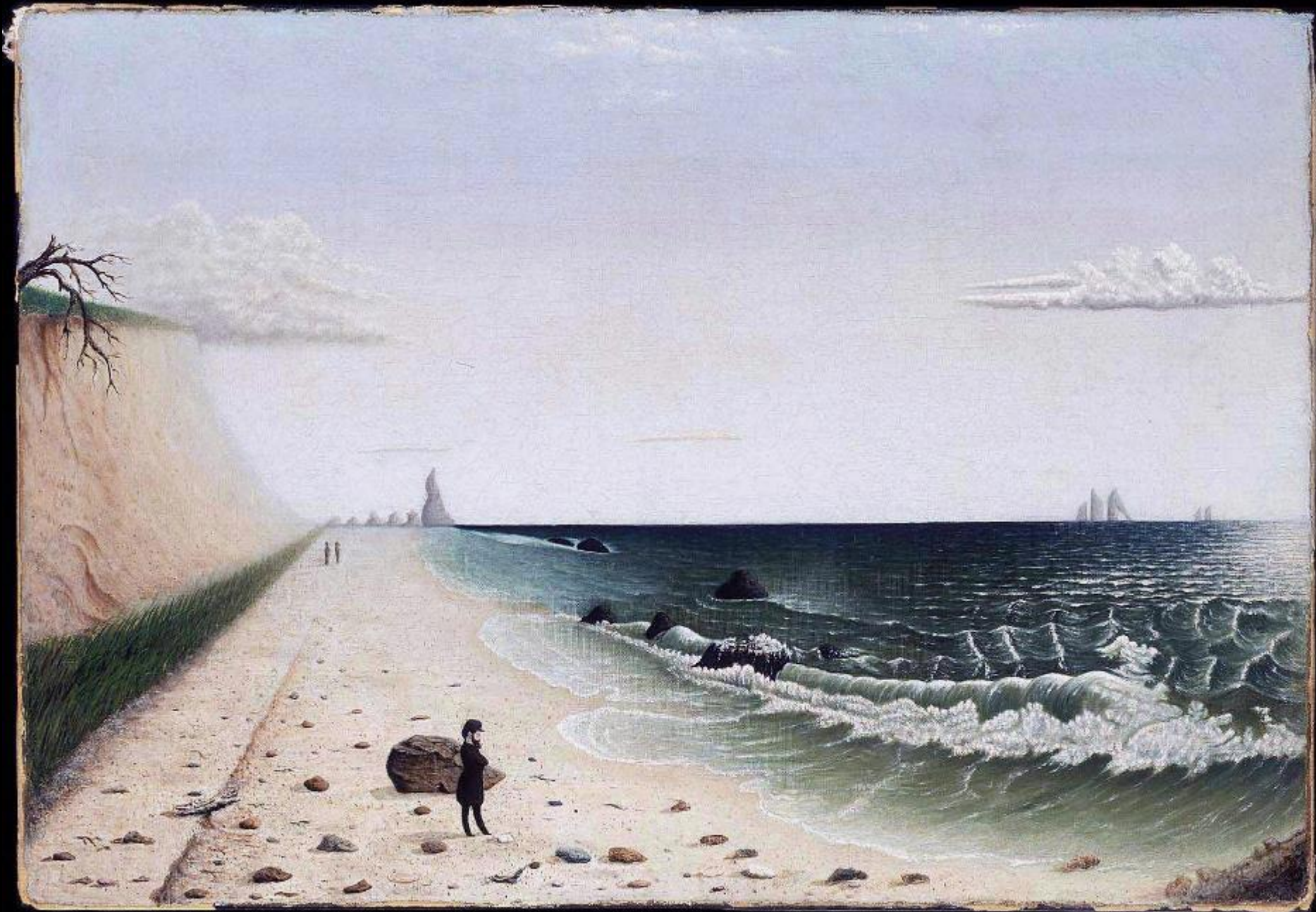
Meditation by the Sea -- American, Museum of Fine Arts, Boston