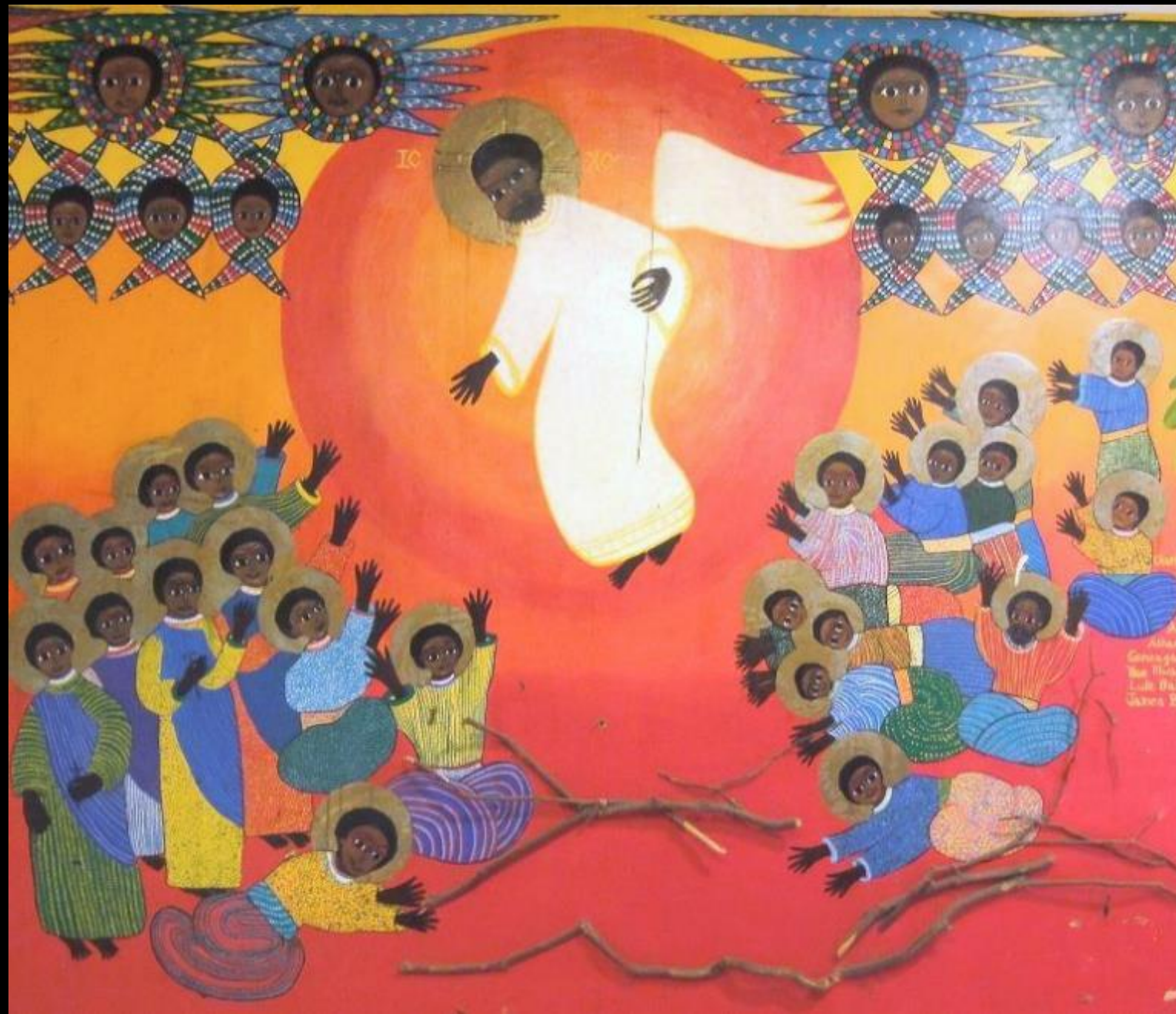
Emmaus House – Martyrs of Uganda, Kamapala, Uganda