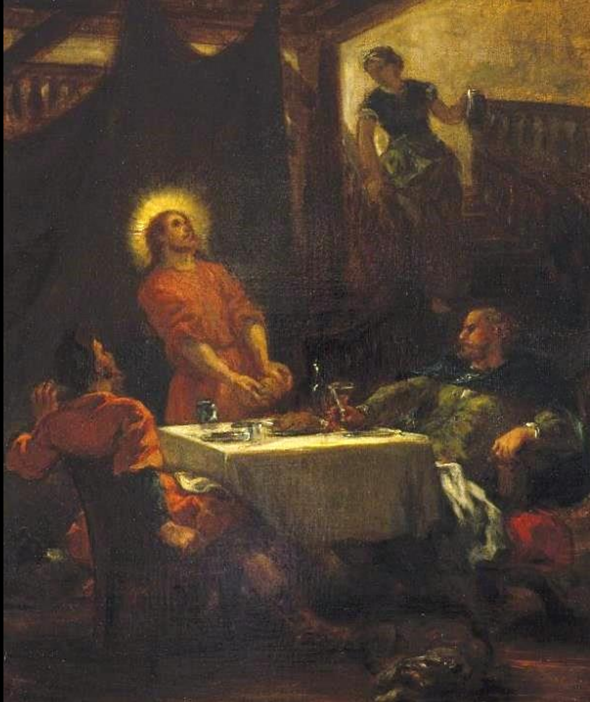
Disciples at Emmaus

Eugene Delacroix Brooklyn Museum New York