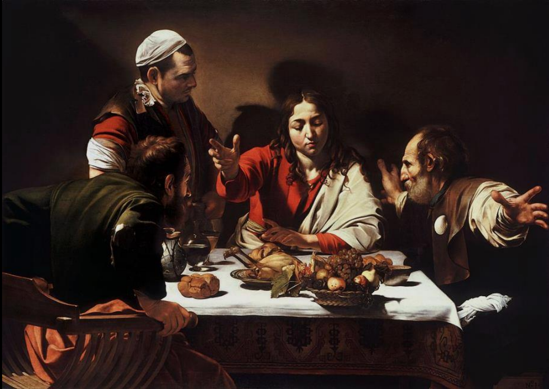
Supper at Emmaus -- Caravaggio, National Gallery, London