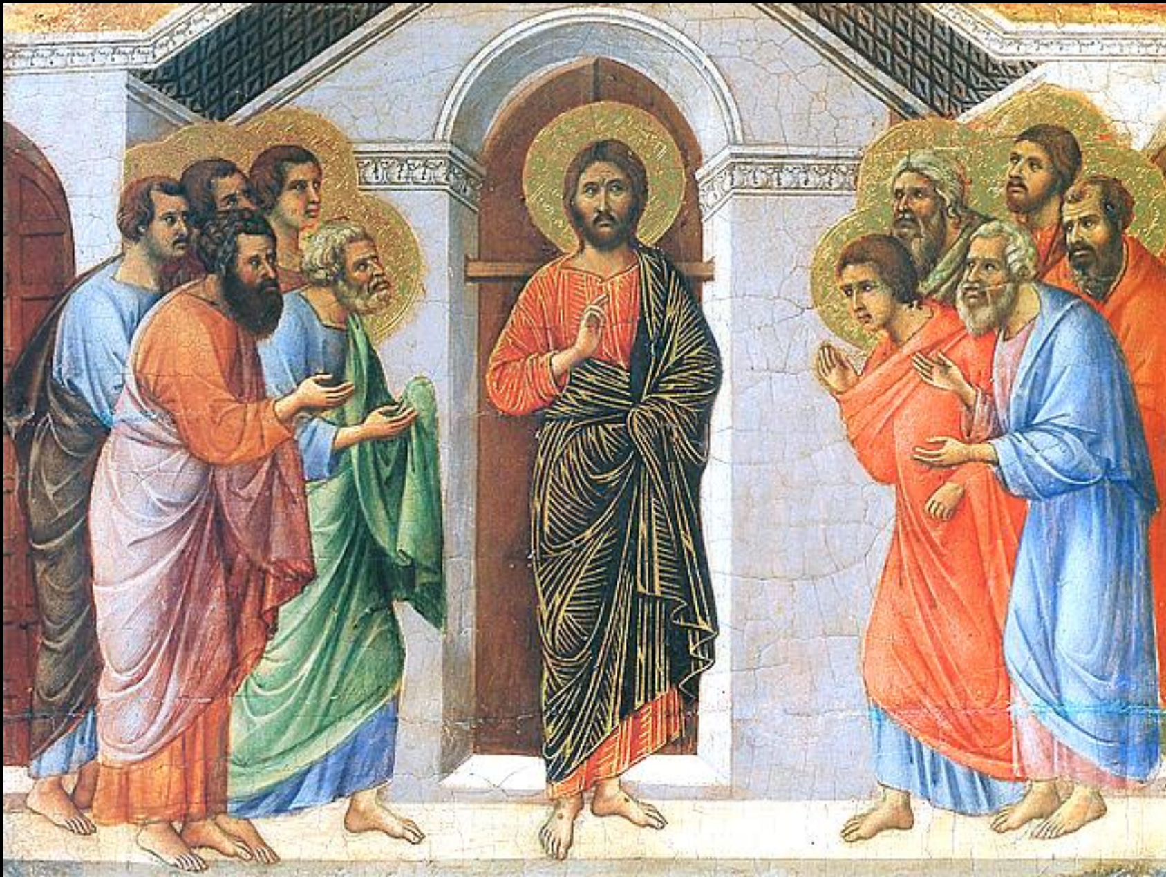
Christ Appears to the Apostles -- Duccio, Museo dell'Opera del Duomo, Siena, Italy