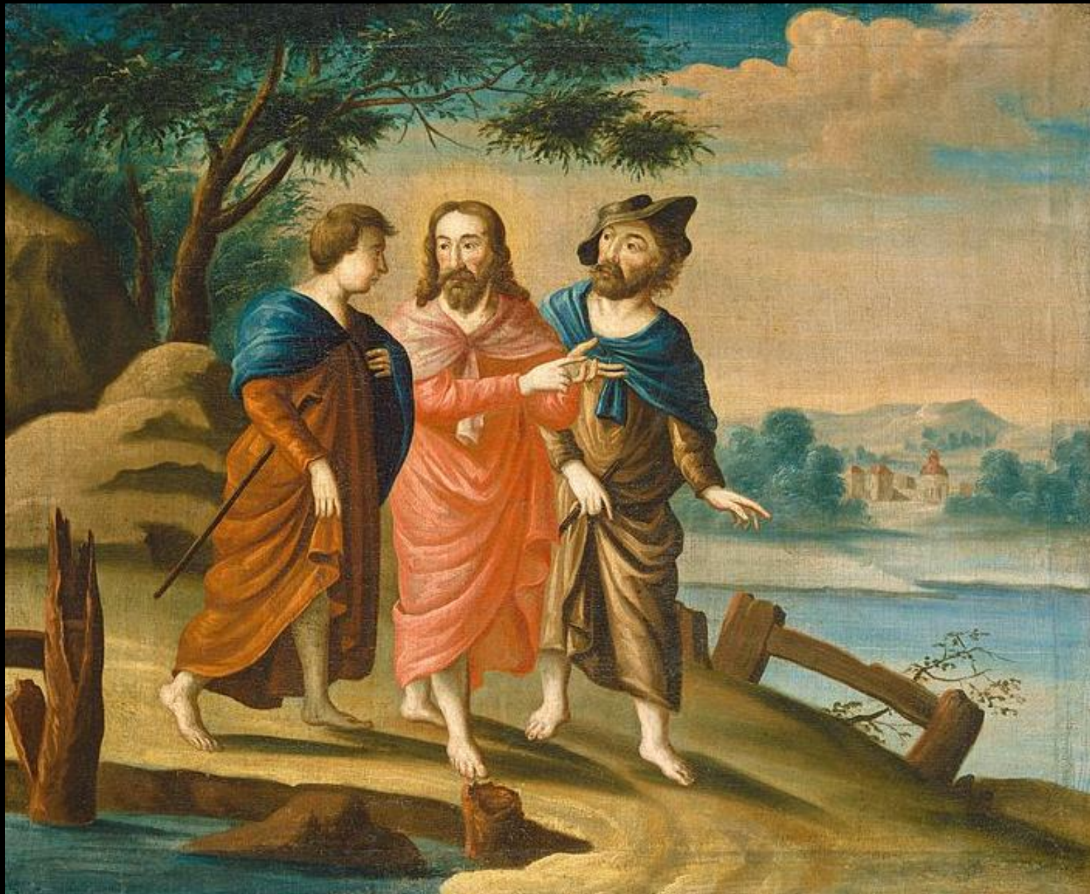
Road to Emmaus -- American, early 18 th c., National Gallery of Art, DC