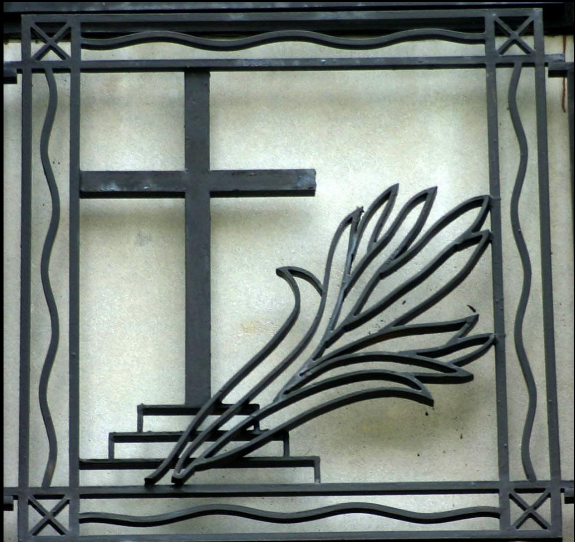
Cross with Wheat

Benton Chapel Vanderbilt Divinity School Nashville, TN