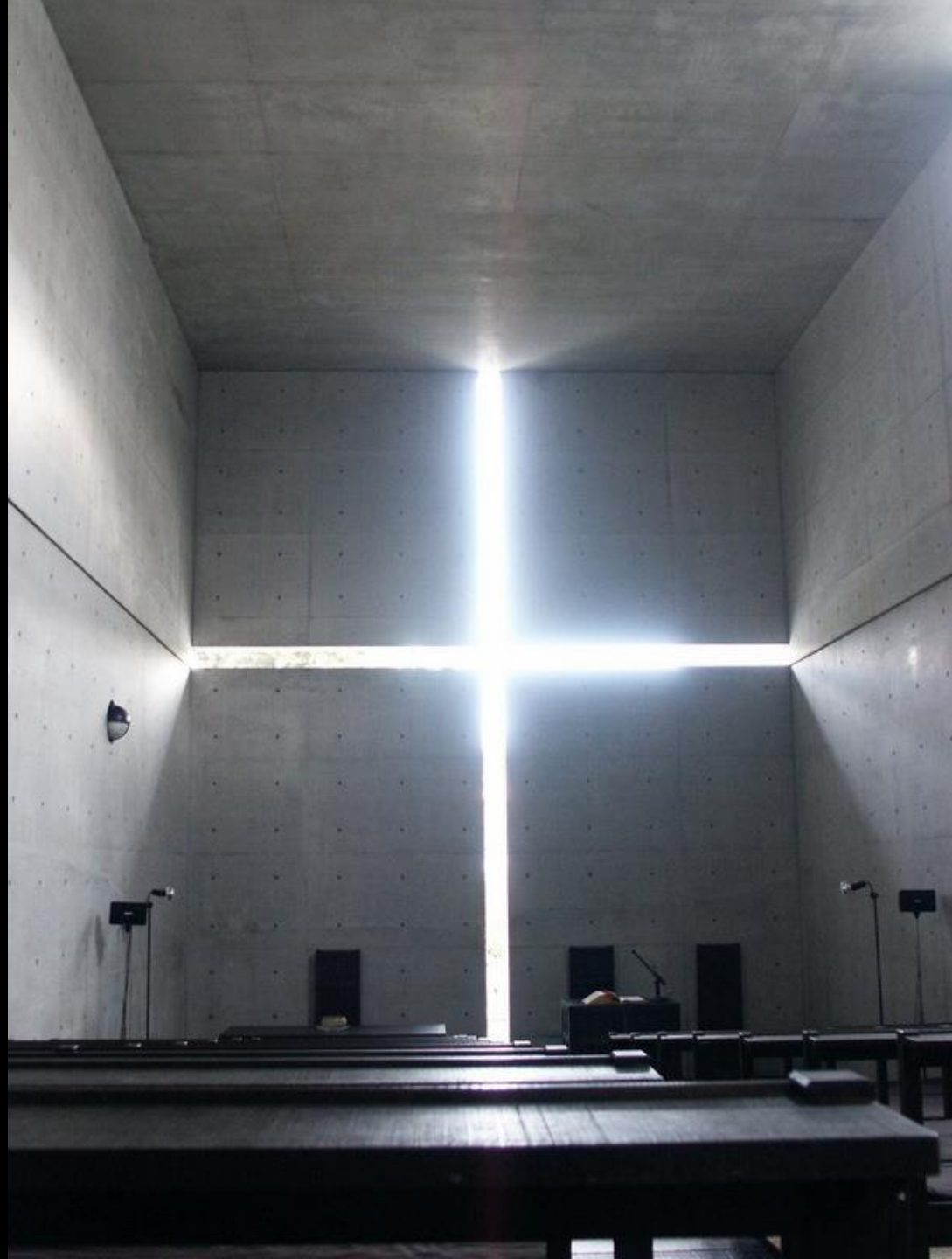
Interior of the Church of the Light