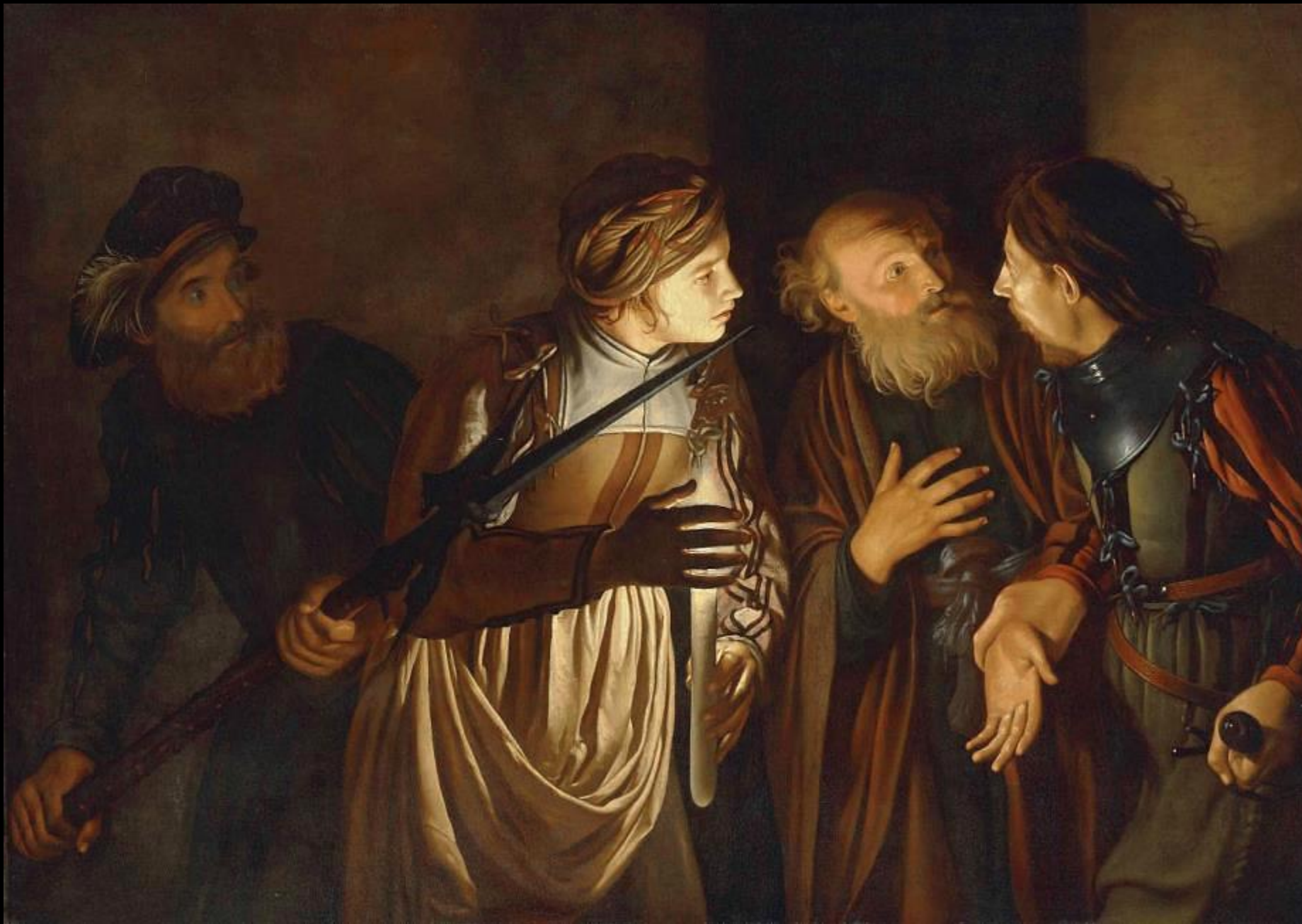
Peter's Denial -- Adam de Coster