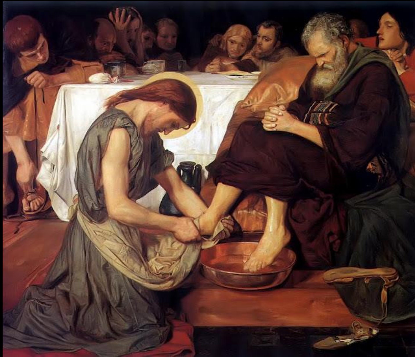
Christ Washes the Disciples' Feet -- Ford Madox Brown, Tate Britain, London, England