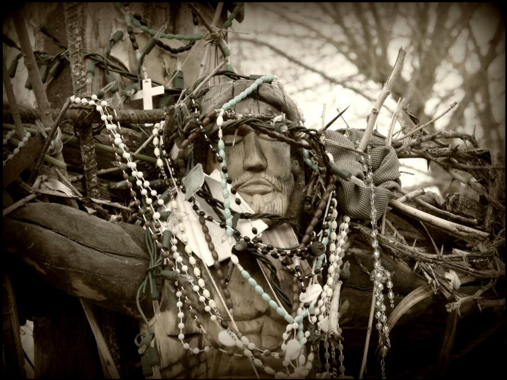
Crucifix -- before 1810, Santuario de Chimayo, Chimayo, NM