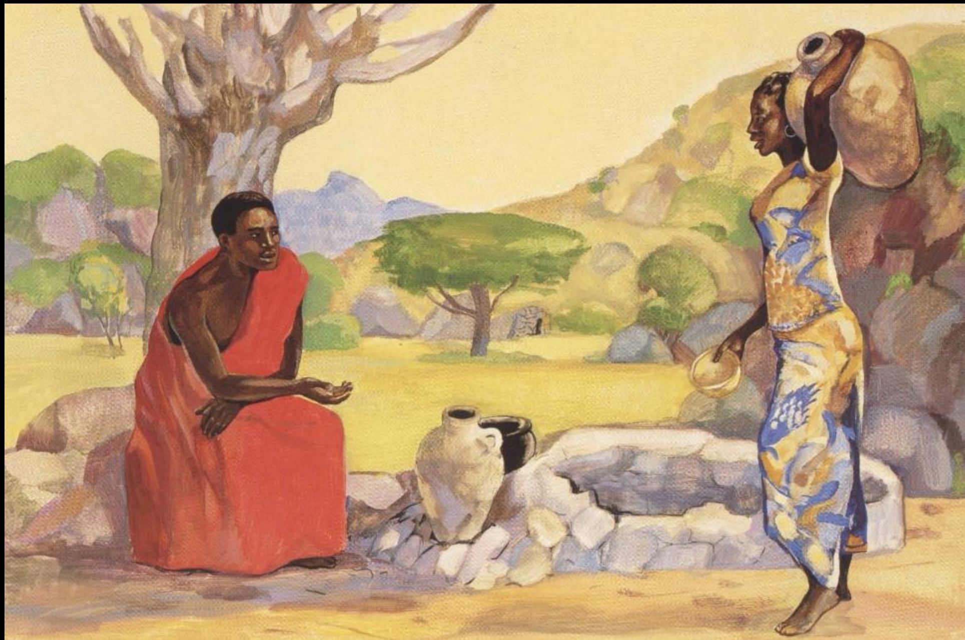
Christ and the Samaritan Woman -- JESUS MAFA, Cameroon