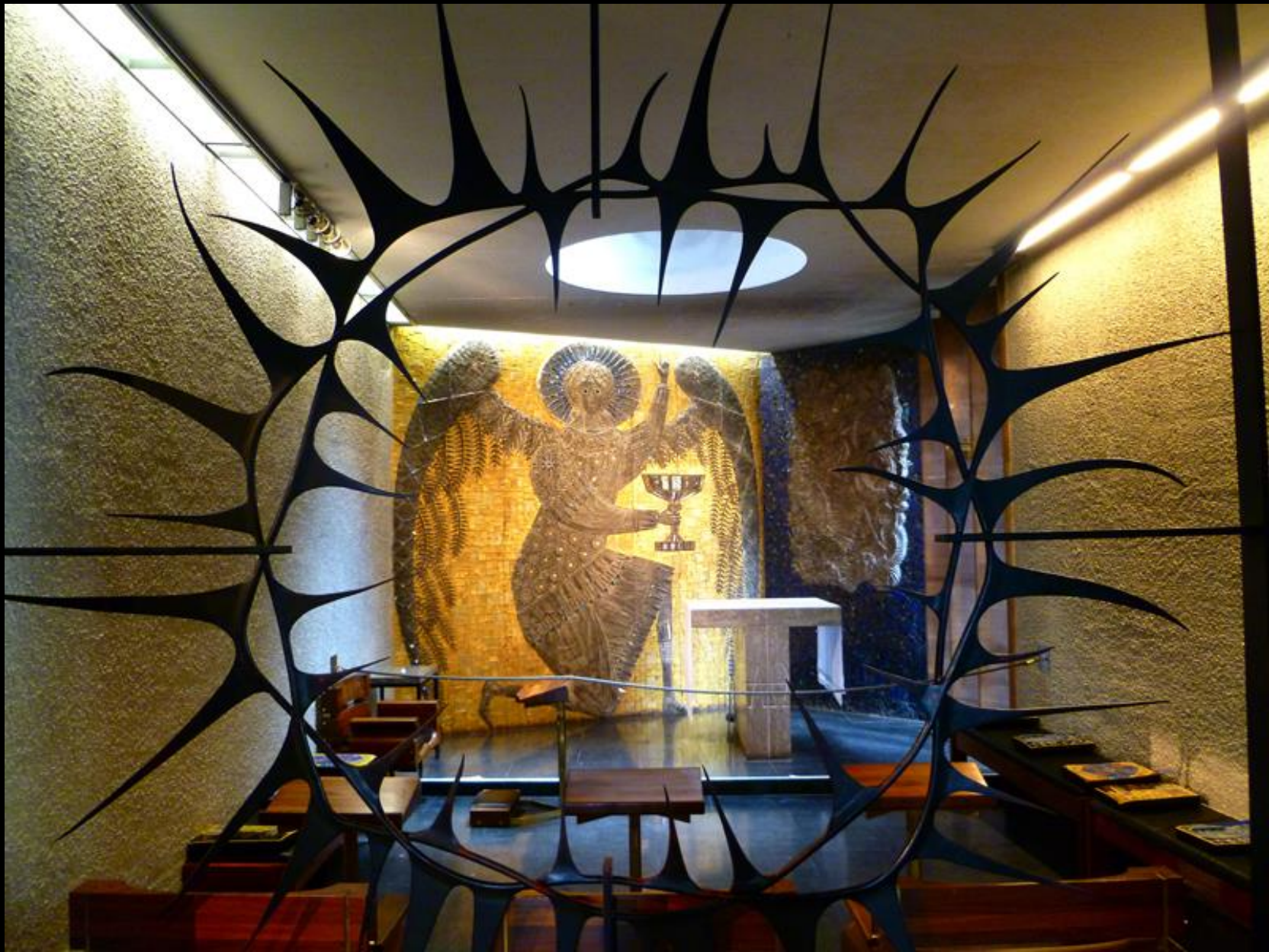
Gethsemane Chapel -- Coventry Cathedral, Coventry, England