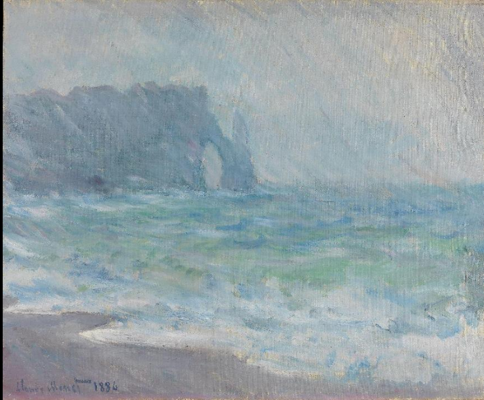
Rain, Étretat -- Claude Monet, National Gallery, Oslo Norway