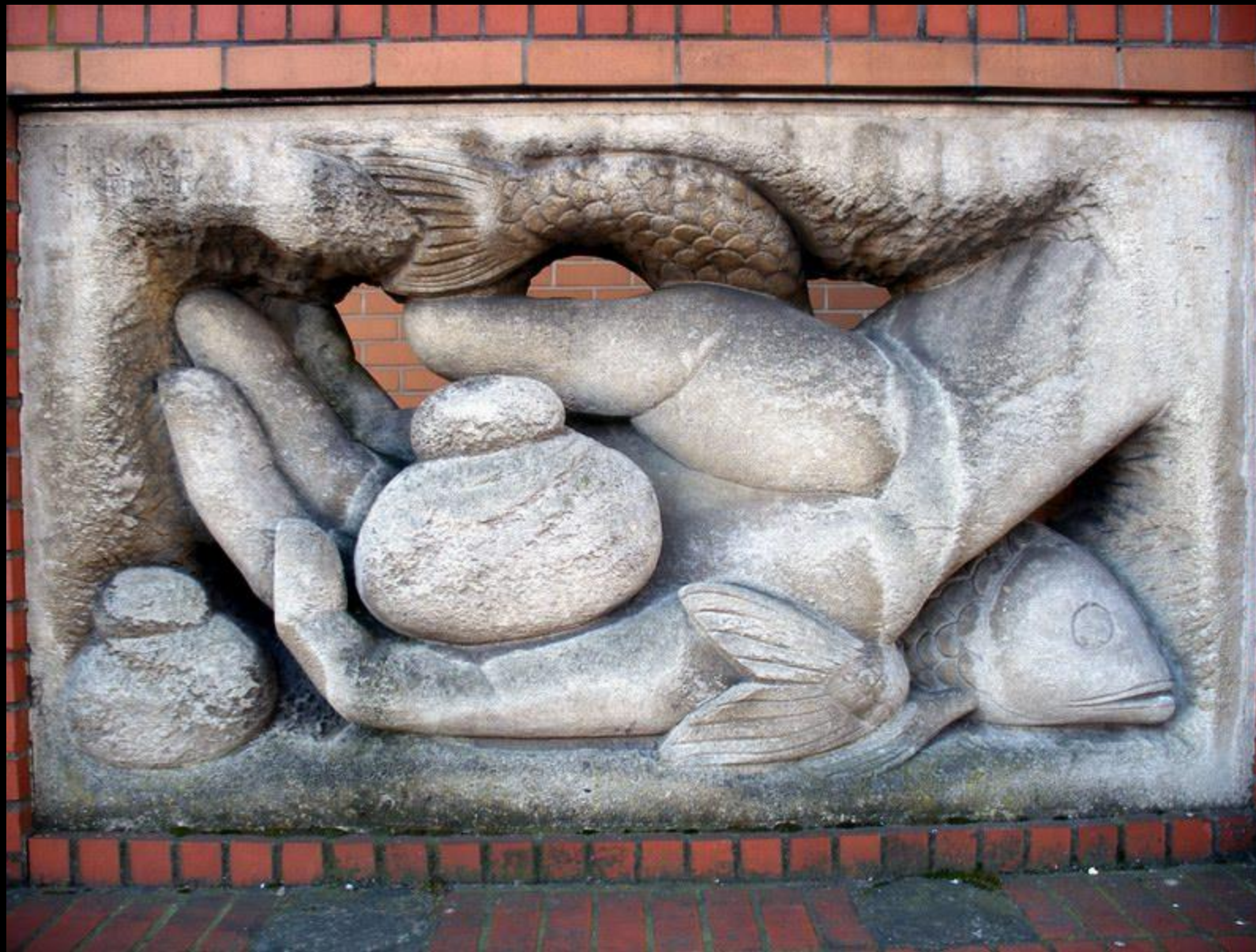
Hand of God with Loaves and Fish -- United Reformed Church, Brighton, England