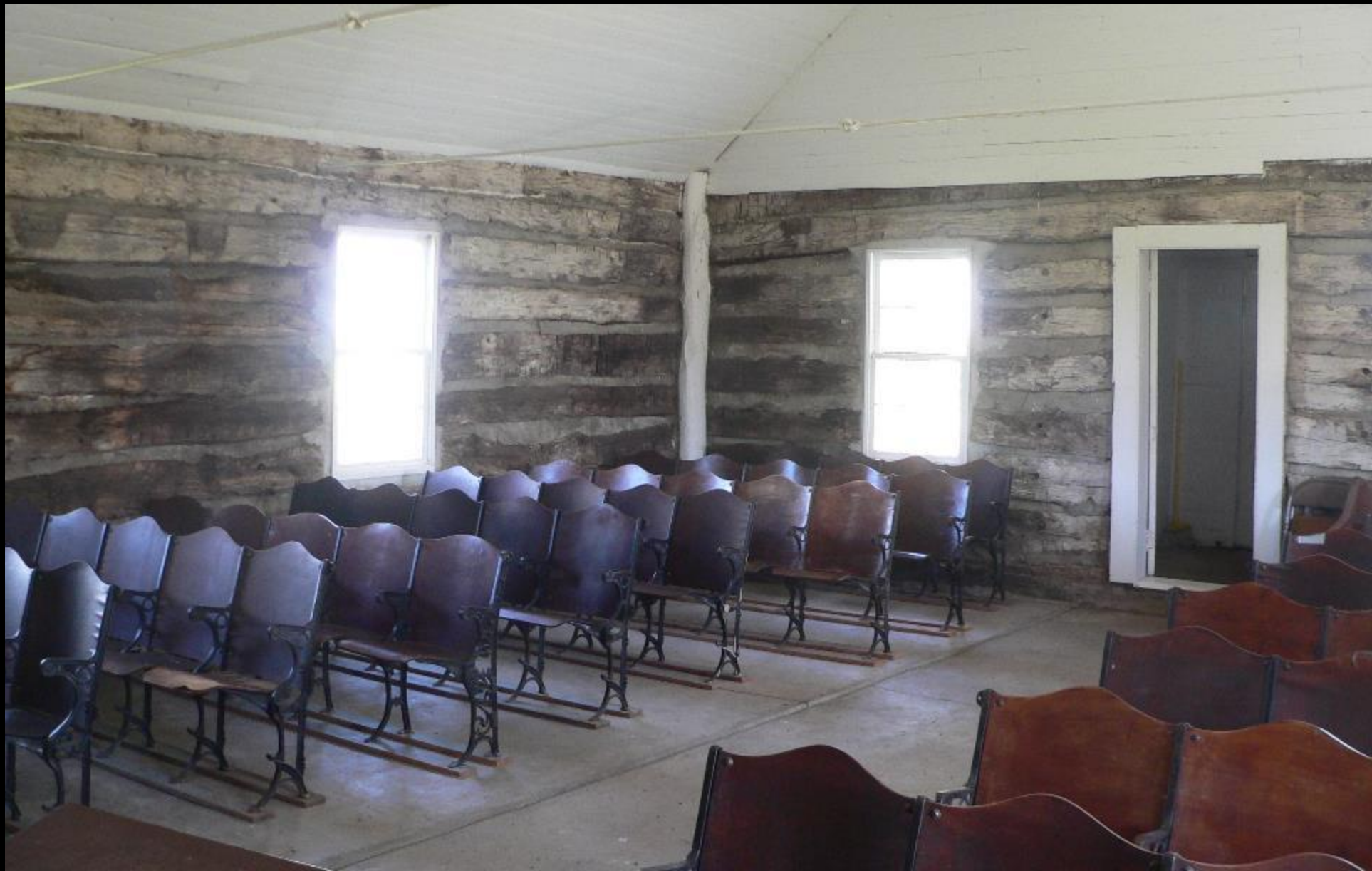
Brown Earth Presbyterian Church -- Grant County, South Dakota