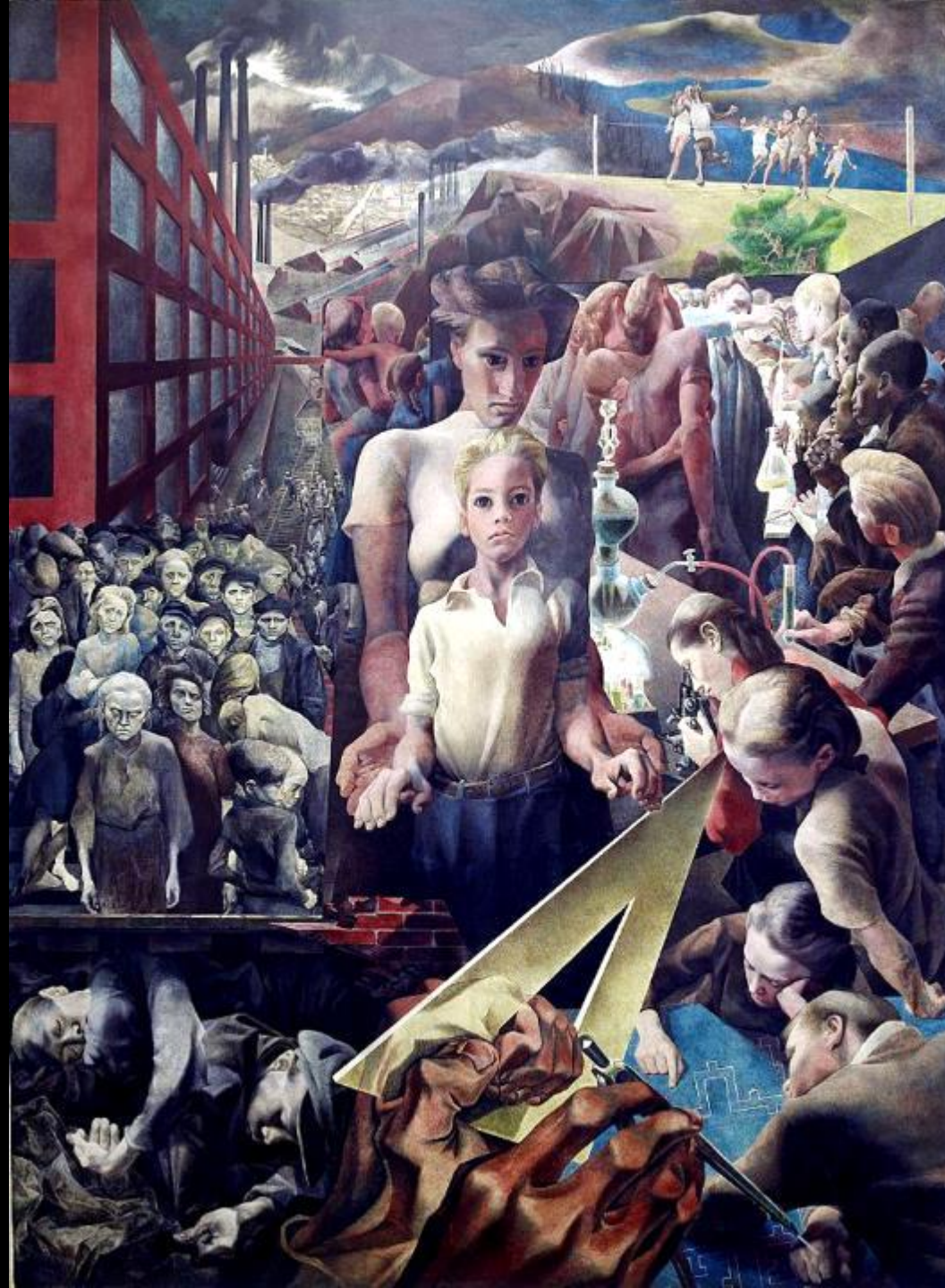
Justice and Child Symeon Shimin Department of Justice Washington, DC