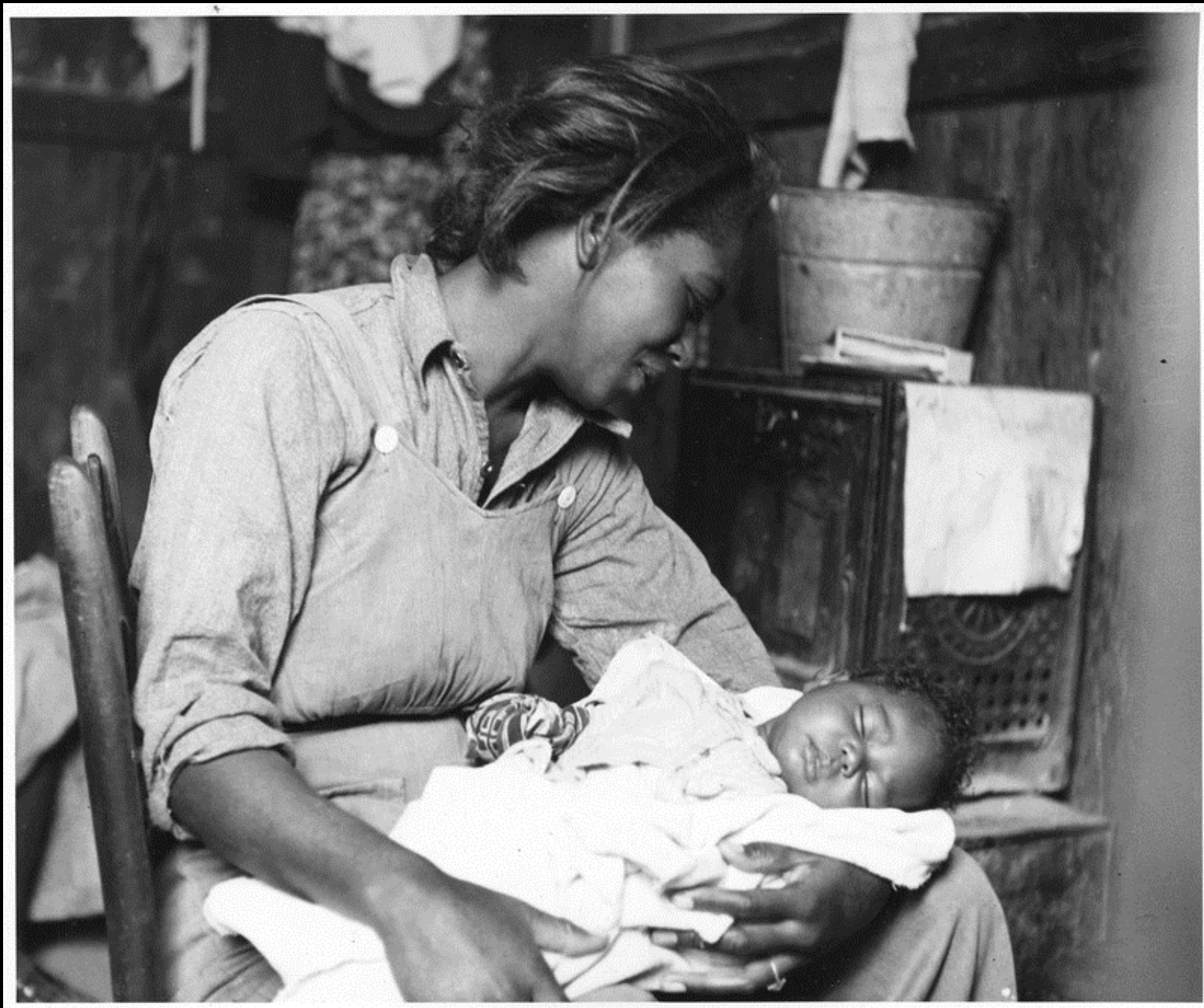
Migrant Cotton-picker and Her Baby -- Dorothea Lange, National Archives, Washington, DC