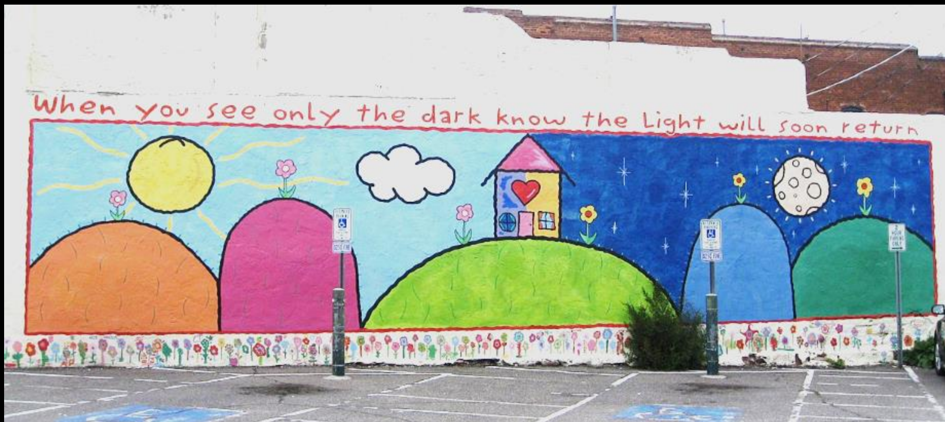
"When you see only the dark, know the Light will soon return." -- Building mural, Flagstaff, AZ