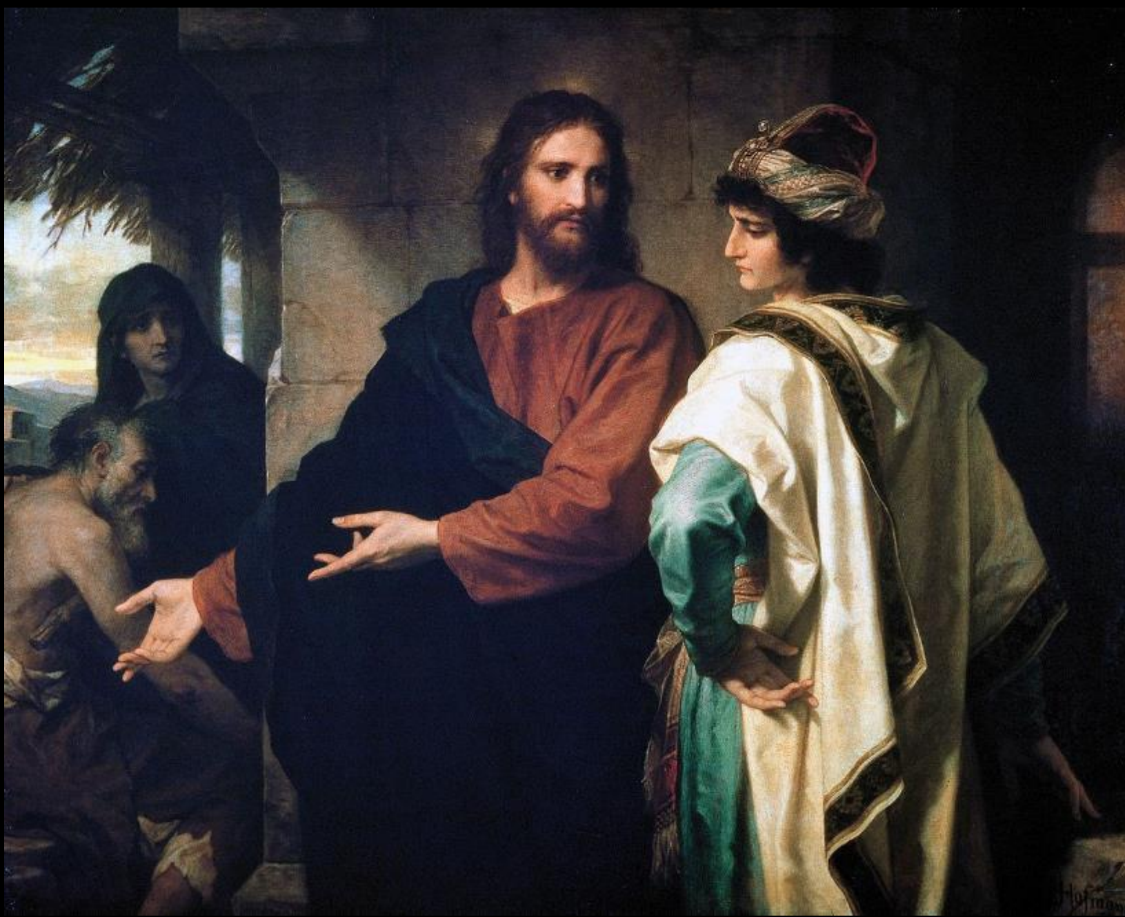
Christ and the Rich Young Ruler -- Heinrich Hofman, Riverside Church, New York, NY