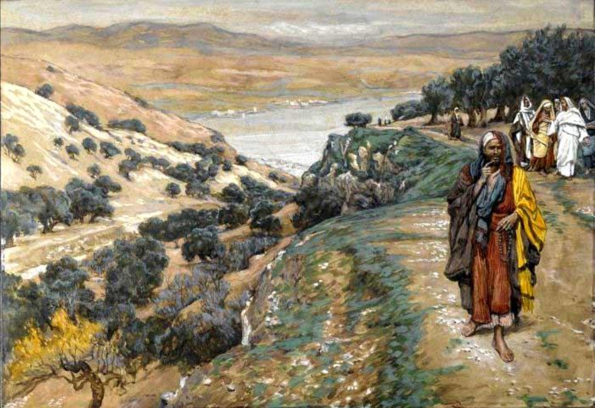
The Rich Young Man Went Away Sorrowful -- James Tissot, Brooklyn Museum, New York, NY