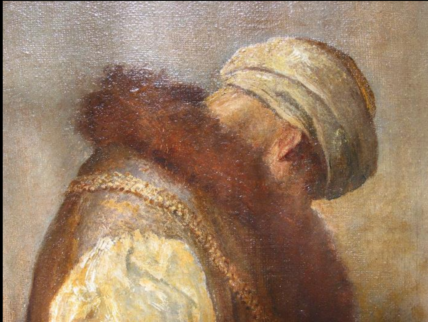
"For He Had Great Possessions" -- George Watts, Tate Britain, London, England