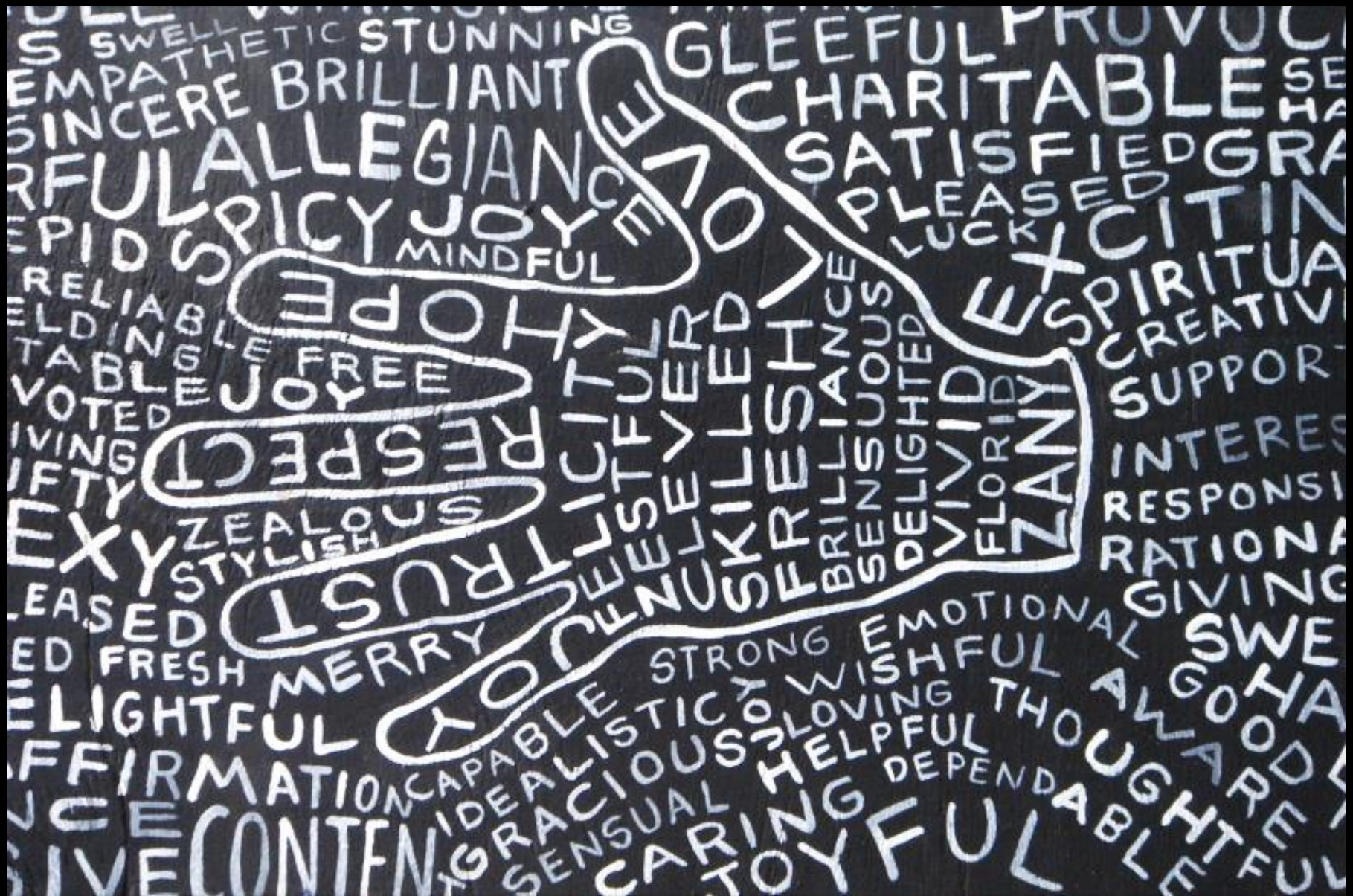
Living Word -- Painting on wood, Manhattan, NY