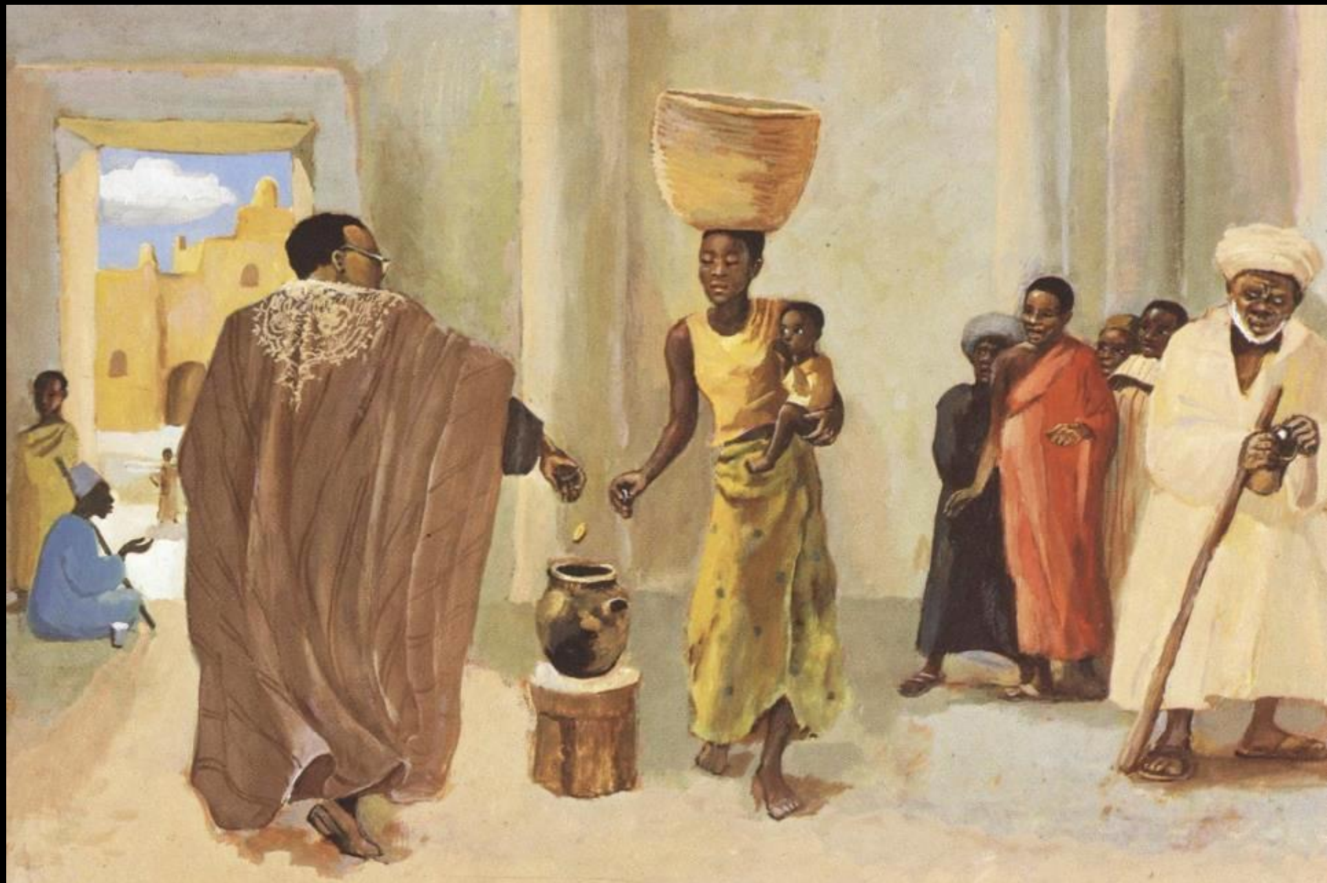
The Widow's Mite -- JESUS MAFA, Cameroon