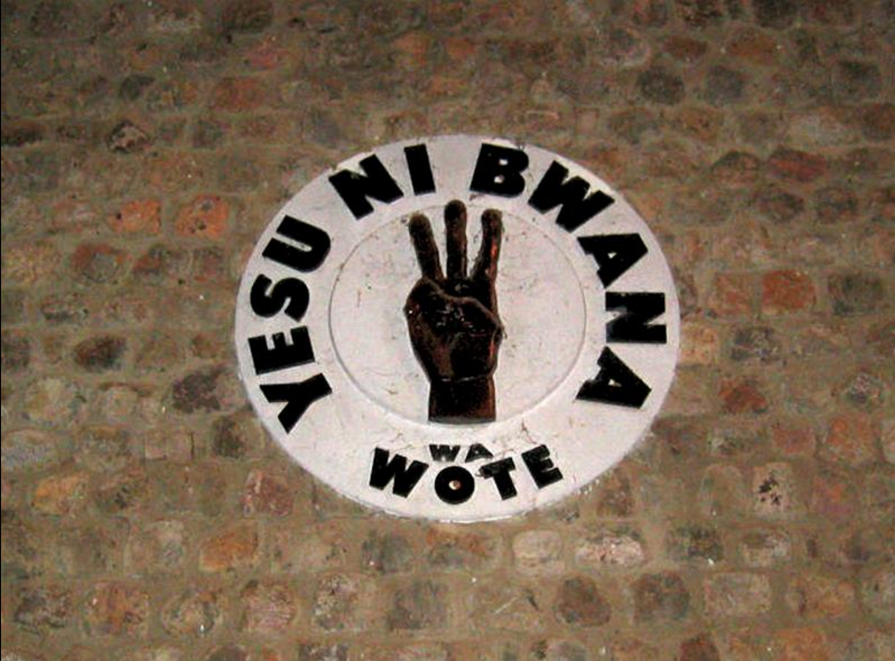
Jesus is Lord -- Mulungwishi Methodist Church, DR Congo