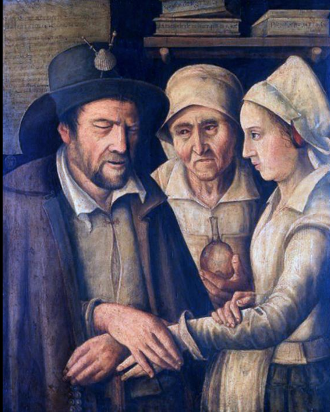
Healing by Laying On of Hands