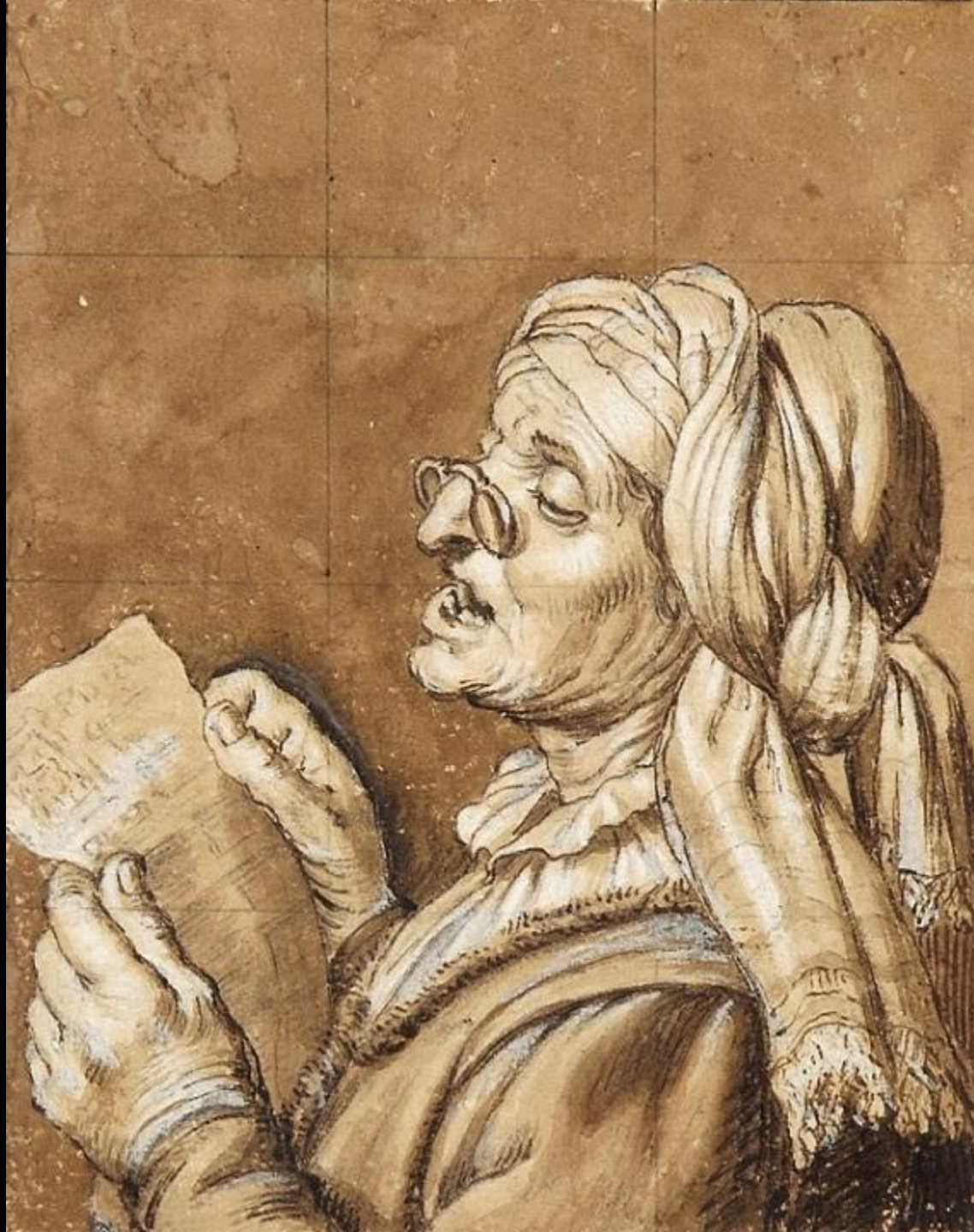
Woman Singing Gerard van Honthorst National Museum Warsaw, Poland