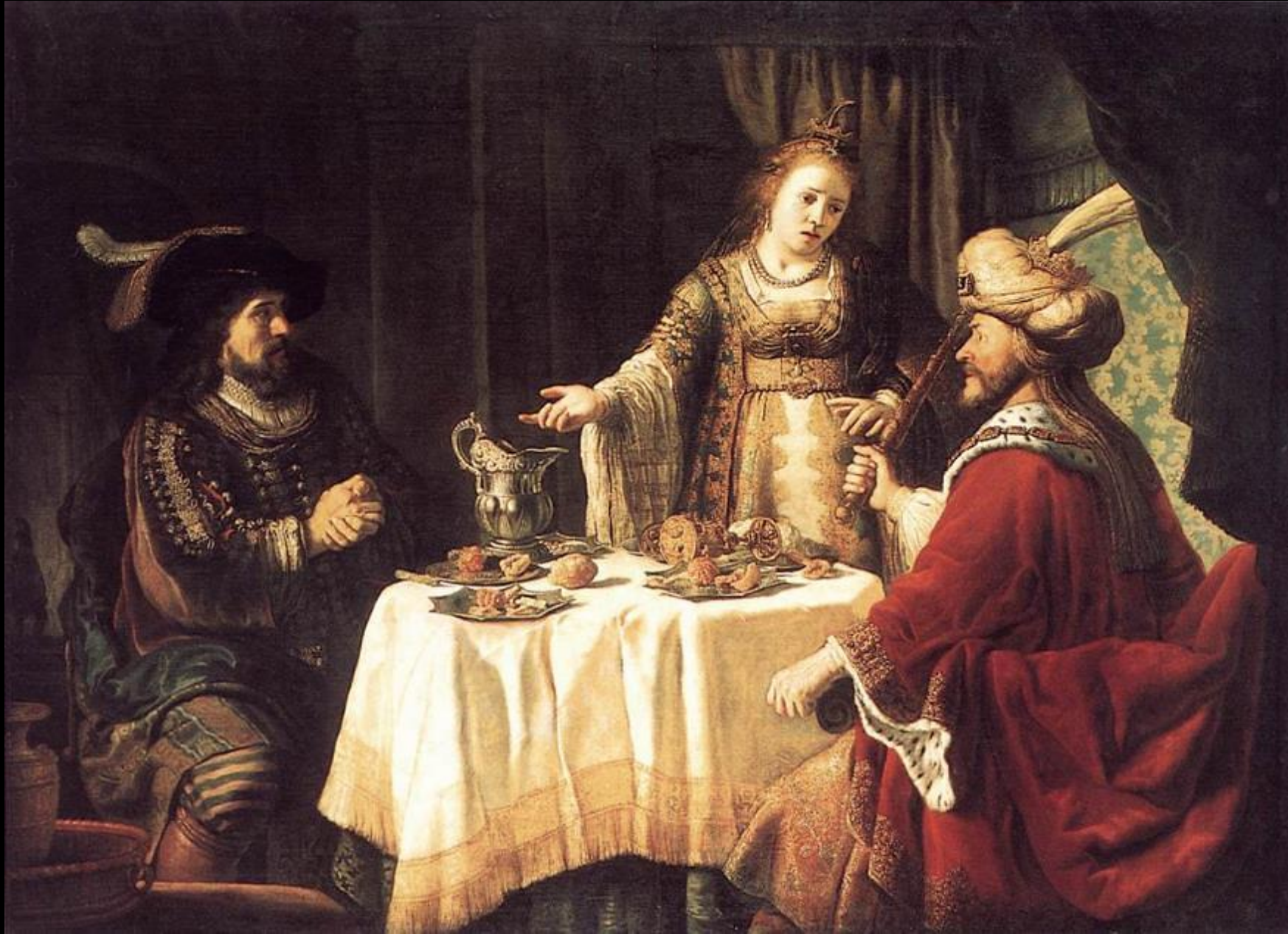
The Banquet of Esther and Ahasuerus -- Jan Victors, Kassel, Germany