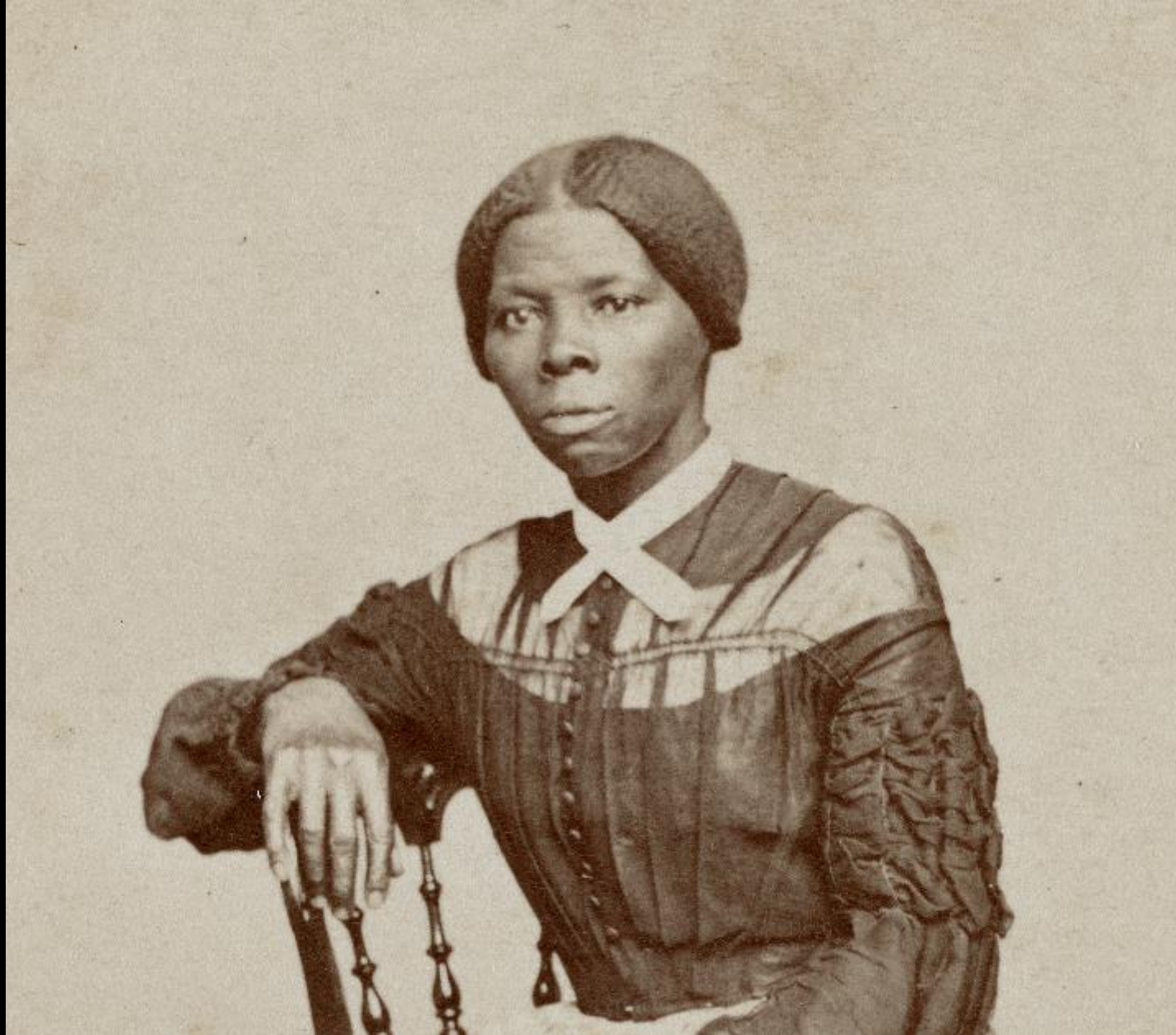
Harriet Tubman, known as the "Black Moses" Smithsonian National Museum of African American History & Culture