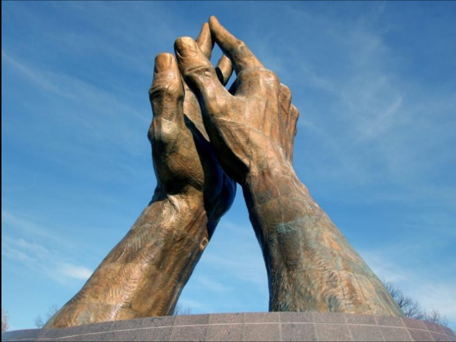
Healing Hands -- Oral Roberts University, Tulsa, Oklahoma