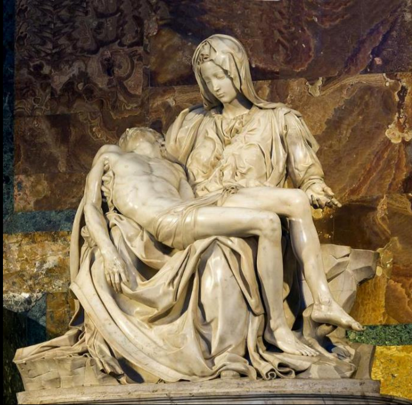
Pieta -- Michelangelo, St. Peter's Basilica, Vatican City