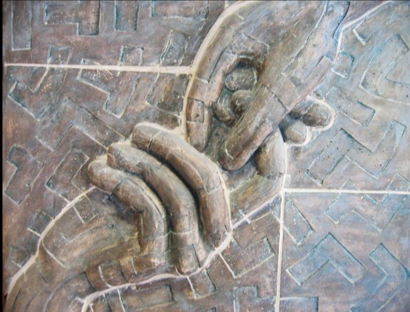
Hand of God -- Church wall sculpture, [Taiwan]