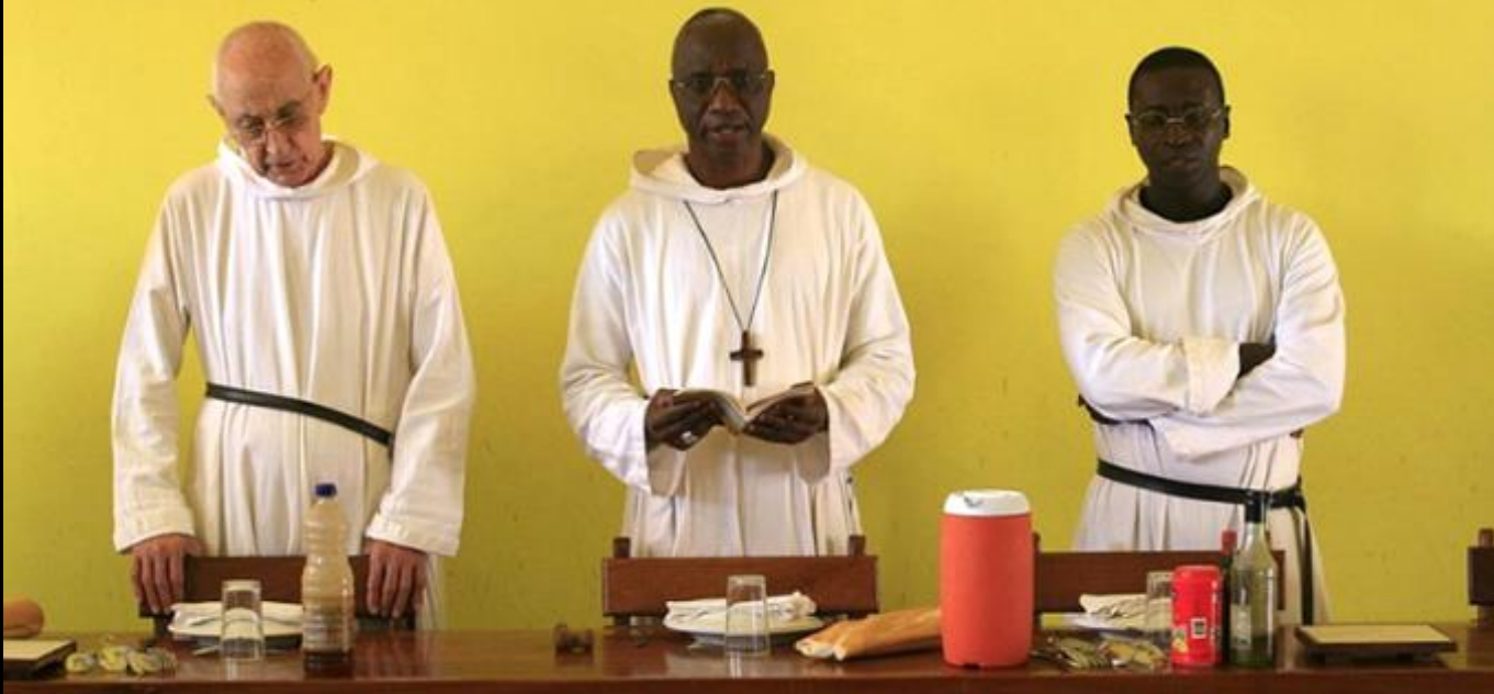
Blessing of the Meal