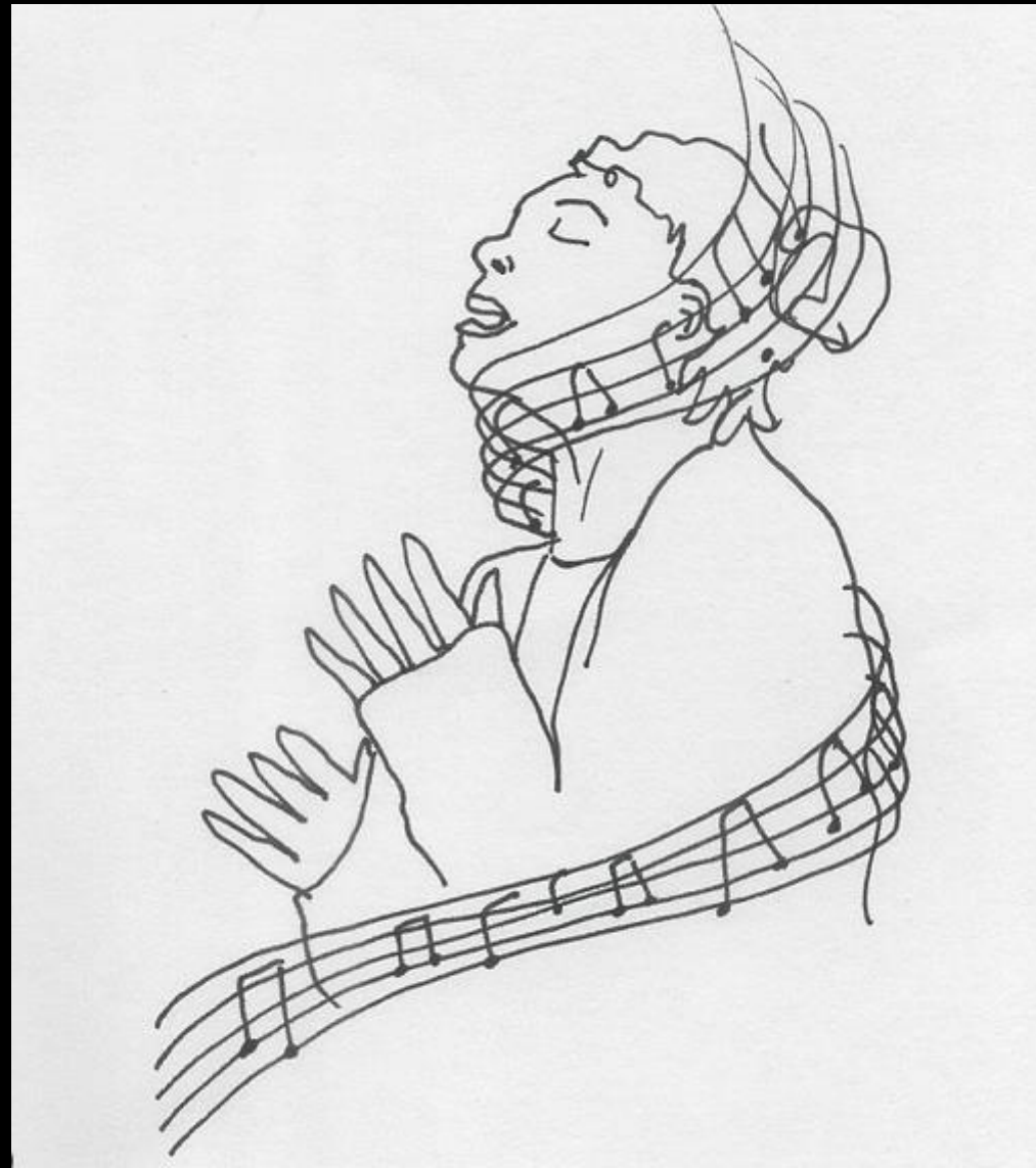
Praise -- Liz Valente