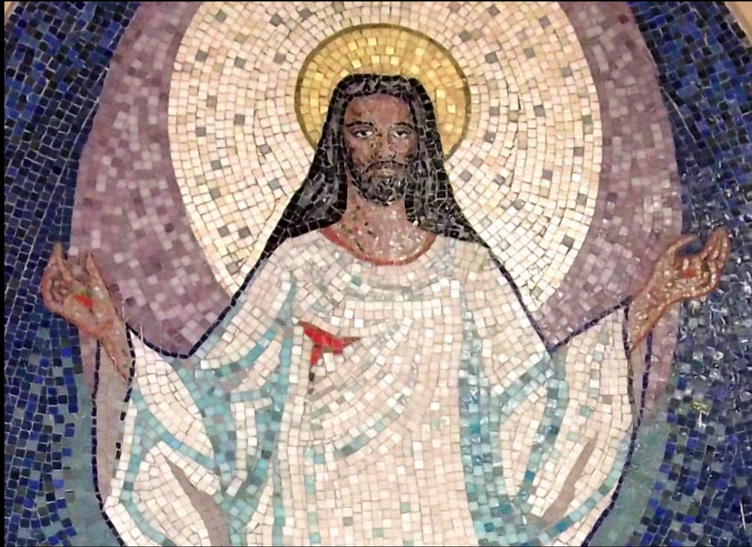
The Resurrected Christ -- Church of San Sebastian, Porto Alegre, Brazil