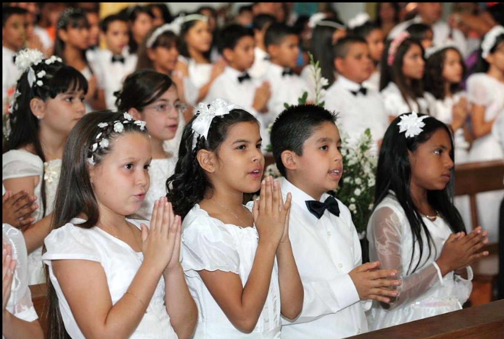
Celebrating First Communion