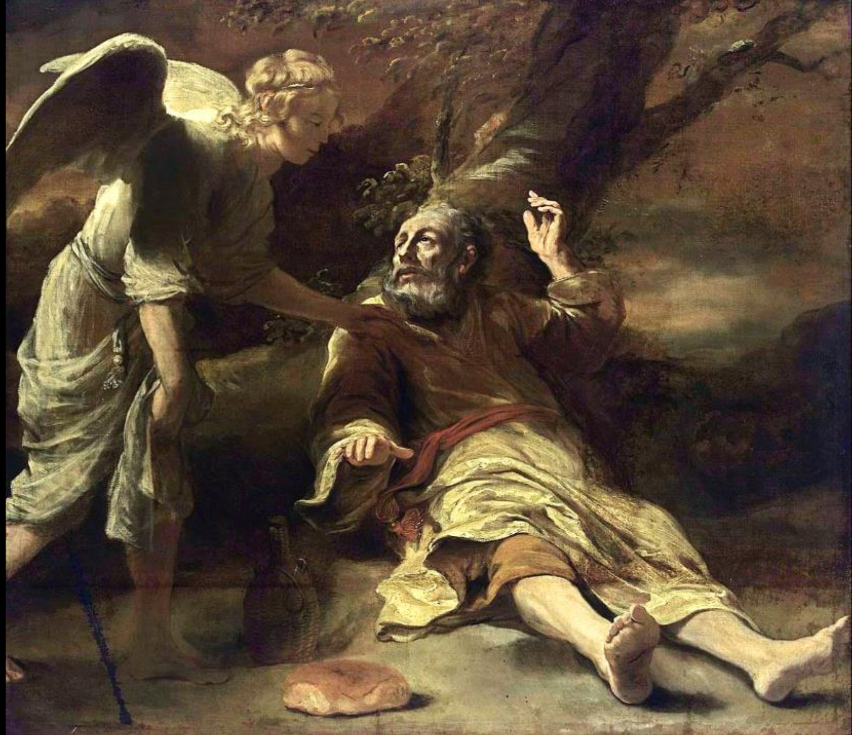
Elijah and the Angel