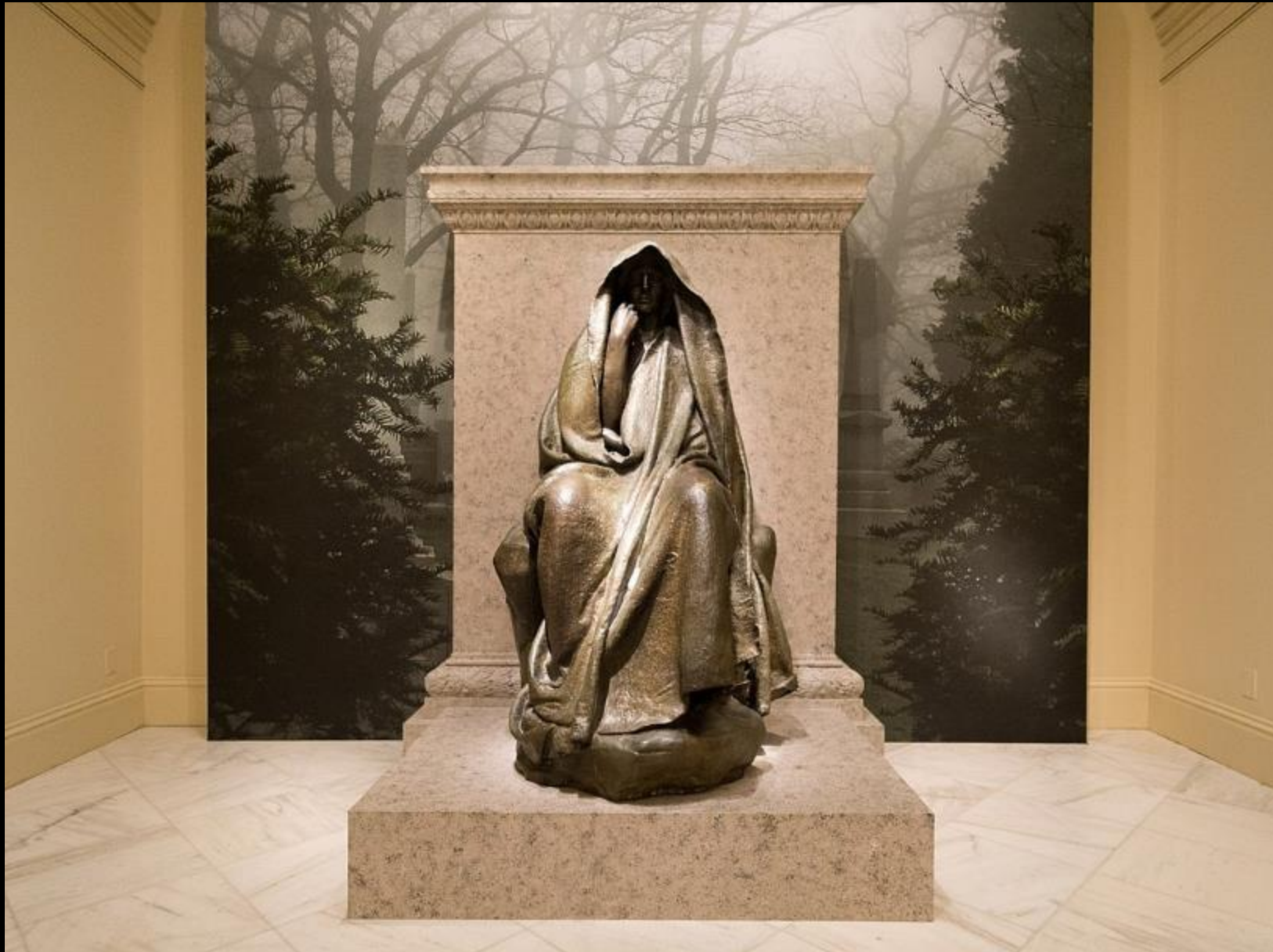
Adams Memorial -- Augustus Saint-Gaudens, Smithsonian Museum of American Art, Washington, DC