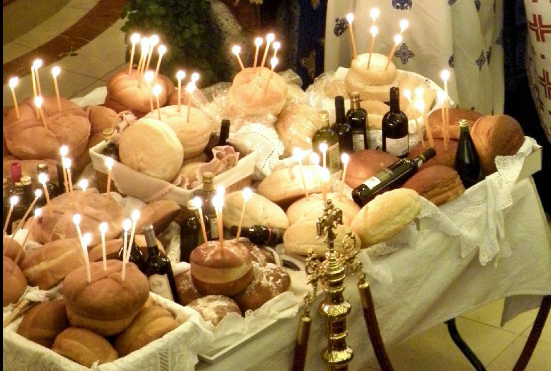
Artoklasia, Breaking of Bread -- Annunciation of the Virgin Greek Orthodox Cathedral, Toronto, Canada