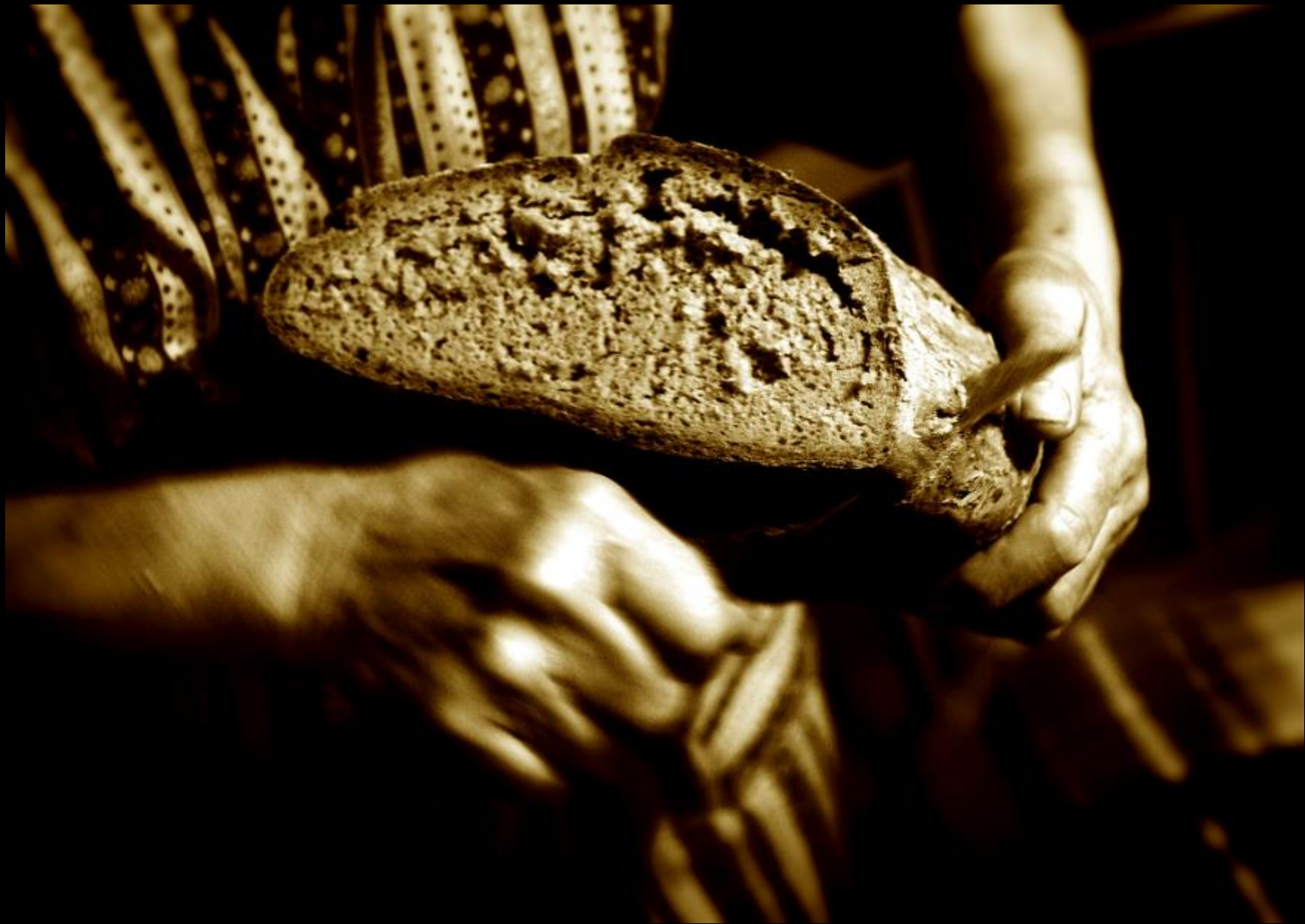
Bread of Life