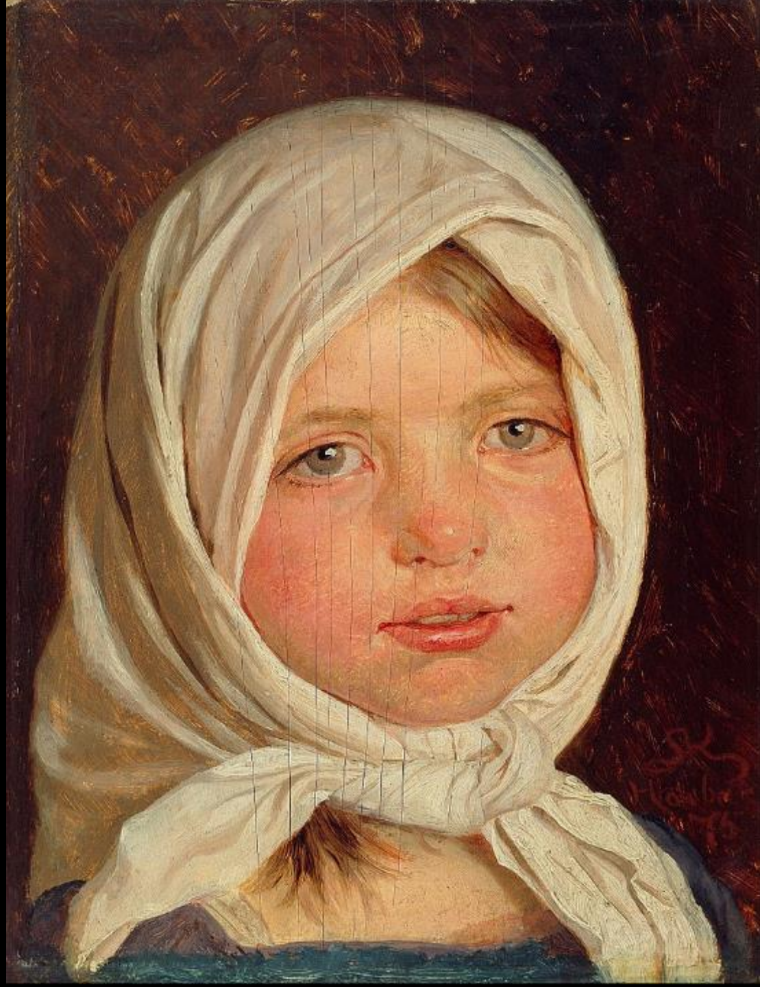
Little Girl from Hornbaeck

Peder Severin Krøyer Hirschsprung Collection Copenhagen, Denmark