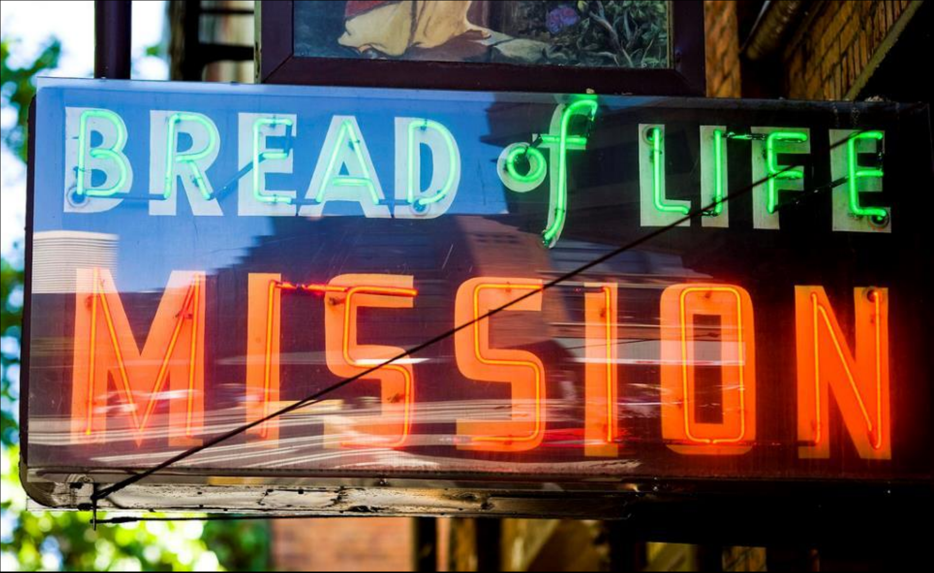
Bread of Life Mission, Seattle, WA