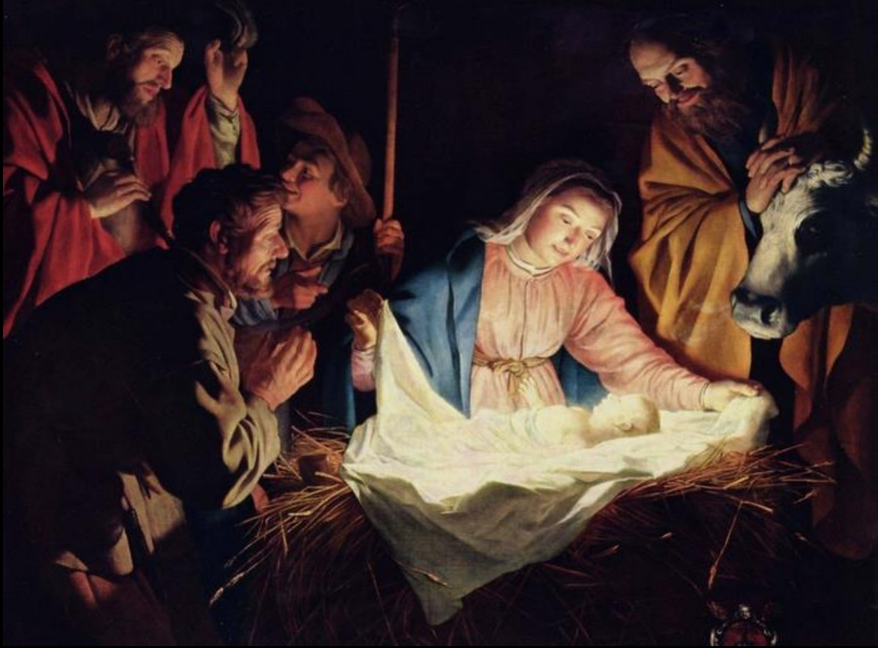
Adoration of the Shepherds -- Gerrit van Honthorst, Wallraf-Richartz Museum, Cologne, GDR