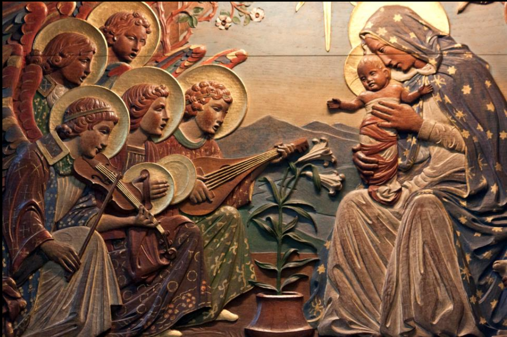
Angels Worship the Christ Child -- St. Giles Cathedral, Edinburgh, Scotland