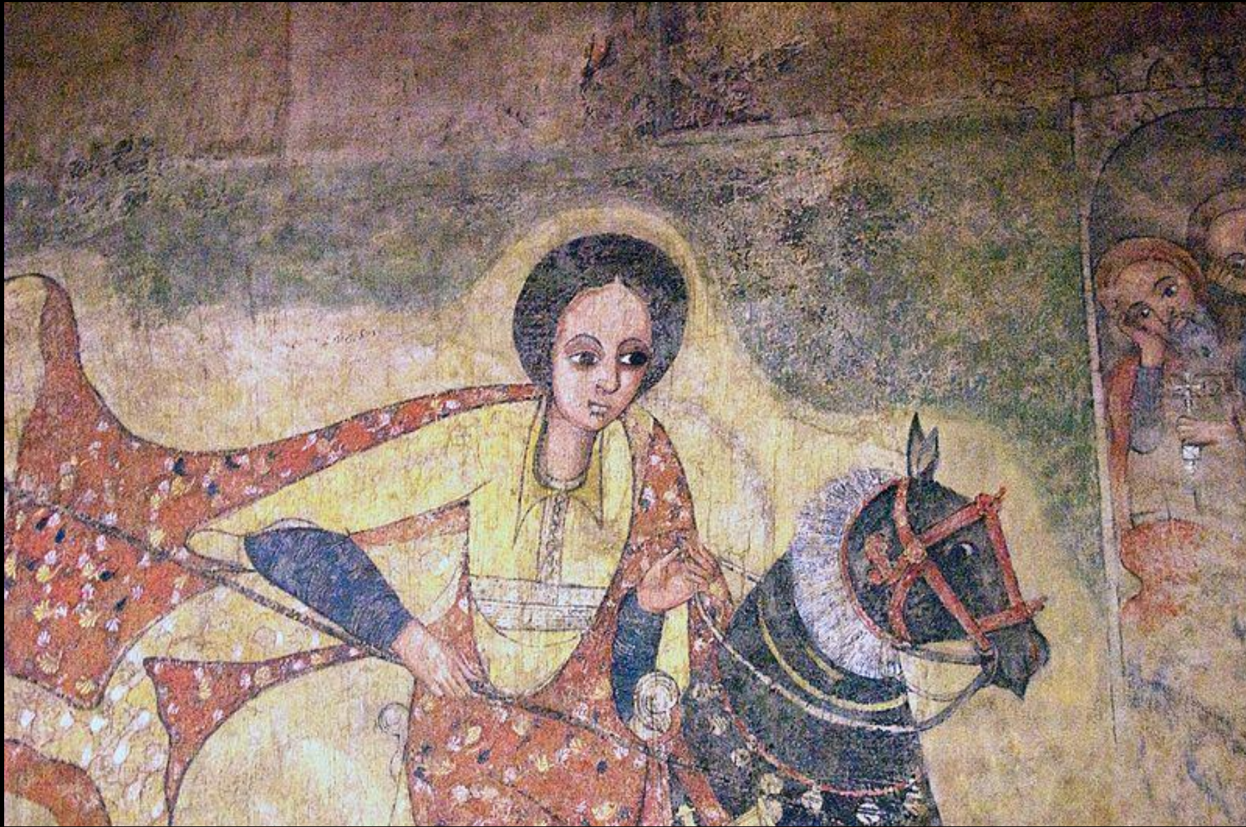
Queen of Sheba -- Lalibela Muralist, Addis Ababa National Museum, Addis Ababa, Ethiopia