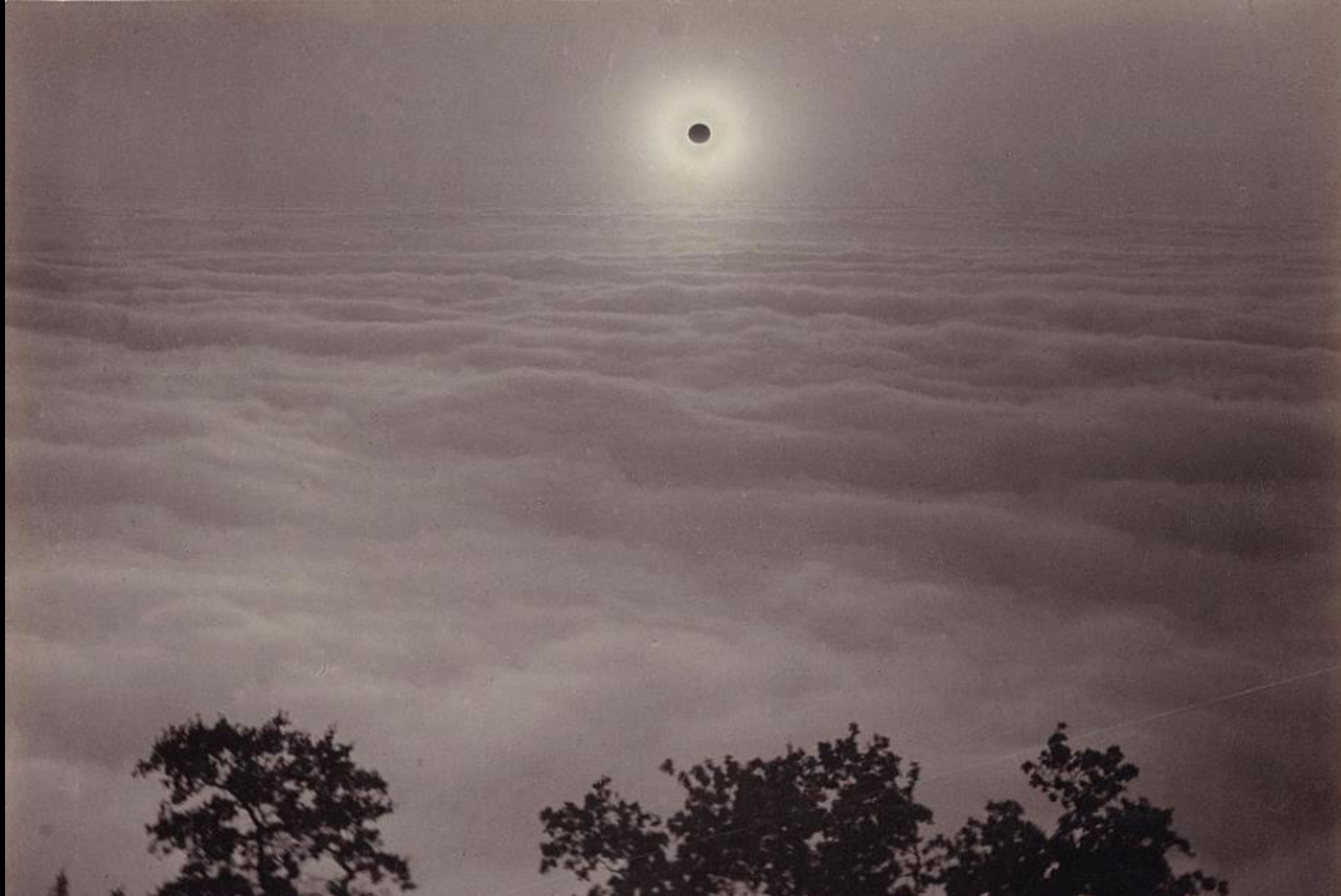
Solar Eclipse from Mount Santa Lucia -- Carleton Watkins, Getty Center, Los Angeles, CA