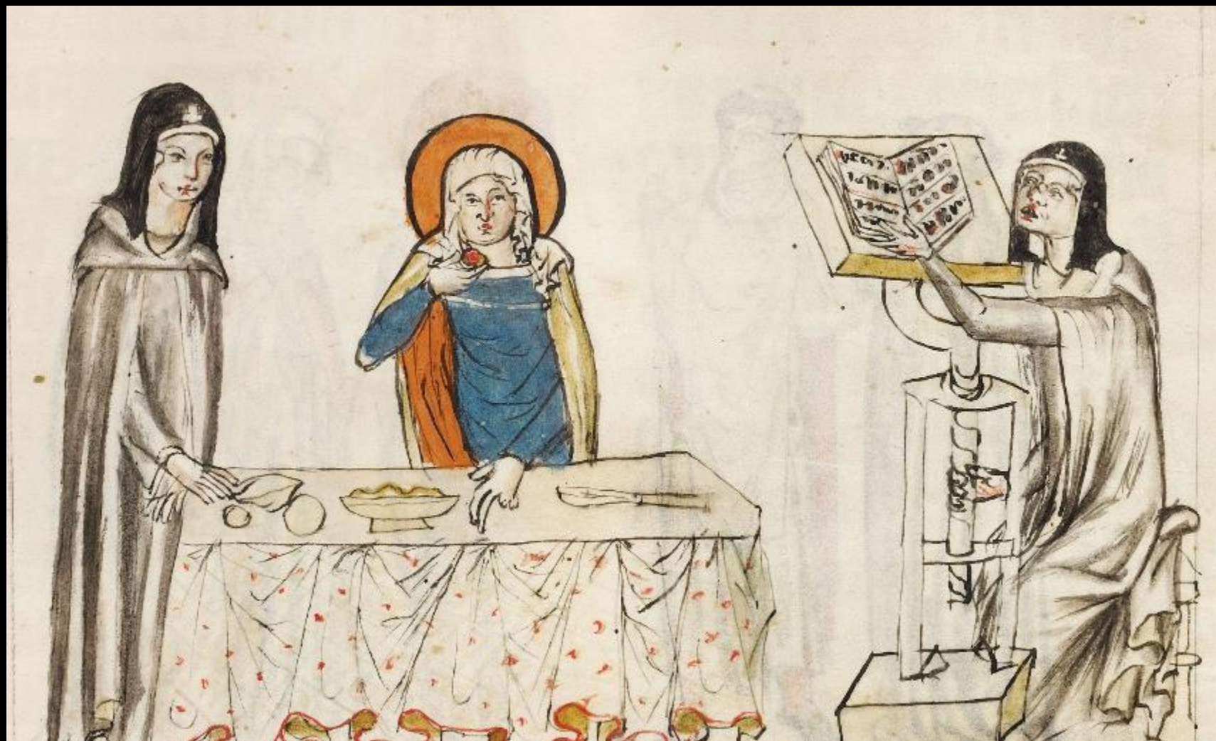
St. Hedwig of Silesia Listening to a Reading -- Getty Center, Los Angeles, CA