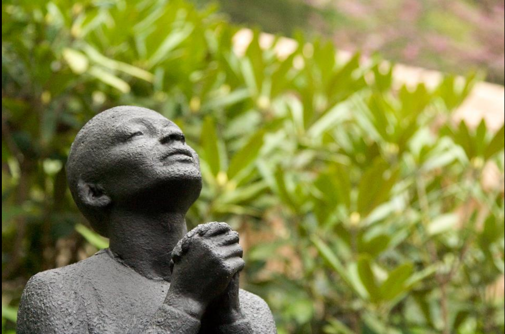
Rose McClendon in Prayer -- Richmond Barthe, Fallingwater, PA