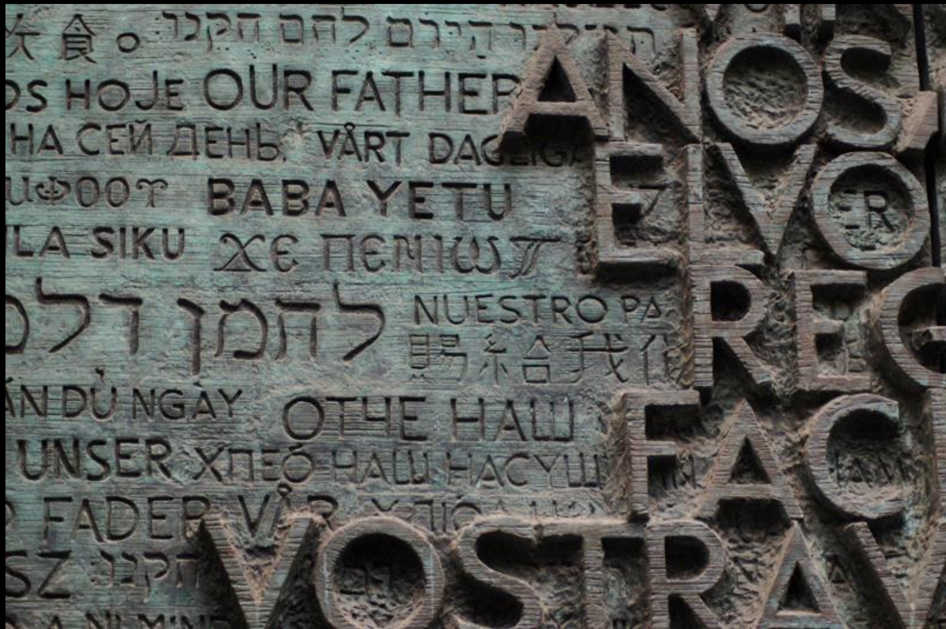
Eucharist Door with the Lord's Prayer -- Sagrada Familia, Barcelona, Spain