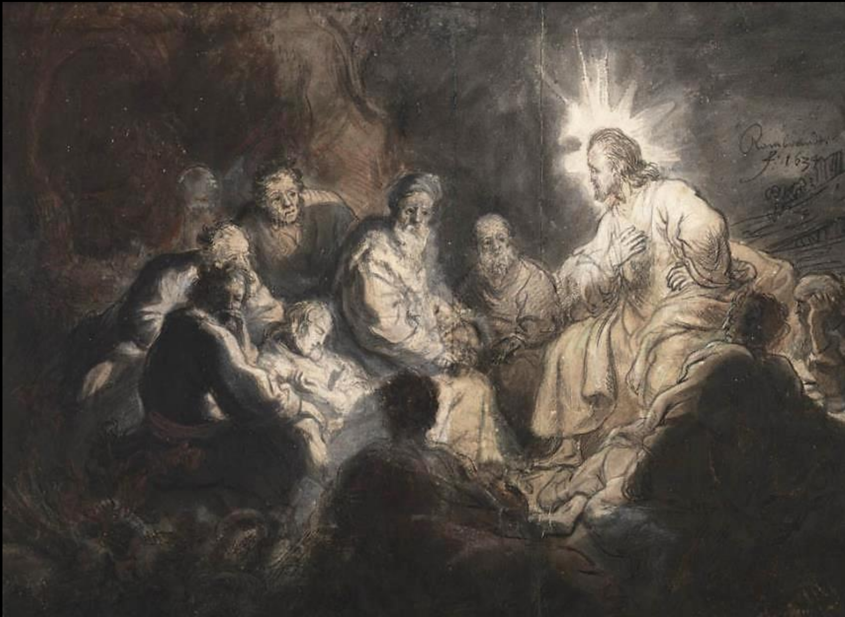
Jesus and His Disciples in Gethsemane -- Rembrandt, Teylers Museum, Haarlem, Netherlands