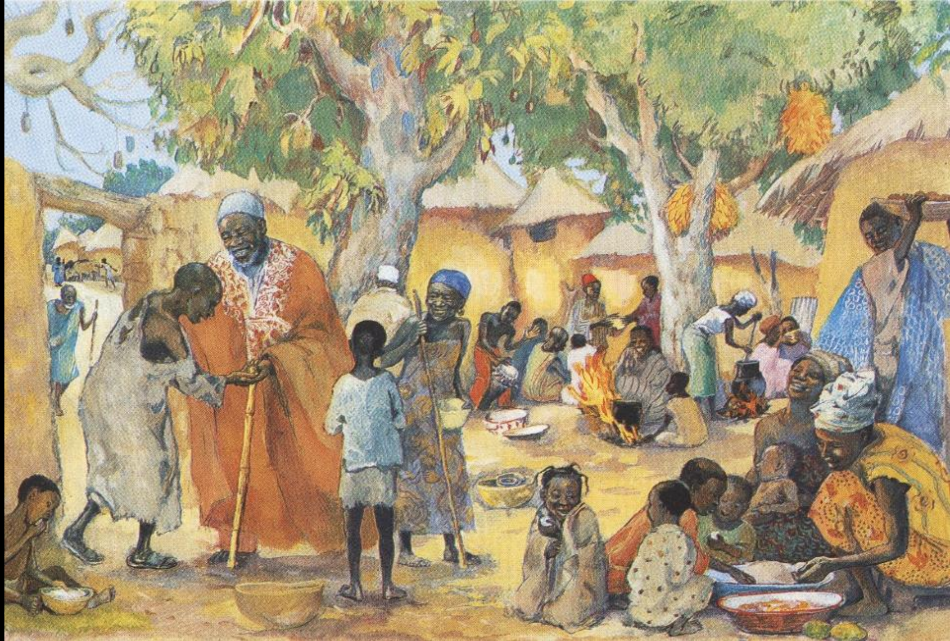
The Poor Invited to the Feast -- JESUS MAFA