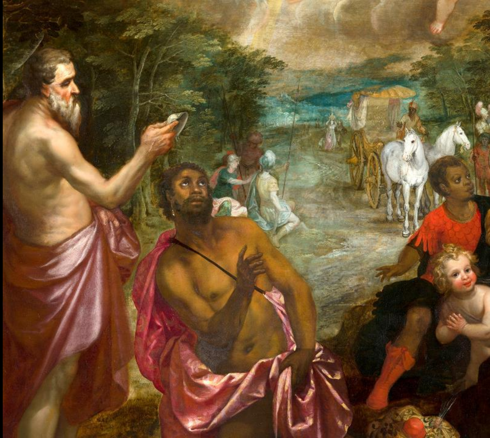
Philip Baptizes the Ethiopian