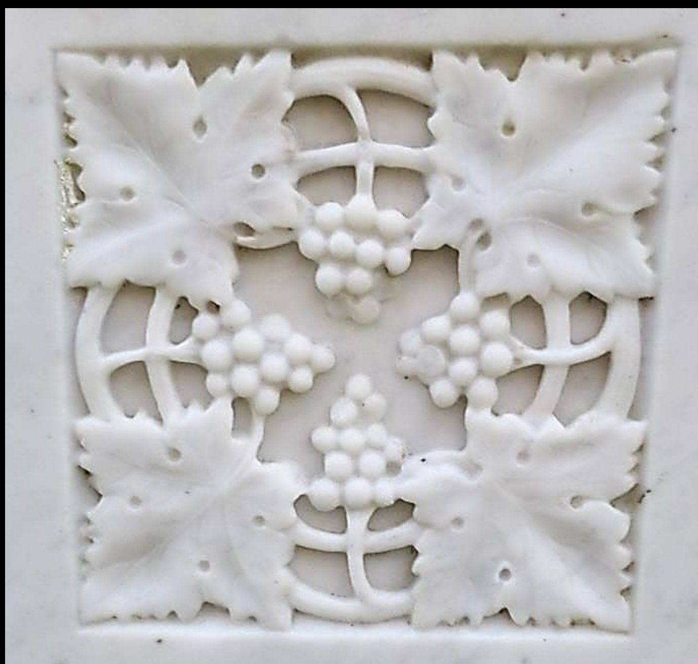
"I am the True Vine" Gravestone -- St Quivox, Scotland