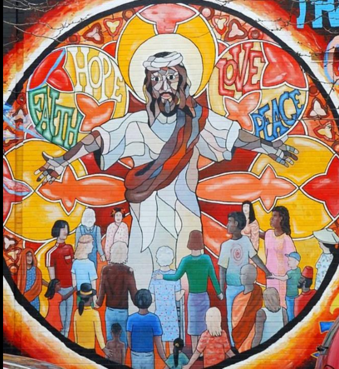
Jesus Mural of Faith, Hope, Love, and Peace