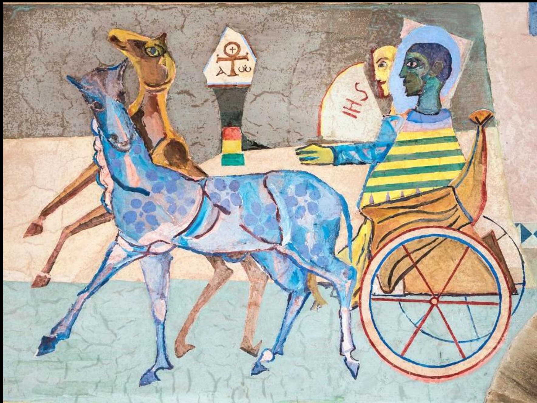
The Ethiopian and Philip, Angel's Chapel, Seckau Abbey, Styria, Austria