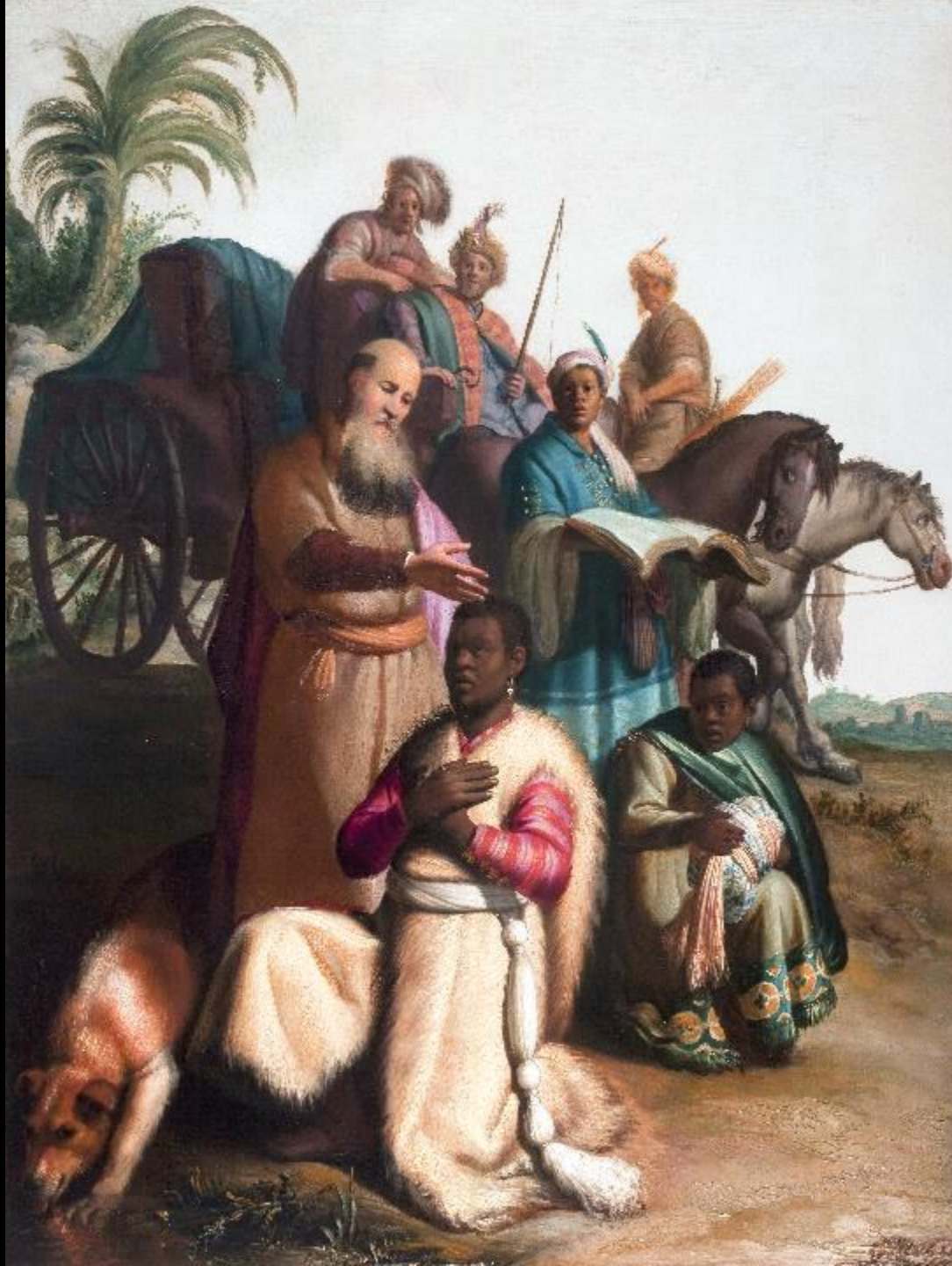
Baptism of the Ethiopian Rembrandt Catharijneconvent Utrecht, Netherlands