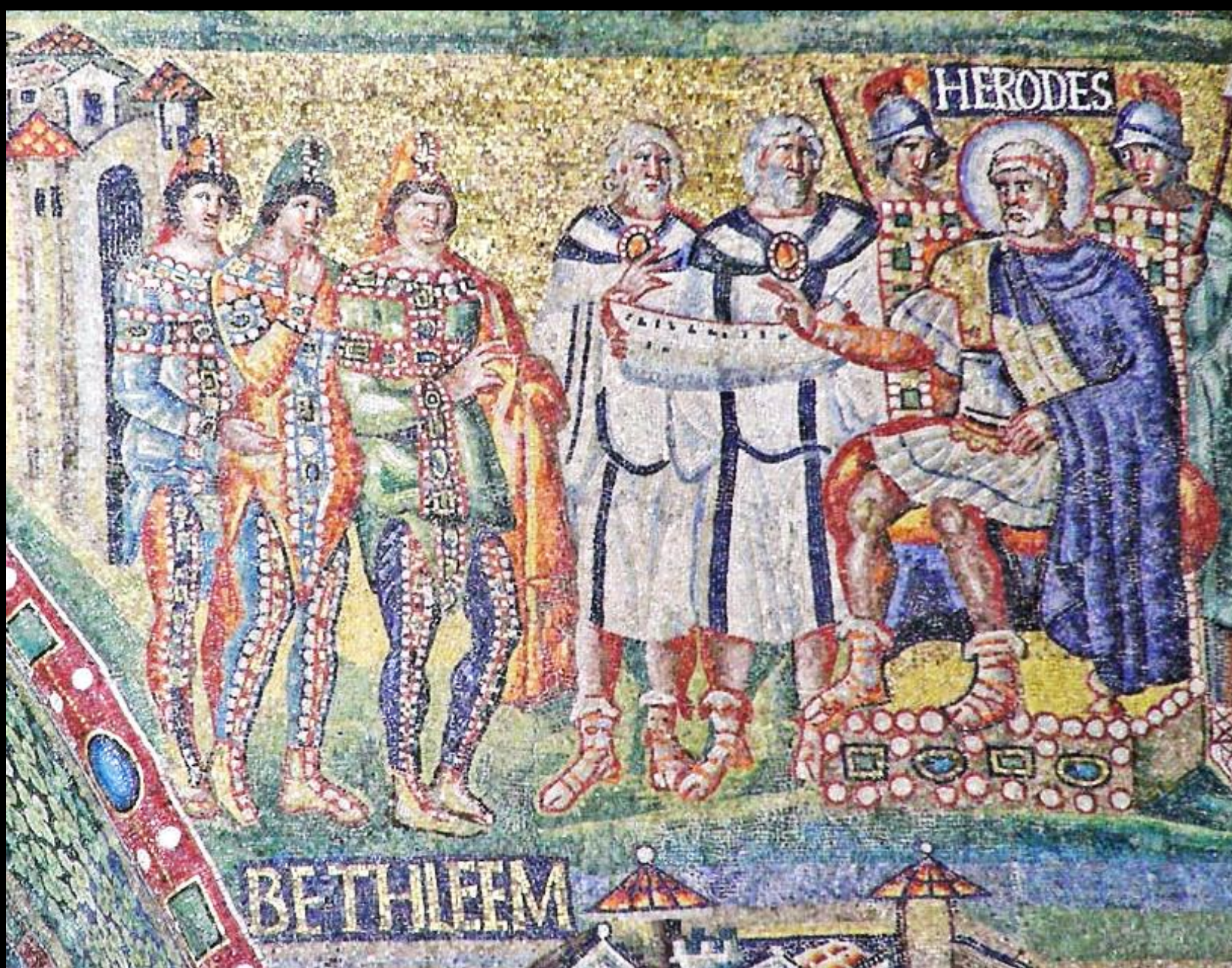
Herod Speaks with the Magi -- Mosaic, Santa Maria Maggiore, Rome, Italy