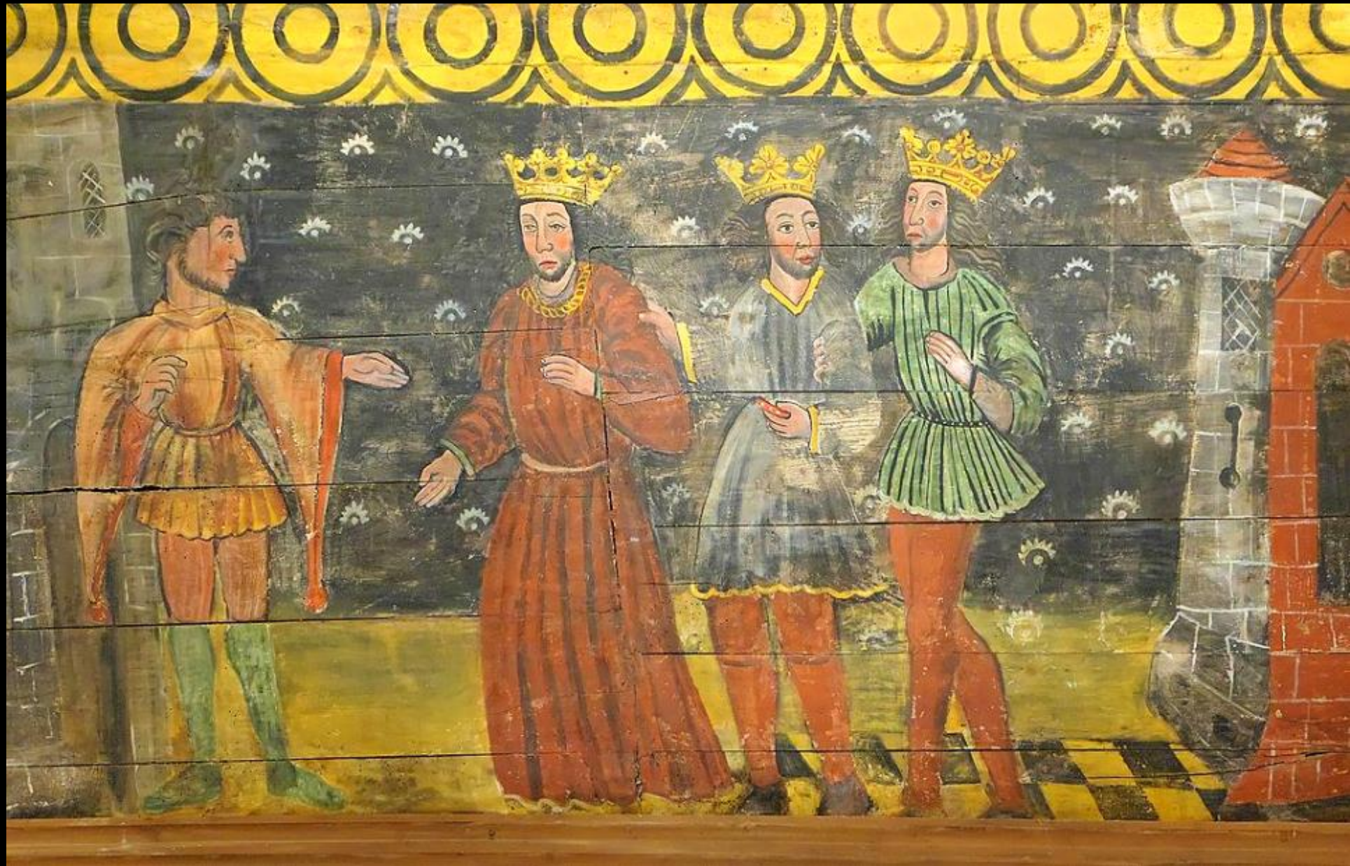
Herod with the Three Kings -- Church of Saint-Gonery, Plougrescant, France