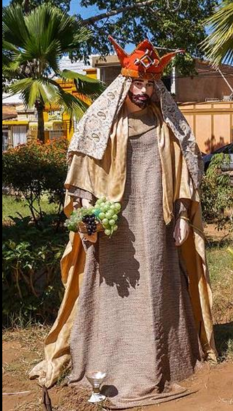
Figure of the Tres Reyes Magos Maracaibo, Venezuela