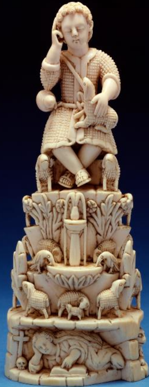
Christ Child as Good Shepherd

Goa, India Walters Art Museum Baltimore, MD