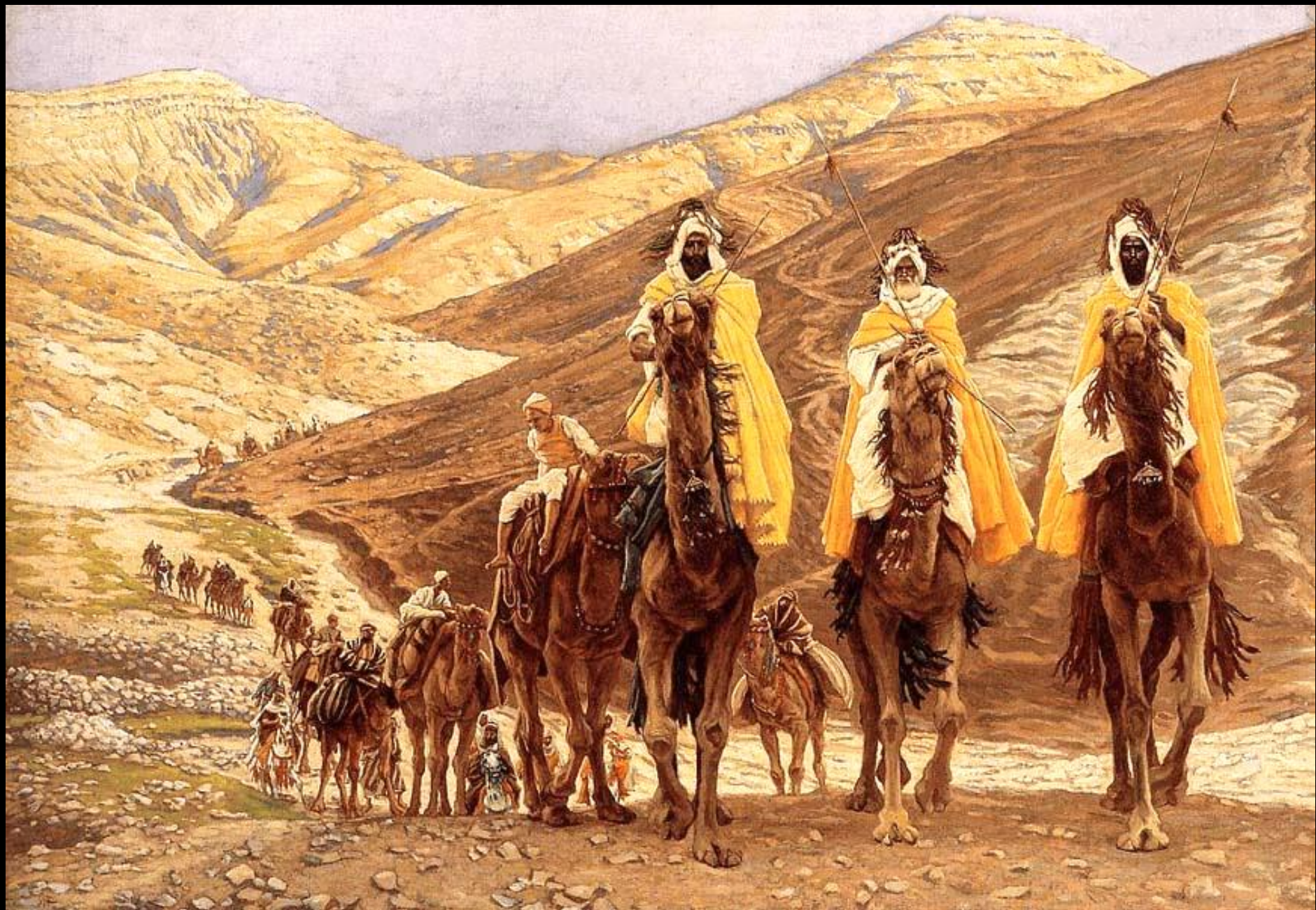
Journey of the Magi -- James Tissot, Minneapolis Institute of Art, Minneapolis, MN