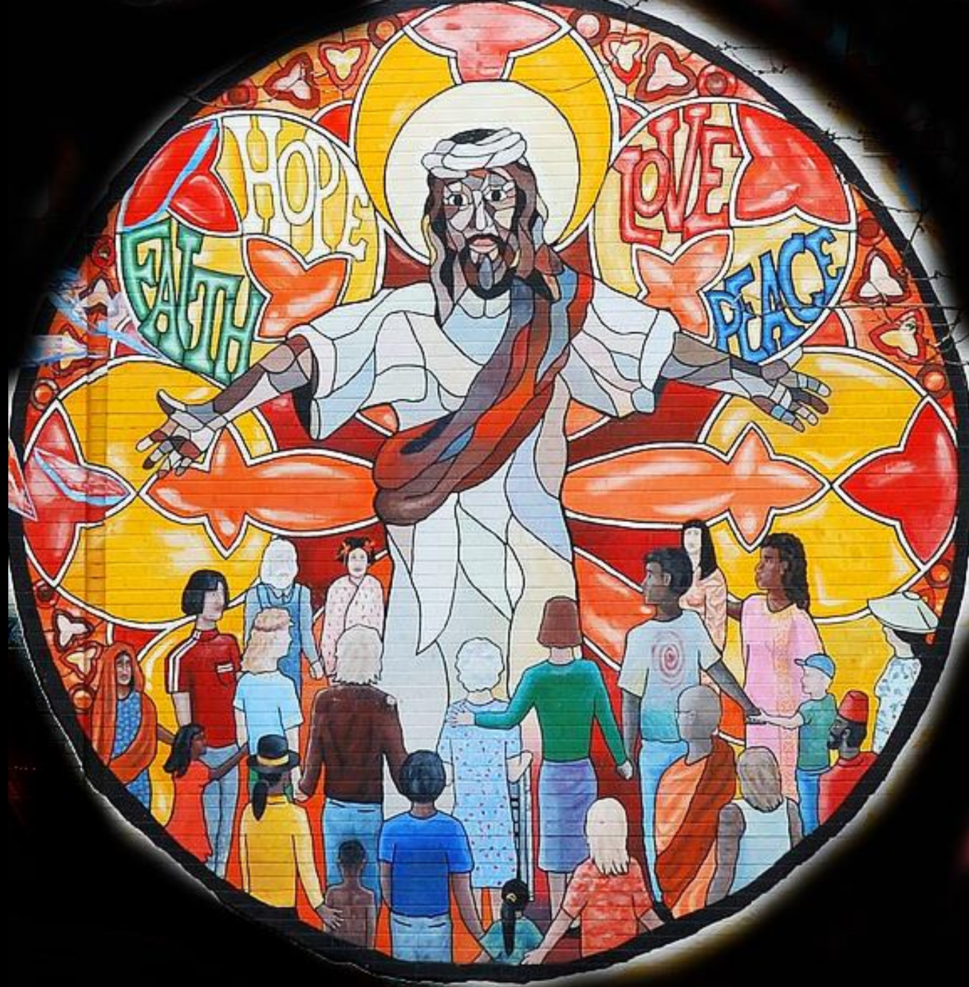
Jesus Mural In Uptown