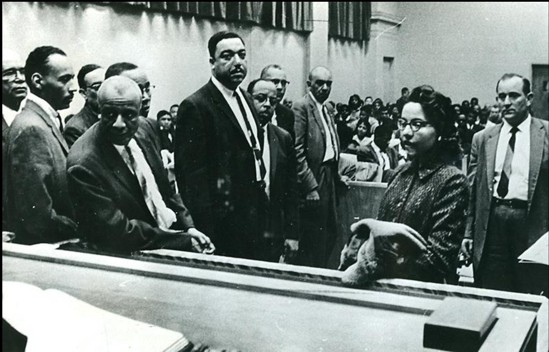
Courtroom Hearing, Civil Rights Protest, Nashville, TN