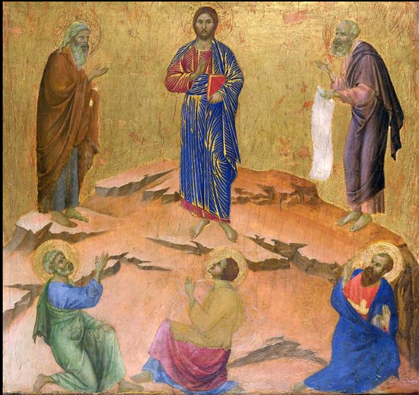
Transfiguration -- Duccio, National Gallery of Art, Washington, DC