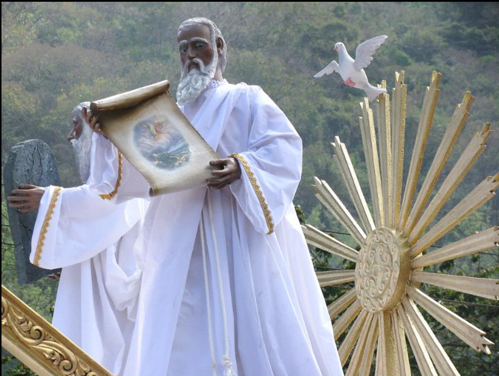
Moses, Procession of the Transfiguration, Mount Tabor, Antigua, Guatemala