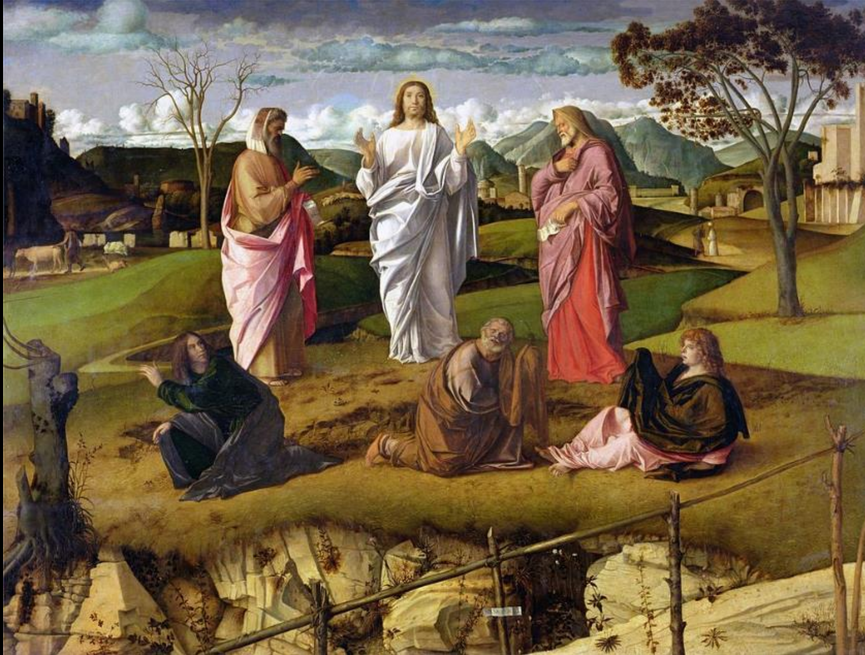
Transfiguration of Christ -- Giovanni Bellini, National Museum of Capodimonte, Naples, Italy