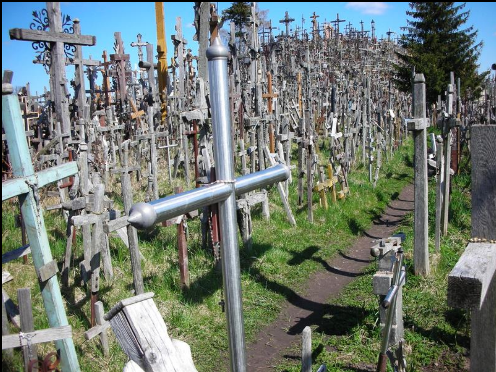
Hill of Crosses -- Saiulia , Lithuania