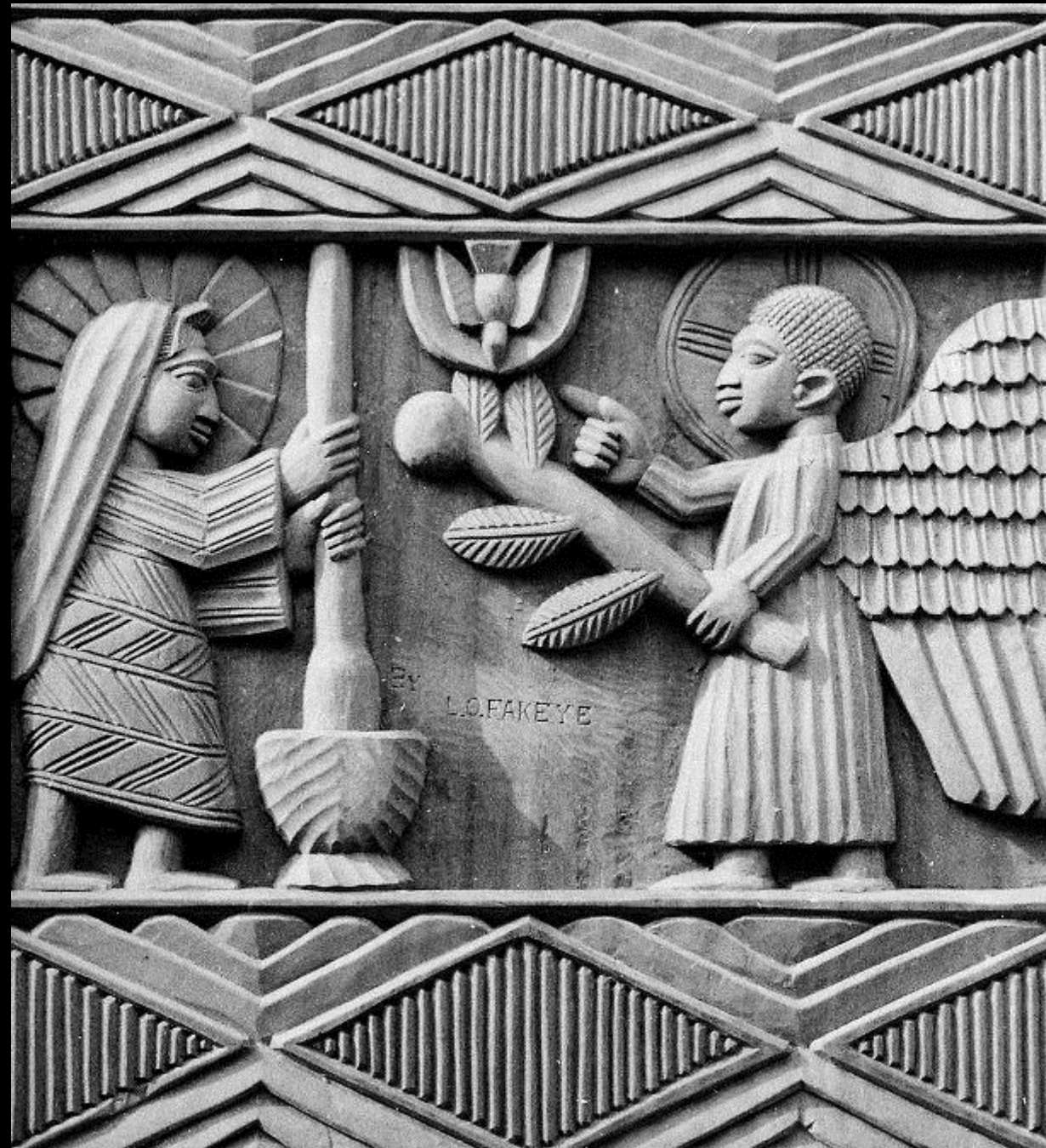
Annunciation to Mary