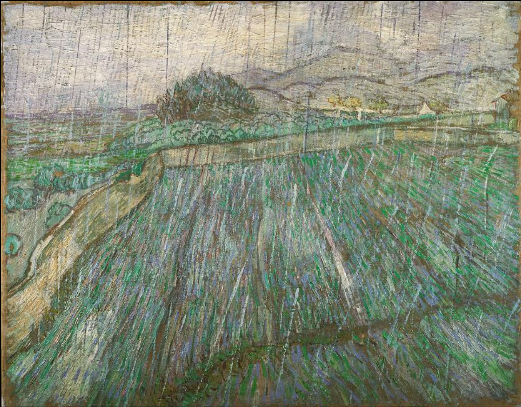
Wheat Field in Rain -- Vincent van Gogh, Philadelphia Museum of Art