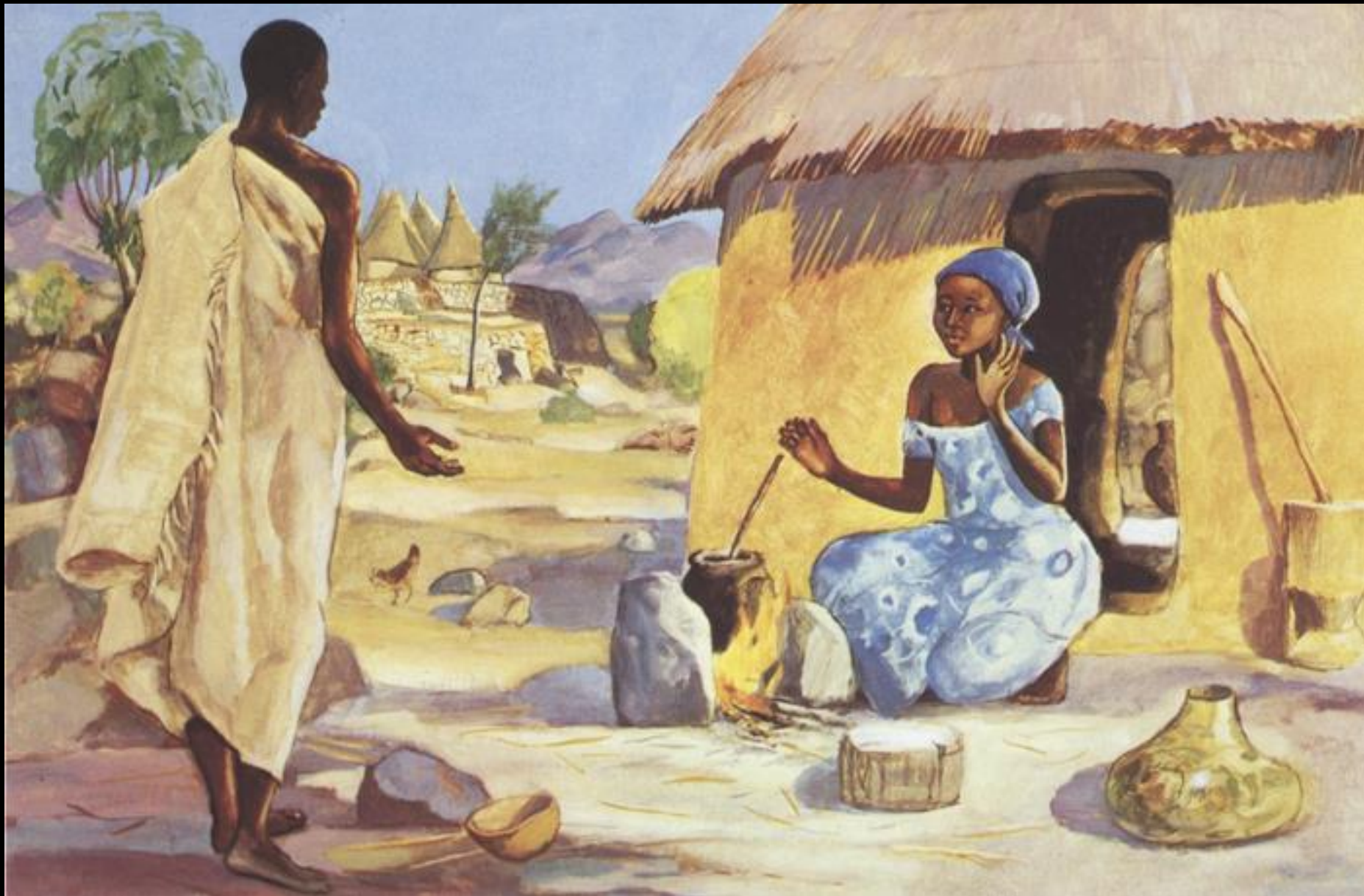
The Annunciation -- JESUS MAFA, Cameroon