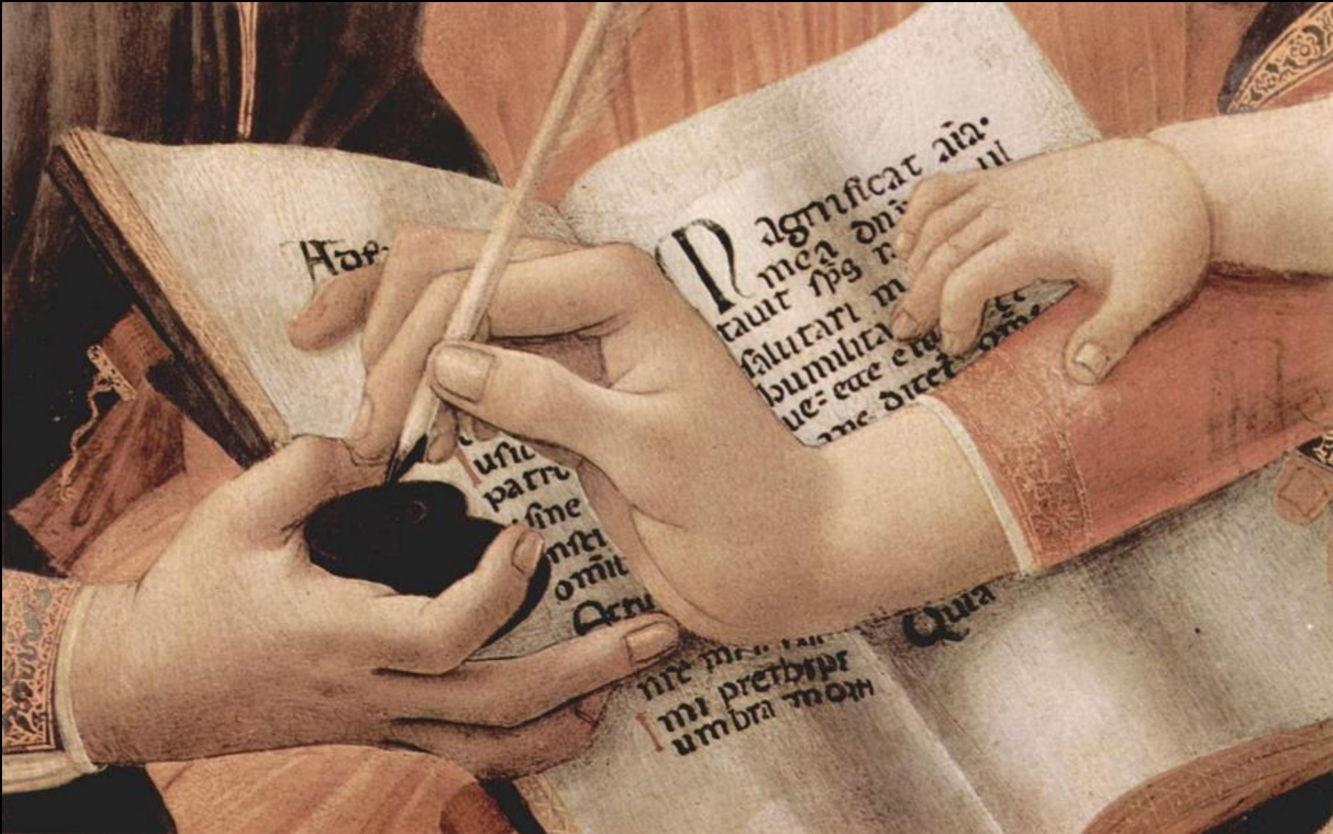
Madonna of the Magnificat -- Botticelli, Uffizi, Florence, Italy