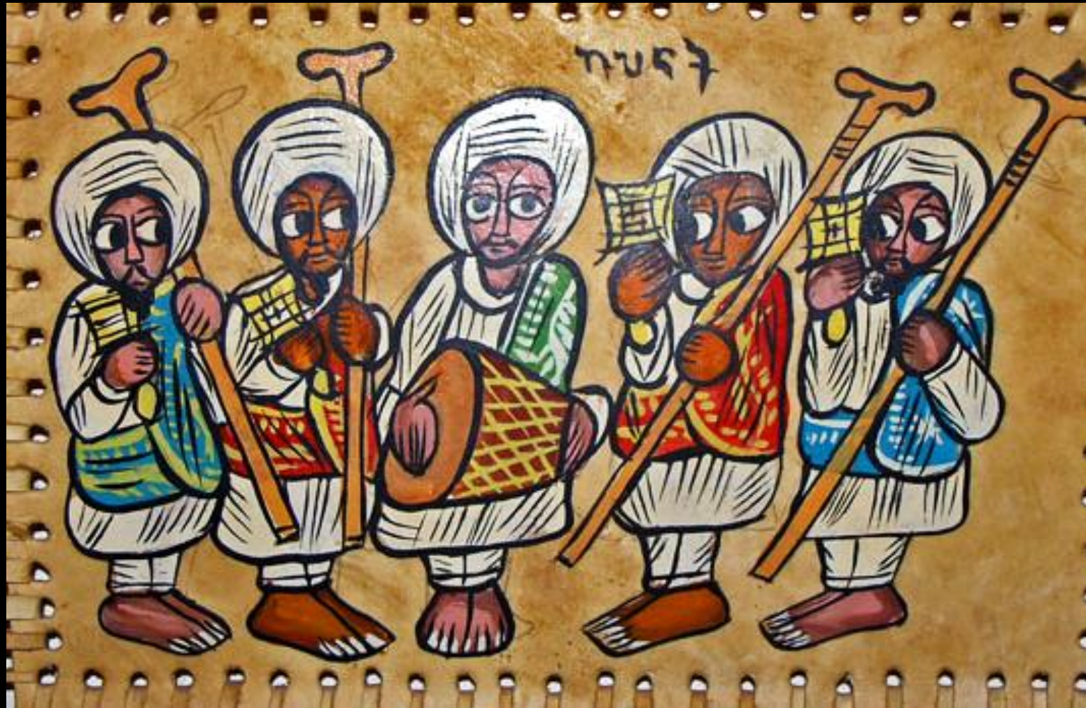
Ethiopian Orthodox Choir -- Paint on stretched leather