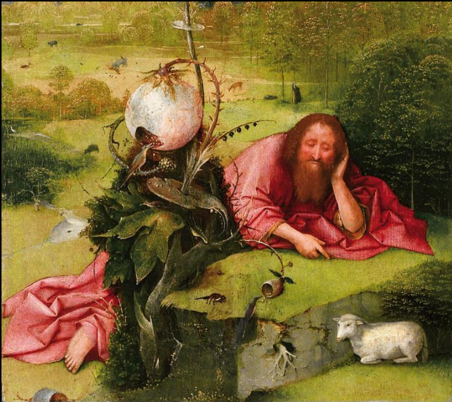
John the Baptist in the Wilderness

Hieronymus Bosch Museum of Lázaro Galdiano Madrid, Spain