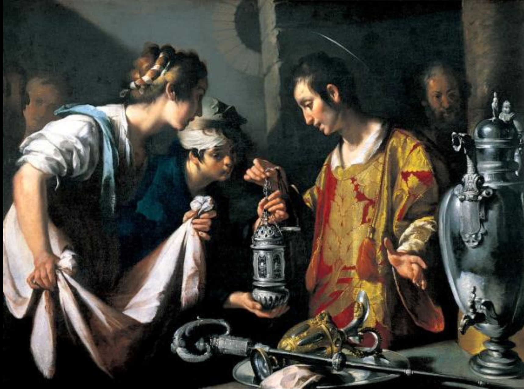
St. Lawrence Distributing the Riches of the Church -- Bernardo Strozzi, St. Louis Art Museum