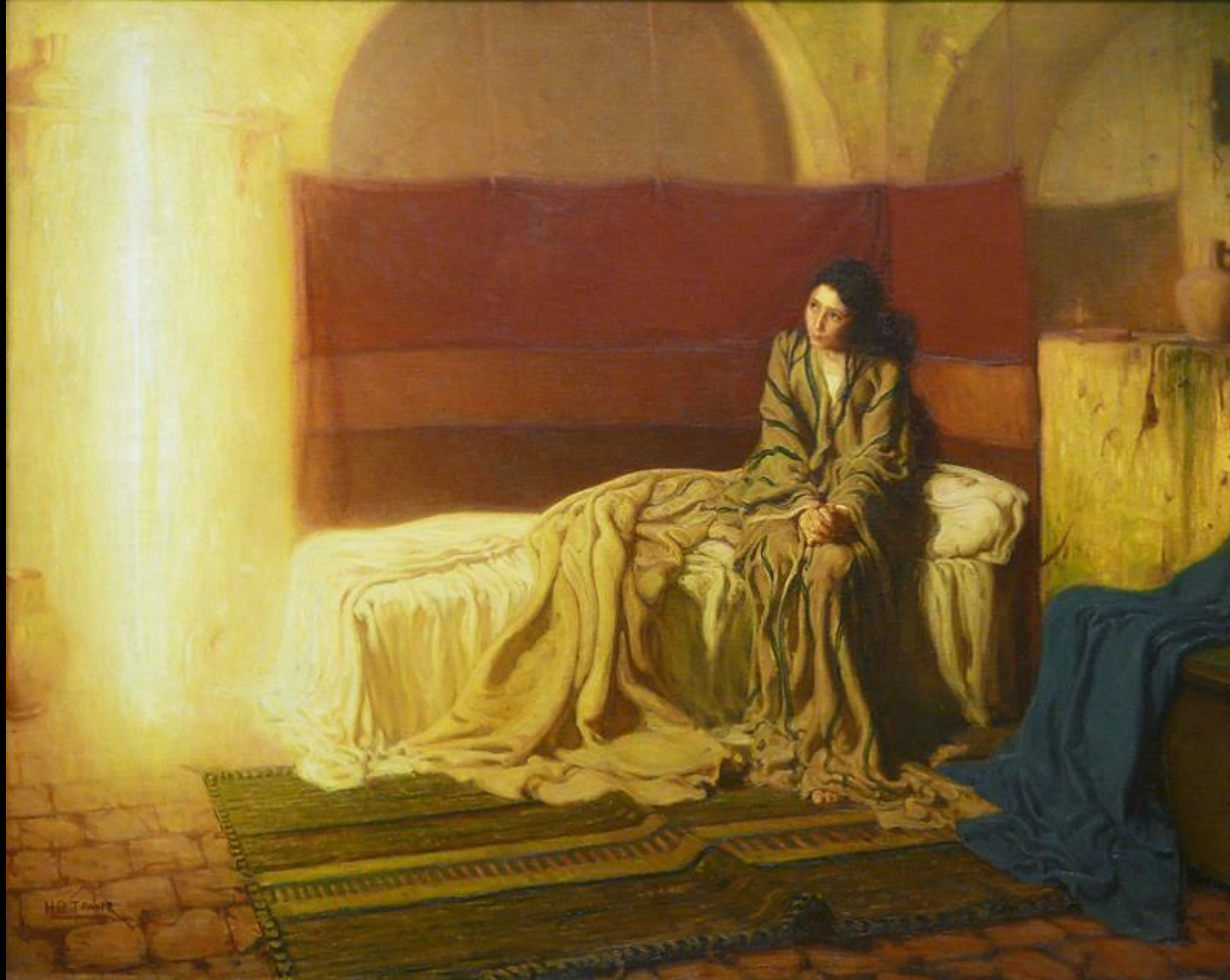
Annunciation -- Henry Ossawa Tanner, Philadelphia Museum of Art