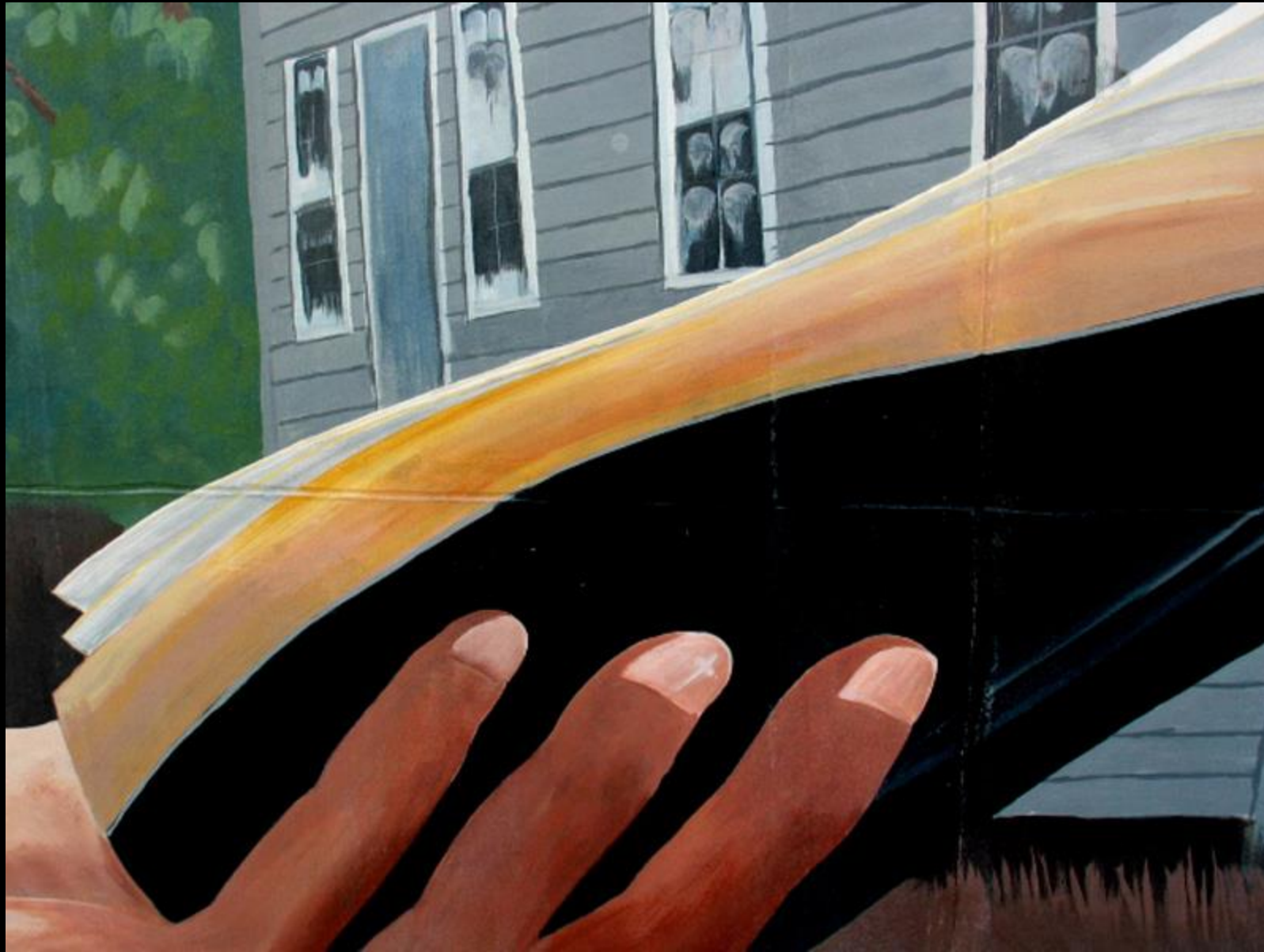
Billy Graham Preaching (detail) -- Palatka, FL