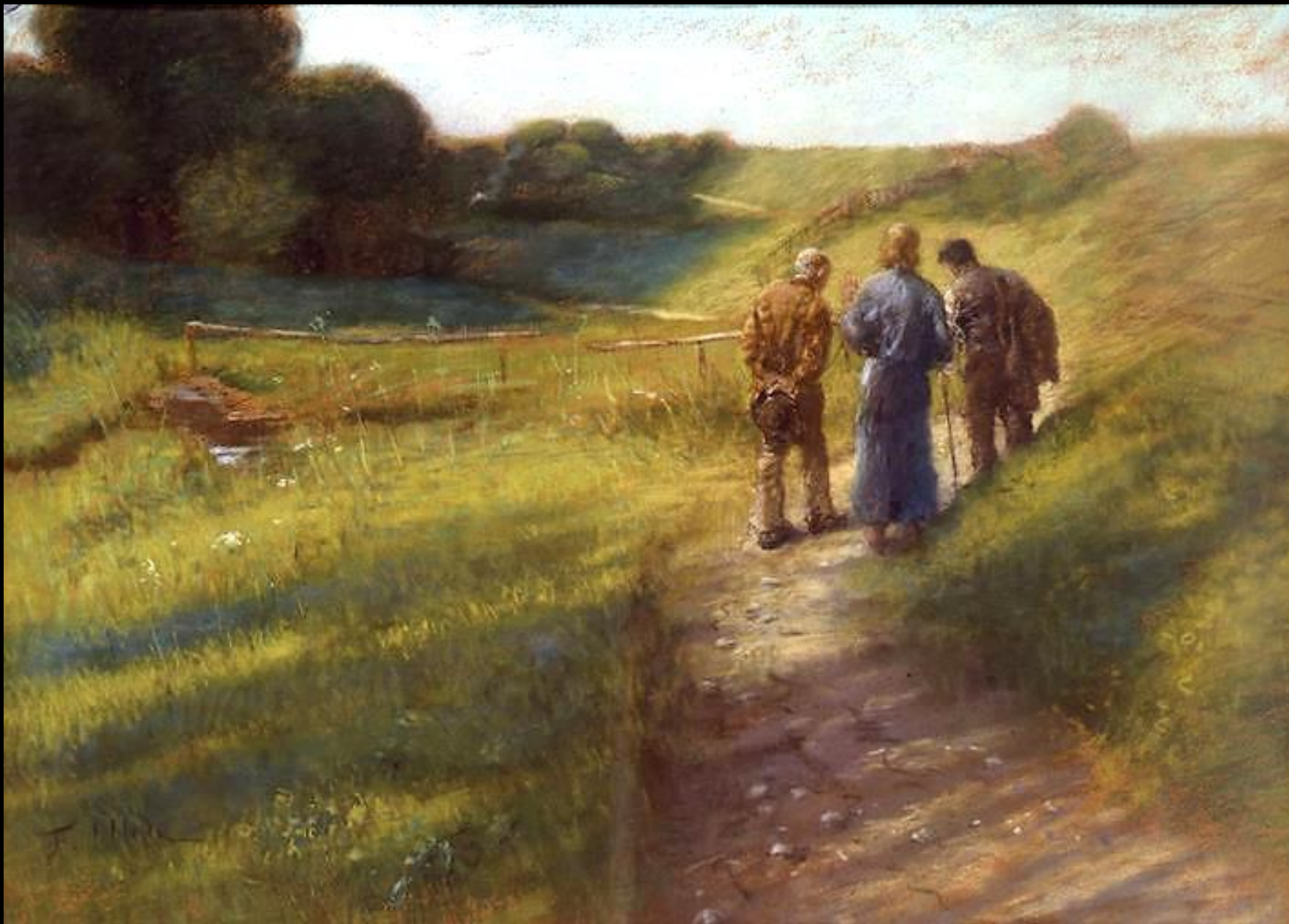
Road to Emmaus -- Fritz von Uhde, New Masters Gallery, Dresden, Germany