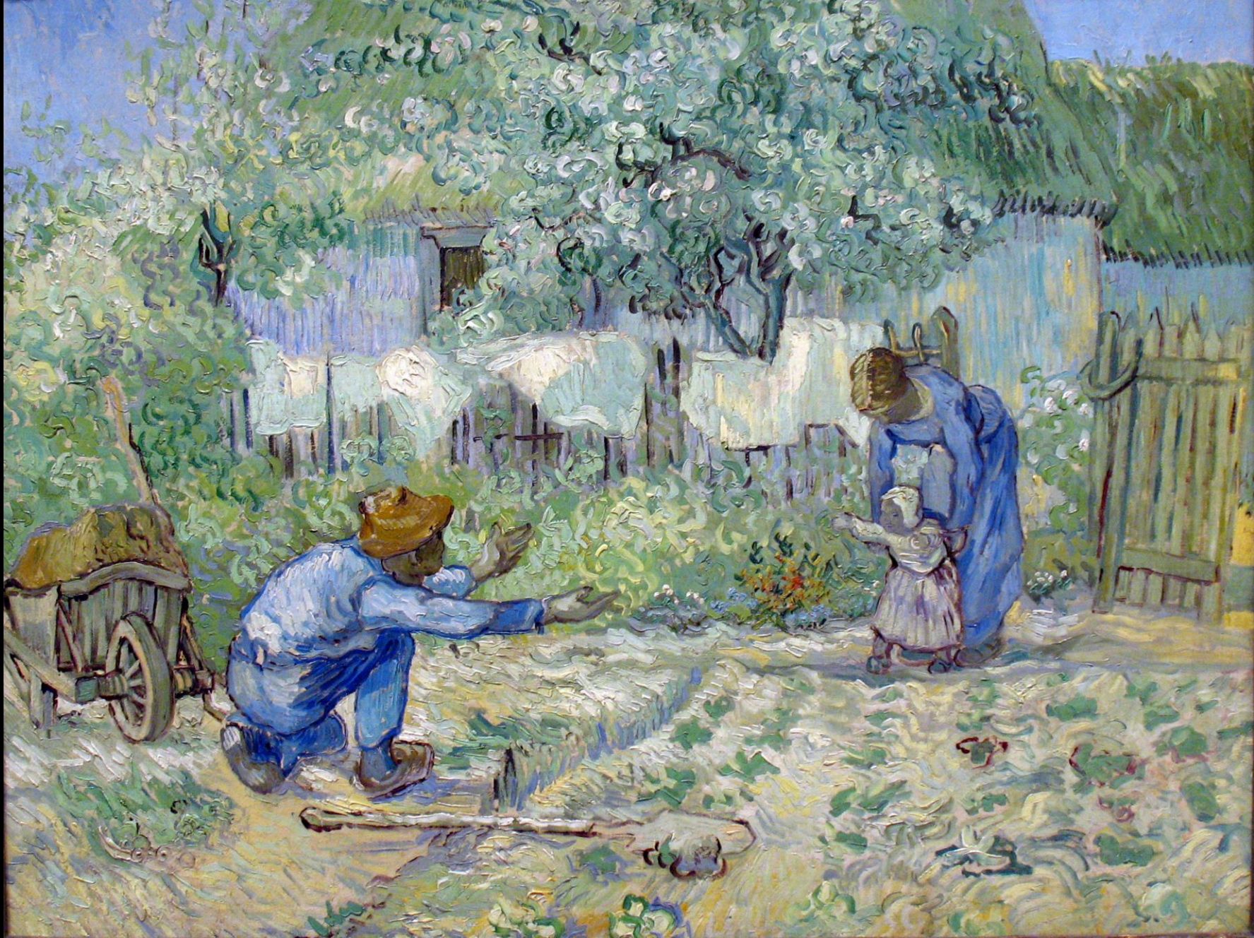
First Steps -- Vincent Van Gogh, Metropolitan Museum of Art, New York