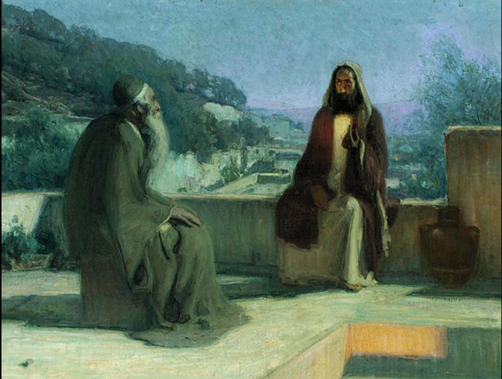
Nicodemus and Jesus on a Rooftop -- Henry Ossawa Tanner, Philadelphia Museum of Art