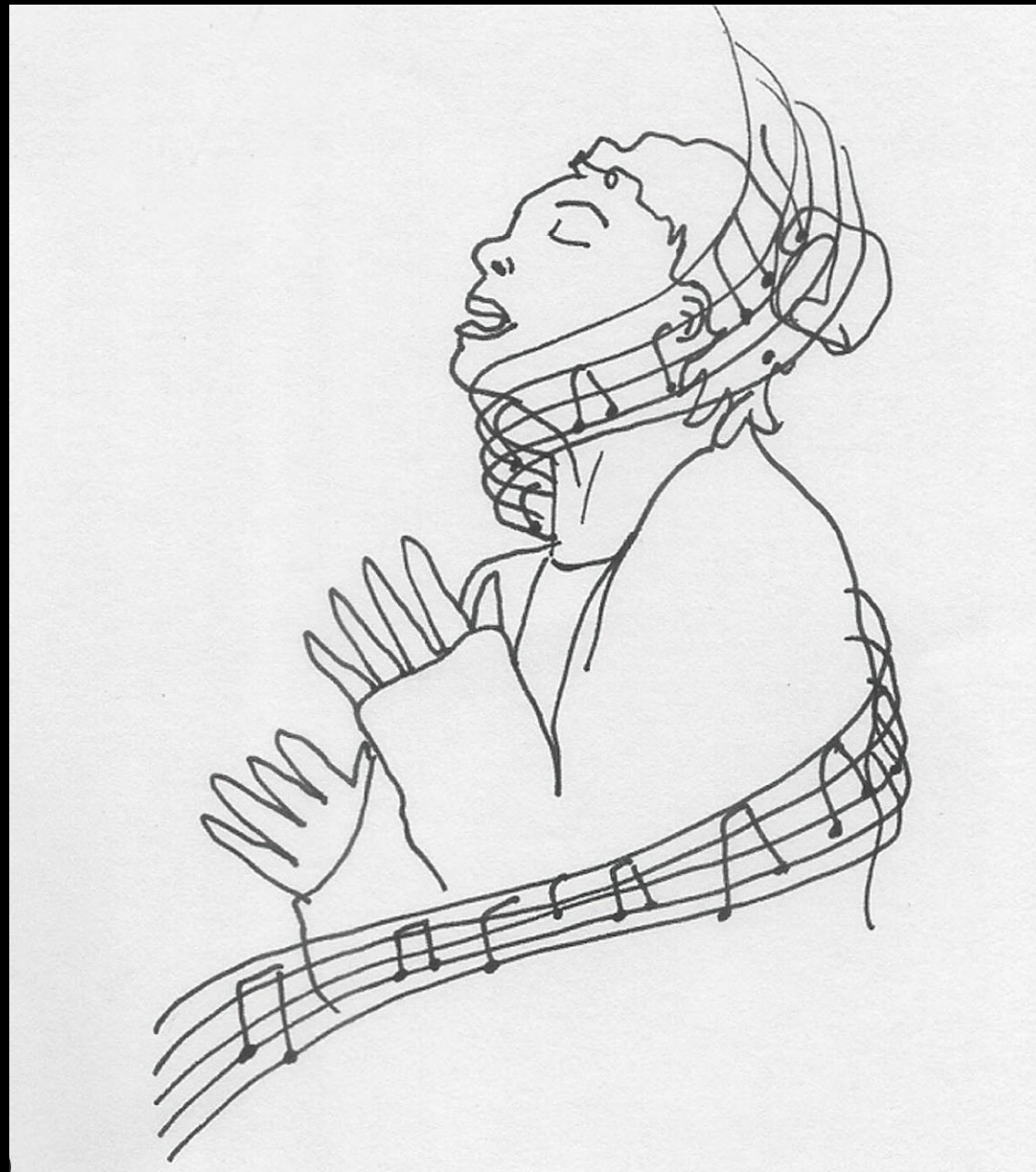
Praise -- Liz Valente