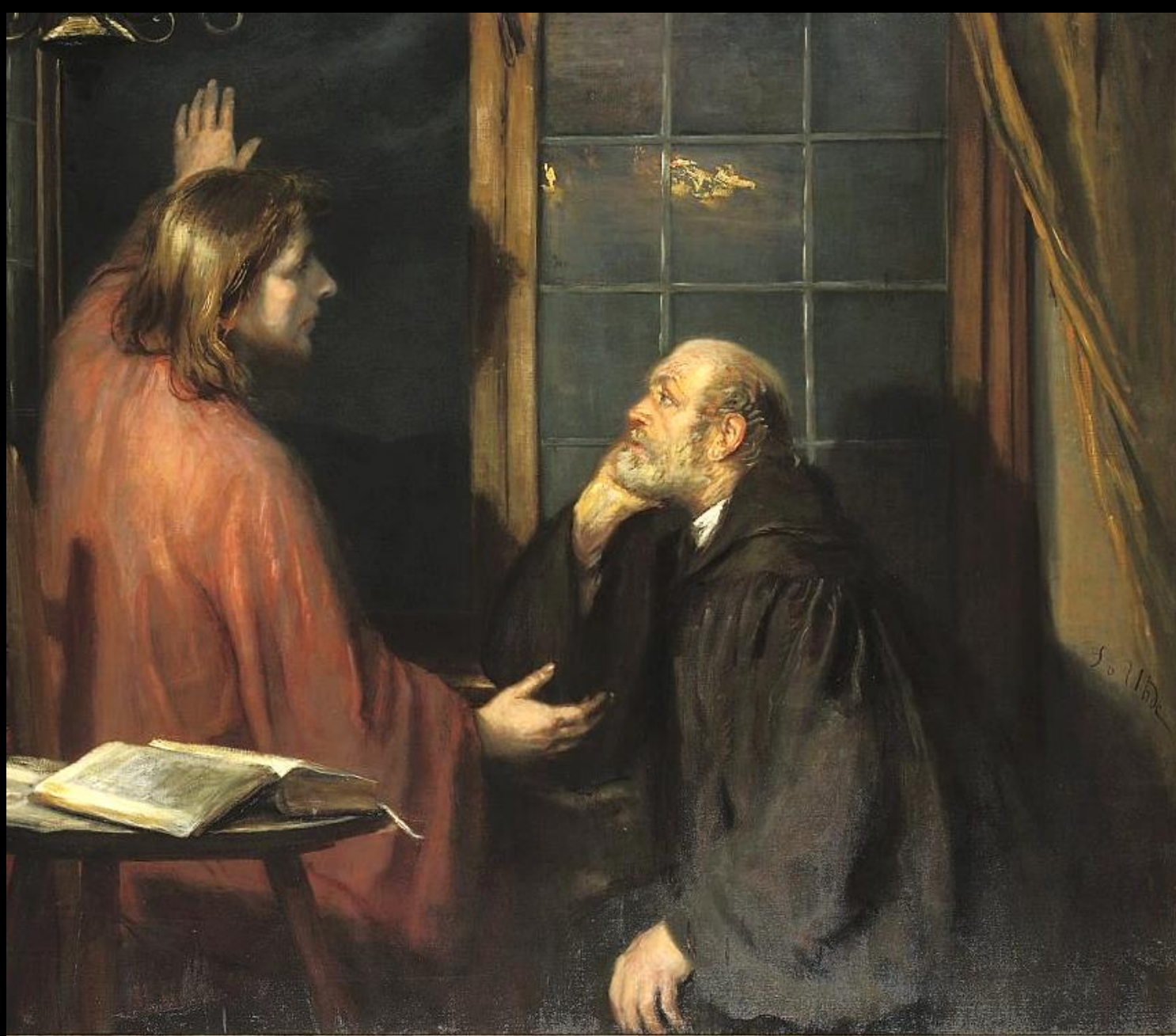
Nicodemus and Christ -- Fritz von Uhde