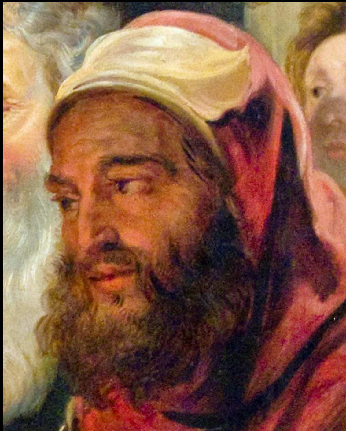
Christ Instructing Nicodemus (detail) Jacob Jordaens Royal Museum Brussels, Belgium