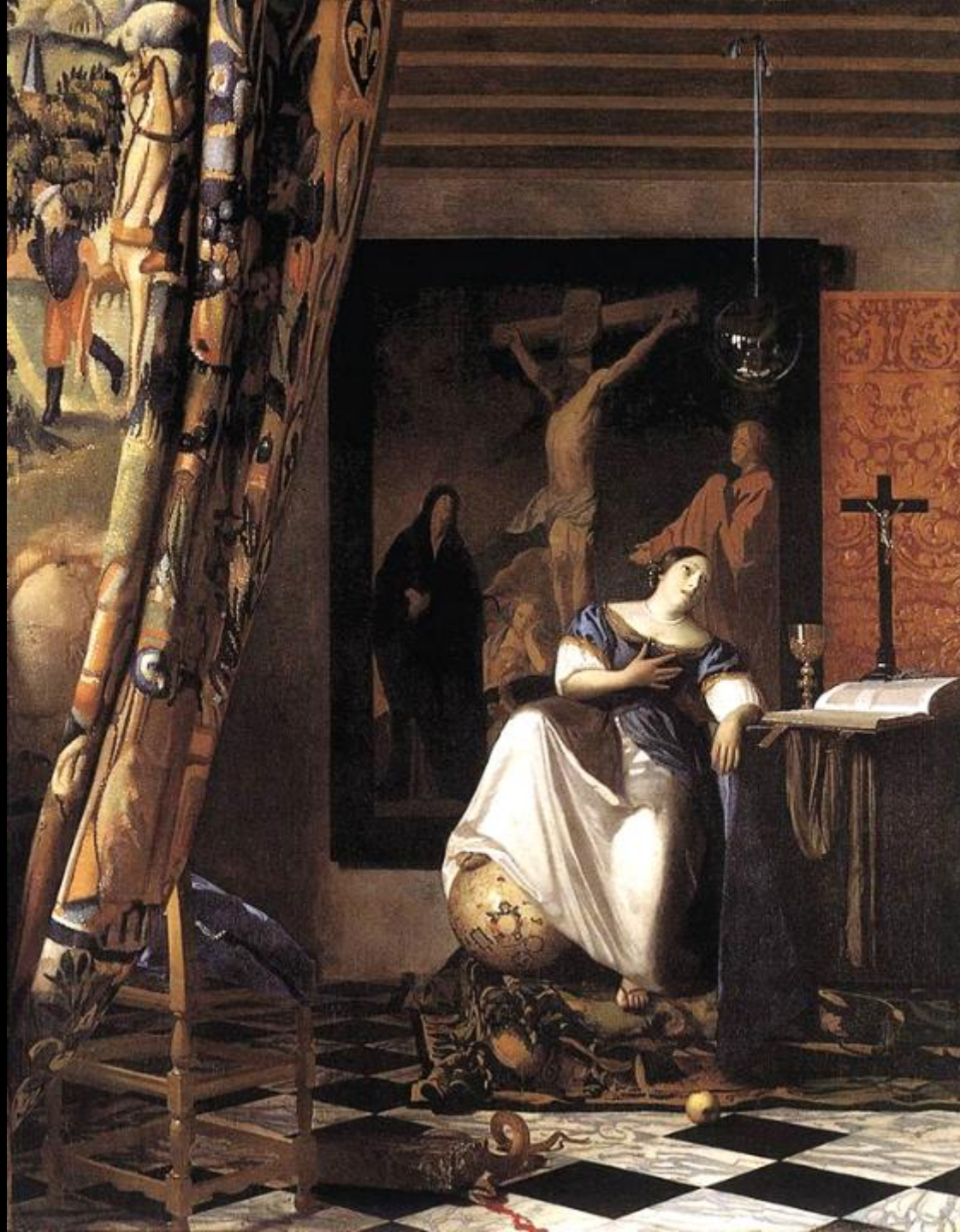
Allegory of Faith

Johannes Vermeer Metropolitan Museum of Art New York City