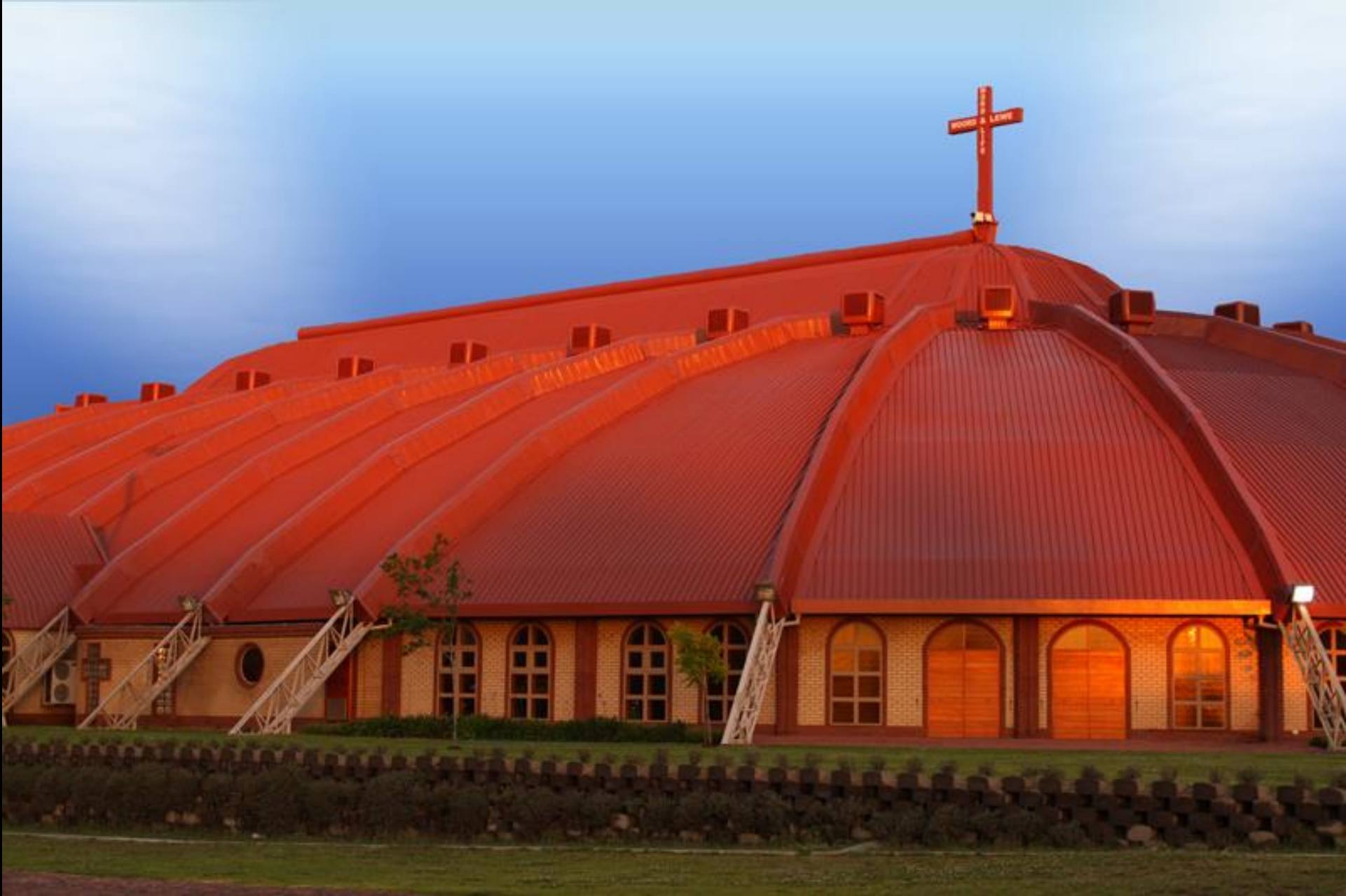
Apostolic Faith Mission Word and Life Church -- Boksburg, South Africa