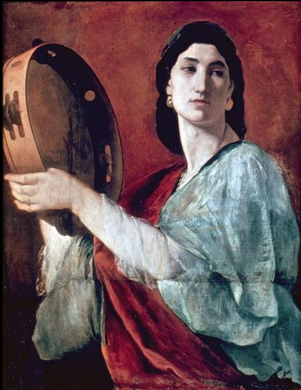
The Prophet Miriam

Anselm Feuerbach Berlin State Museums Berlin, Germany