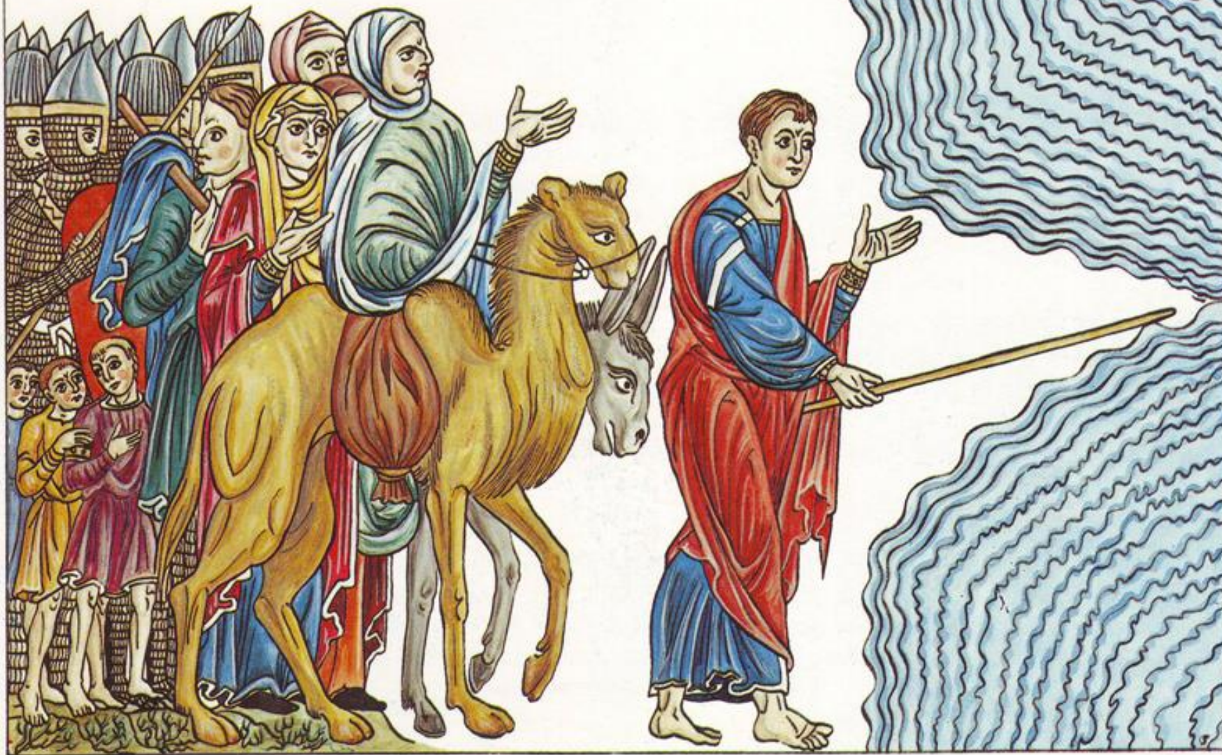
Crossing of the Red Sea -- Abbess of Hohenburg, Hortus Deliciarum

Dixit Dñs ad Moysen Eleva virgam tuam & extende manum tuam super mare & divide illud ut gradientur filii Israel in medio mari per siccum