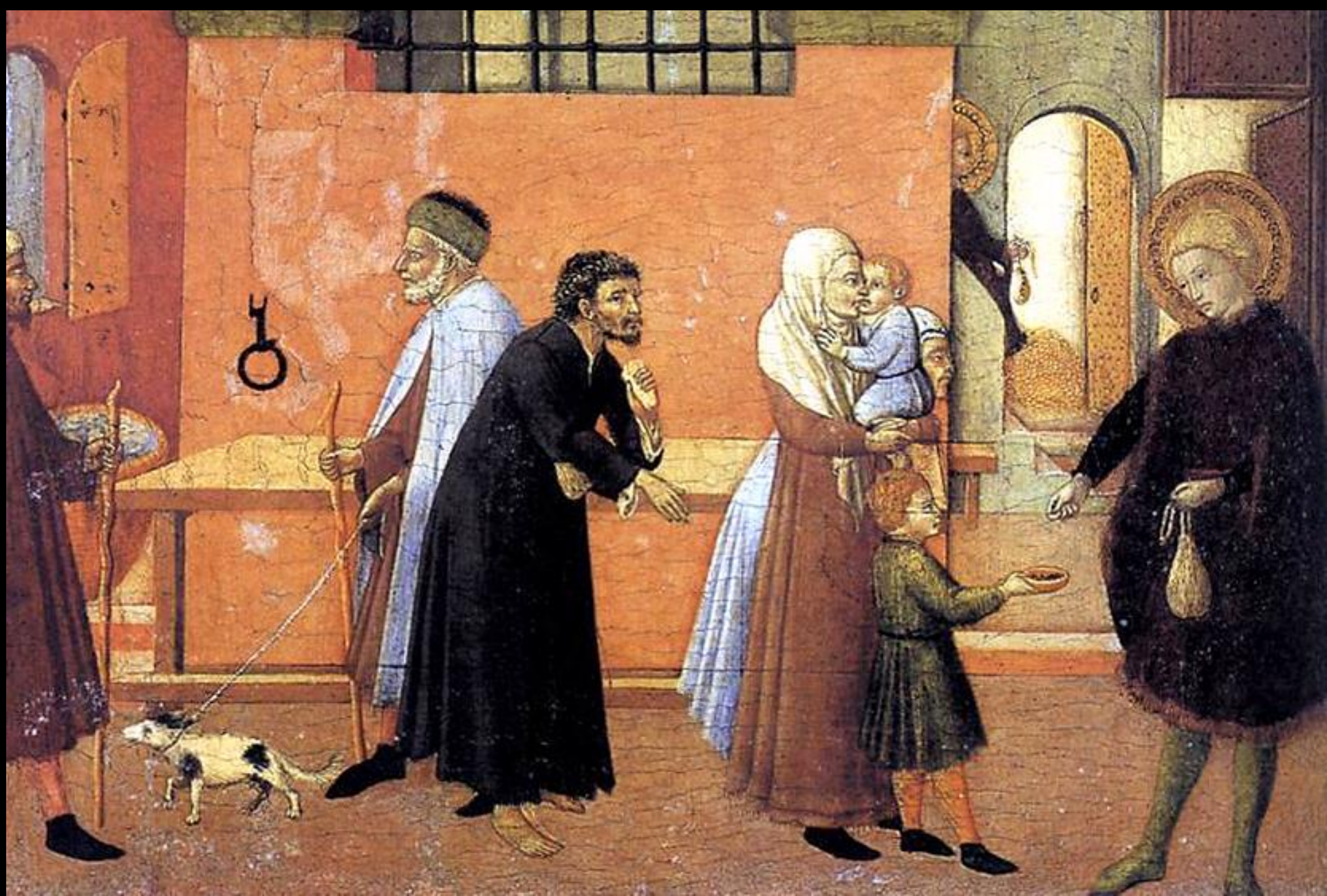
St. Lawrence Distributing the Riches of the Church -- Master of the Osservanza, National Gallery, Washington, DC