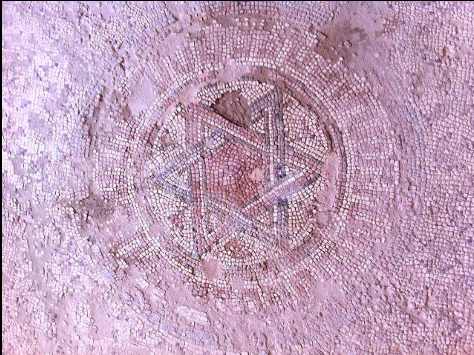
Star of David -- Fourth century C.E., Byzantine Basilica, Shilo, Israel