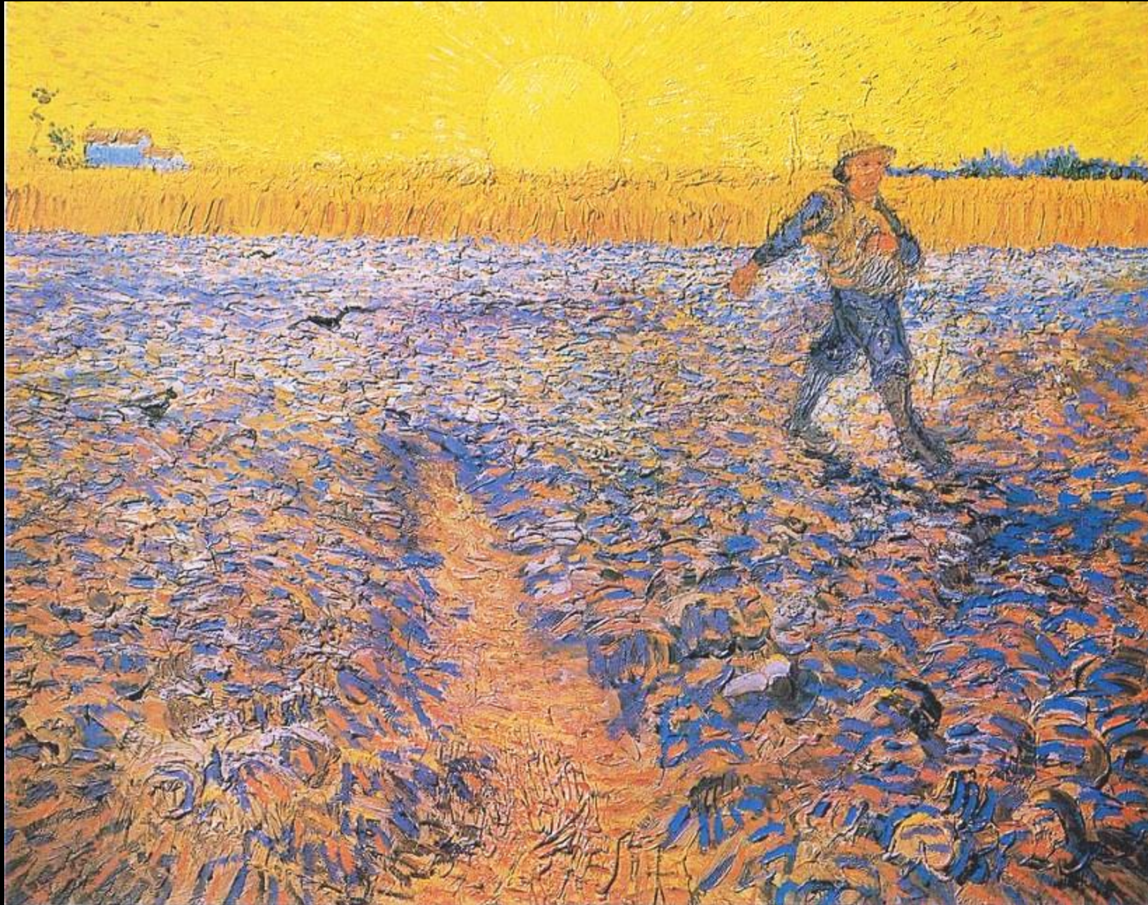
Sower at Sunset -- Vincent van Gogh, Kroller-Muller Museum, Otterlo, Netherlands