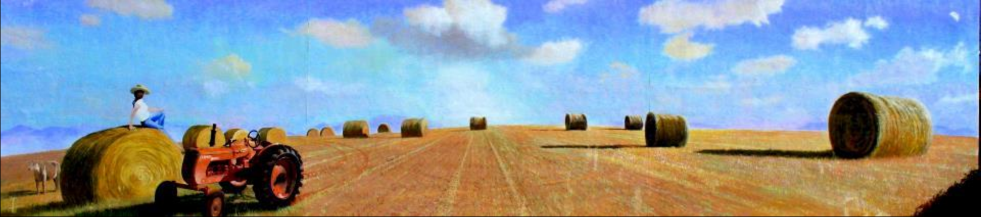
Farm Mural, adjacent to Federal Land Bank Bldg, Columbia, SC