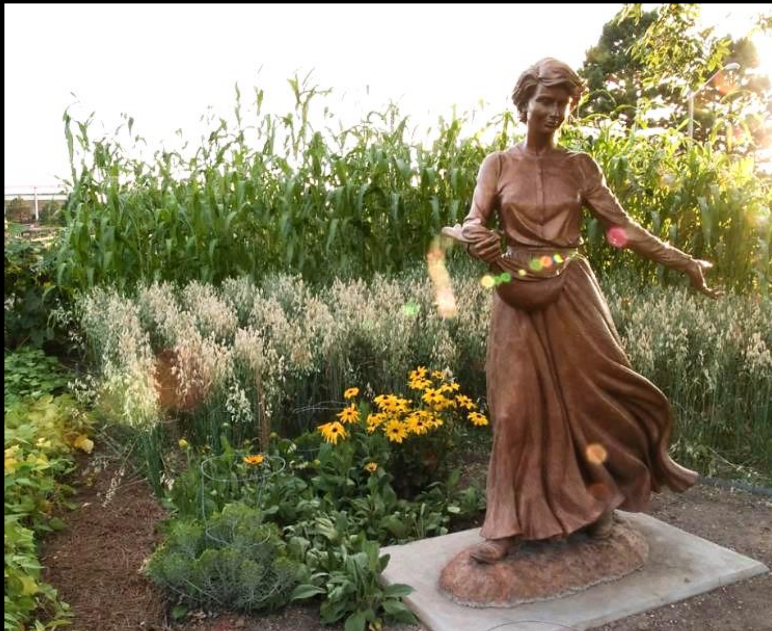
Seed and the Sower -- Cheyenne Botanic Gardens, Cheyenne, WY