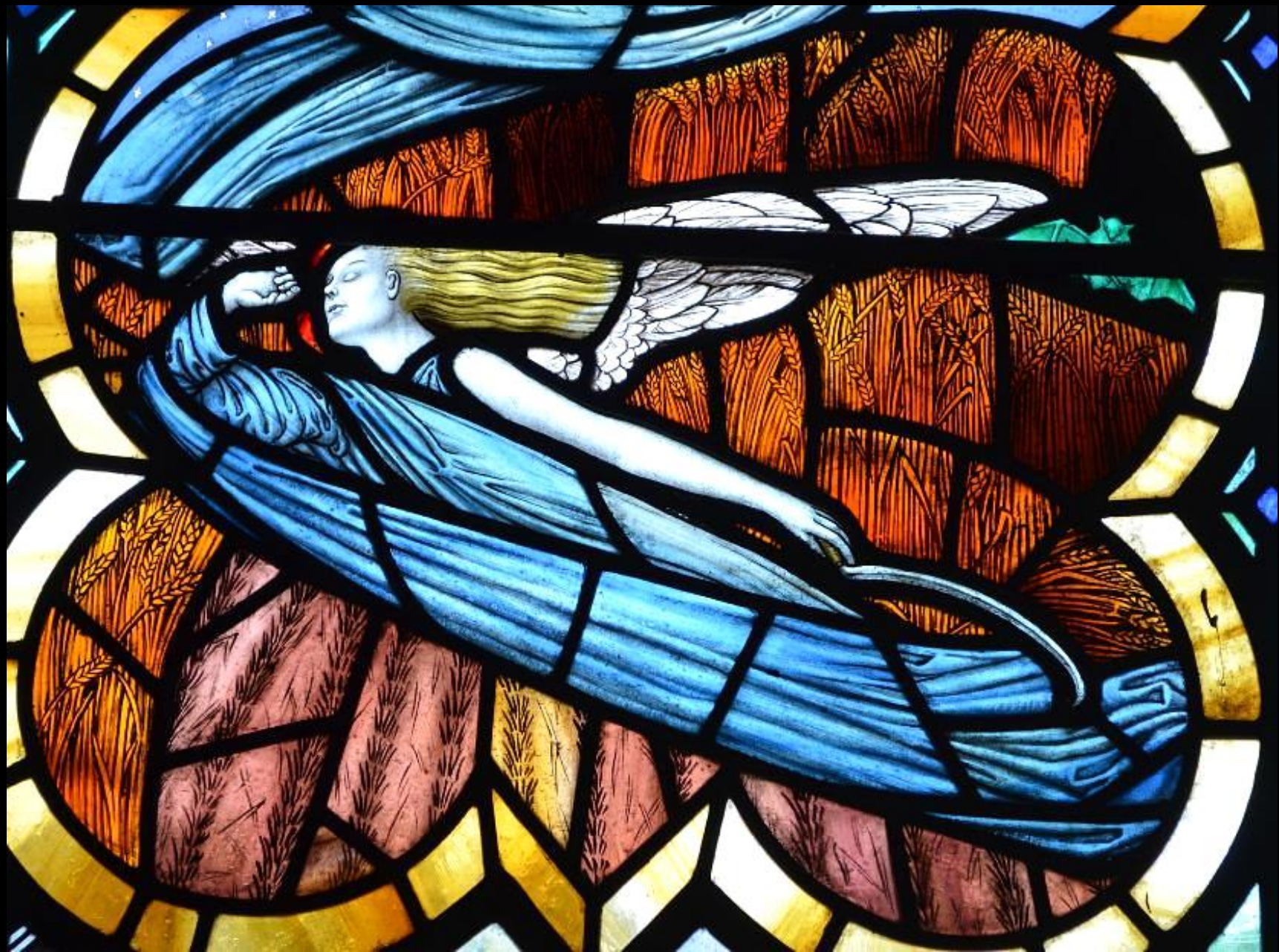
The Reaper -- William Morris & Co., Marden, UK