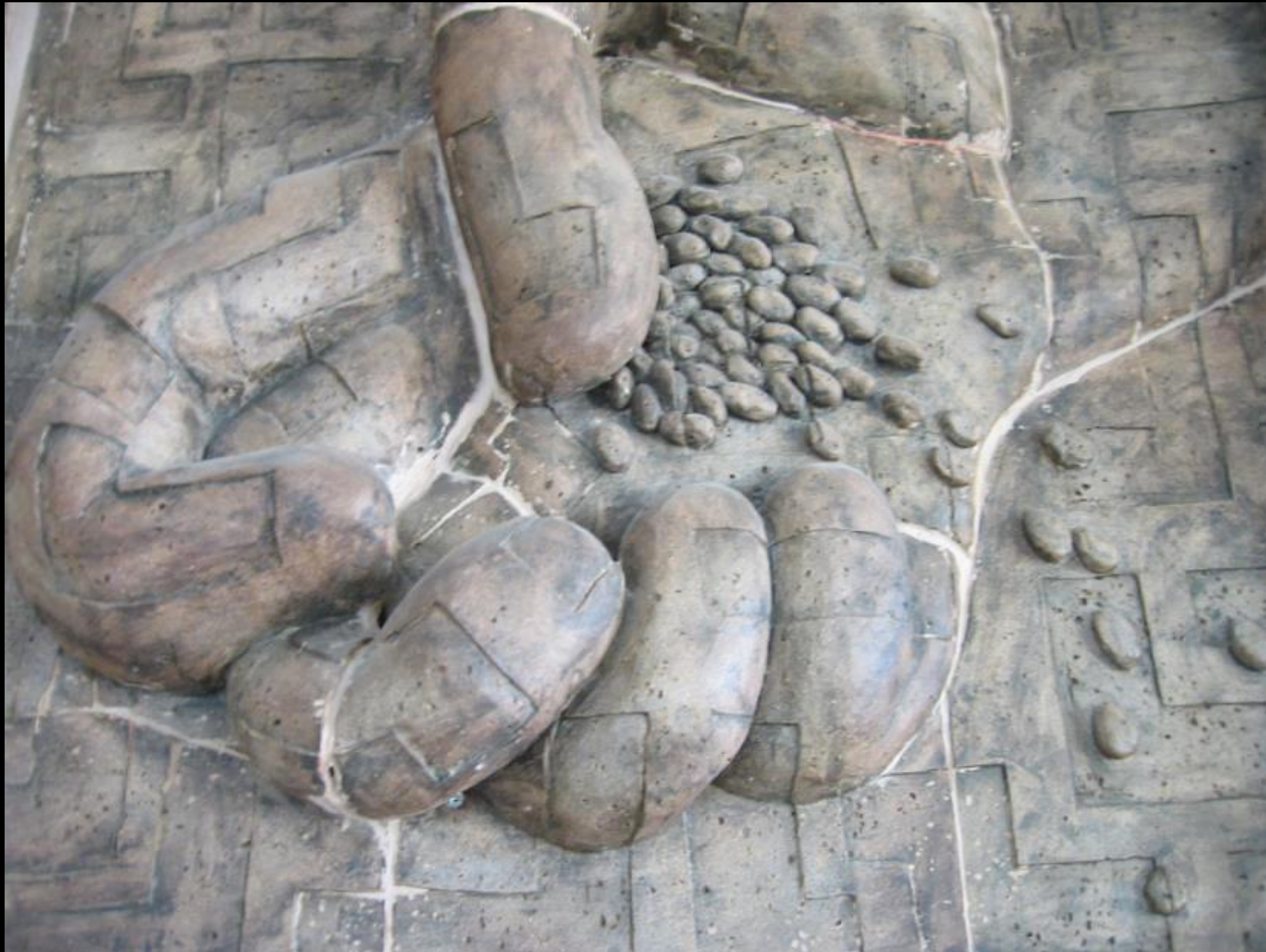
Sowing Seed -- Unidentified church sculpture