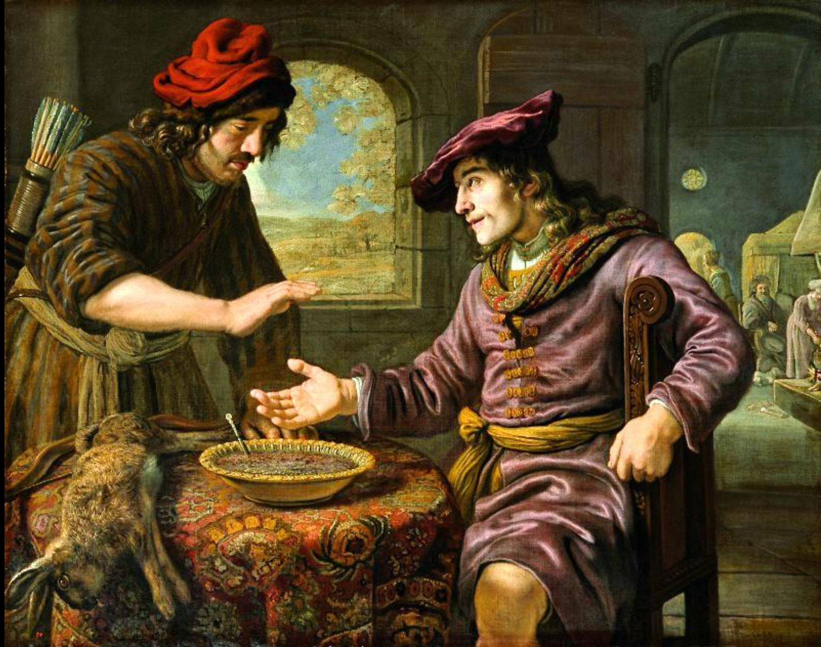
Esau, Jacob, and the Bowl of Pottage -- Jan Victor, Palace on the Water, Warsaw, Poland