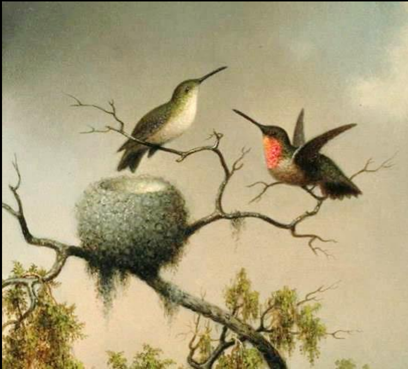
Hummingbirds with Nest -- Martin Heade, Museum of Fine Arts, Boston