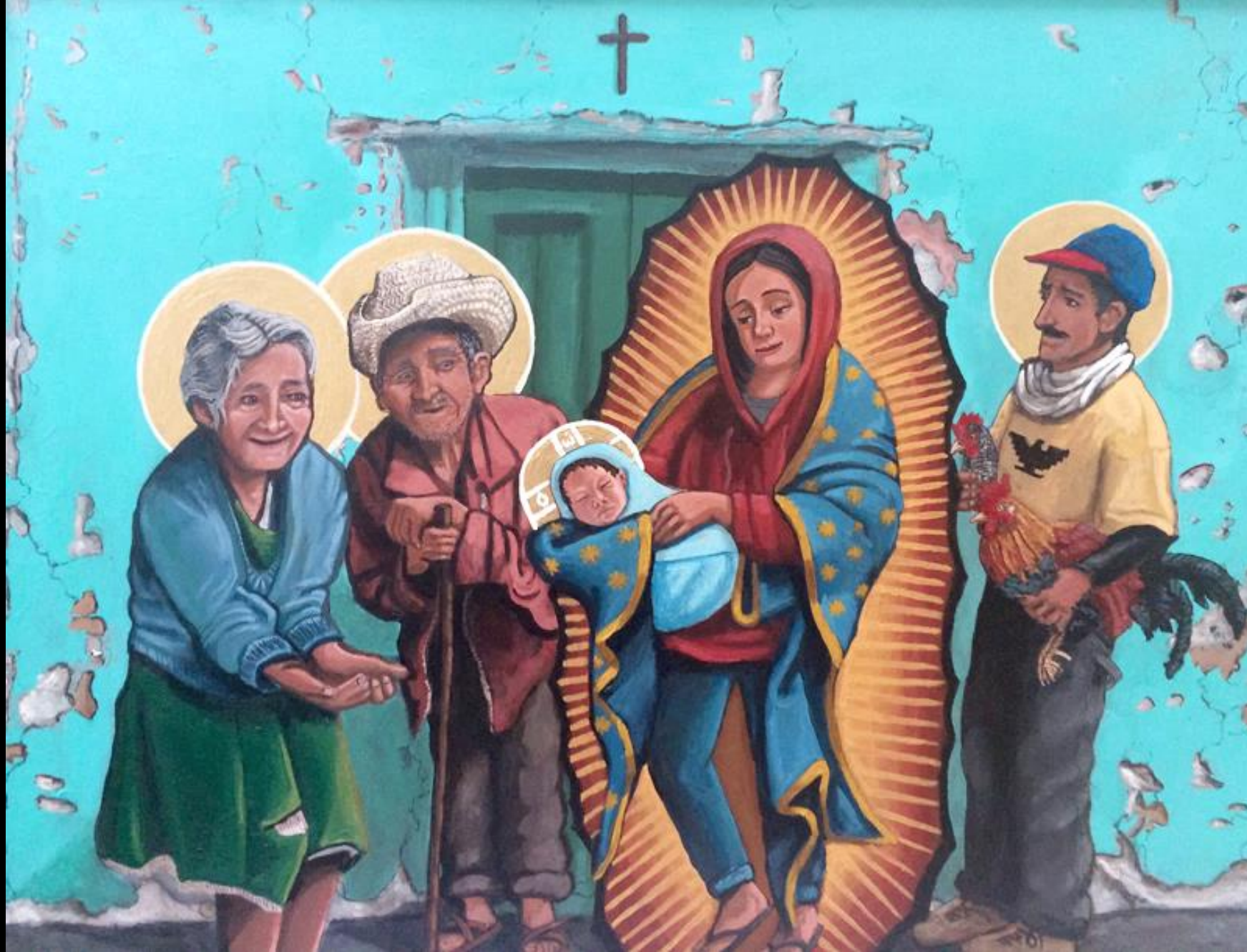
Presentation in the Temple -- Kelly Latimore, Longview, TX