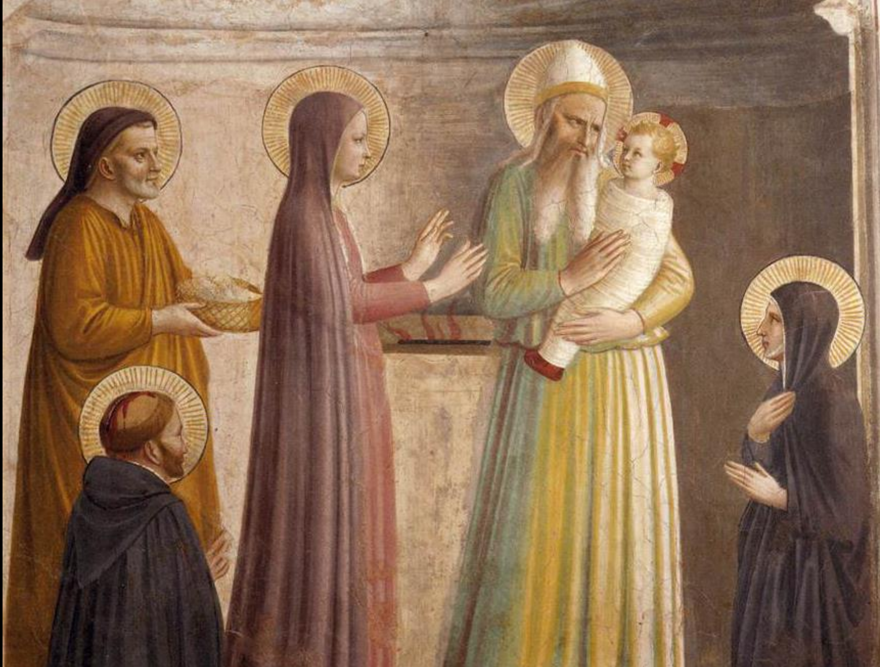
Presentation in the Temple -- Fra Angelico, Museum of San Marco, Florence, Italy