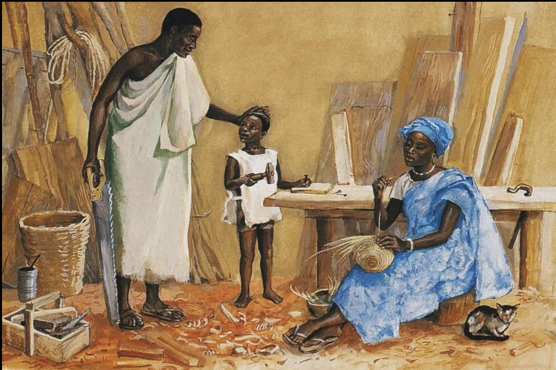
Jesus as a Child in Nazareth -- JESUS MAFA, Cameroon