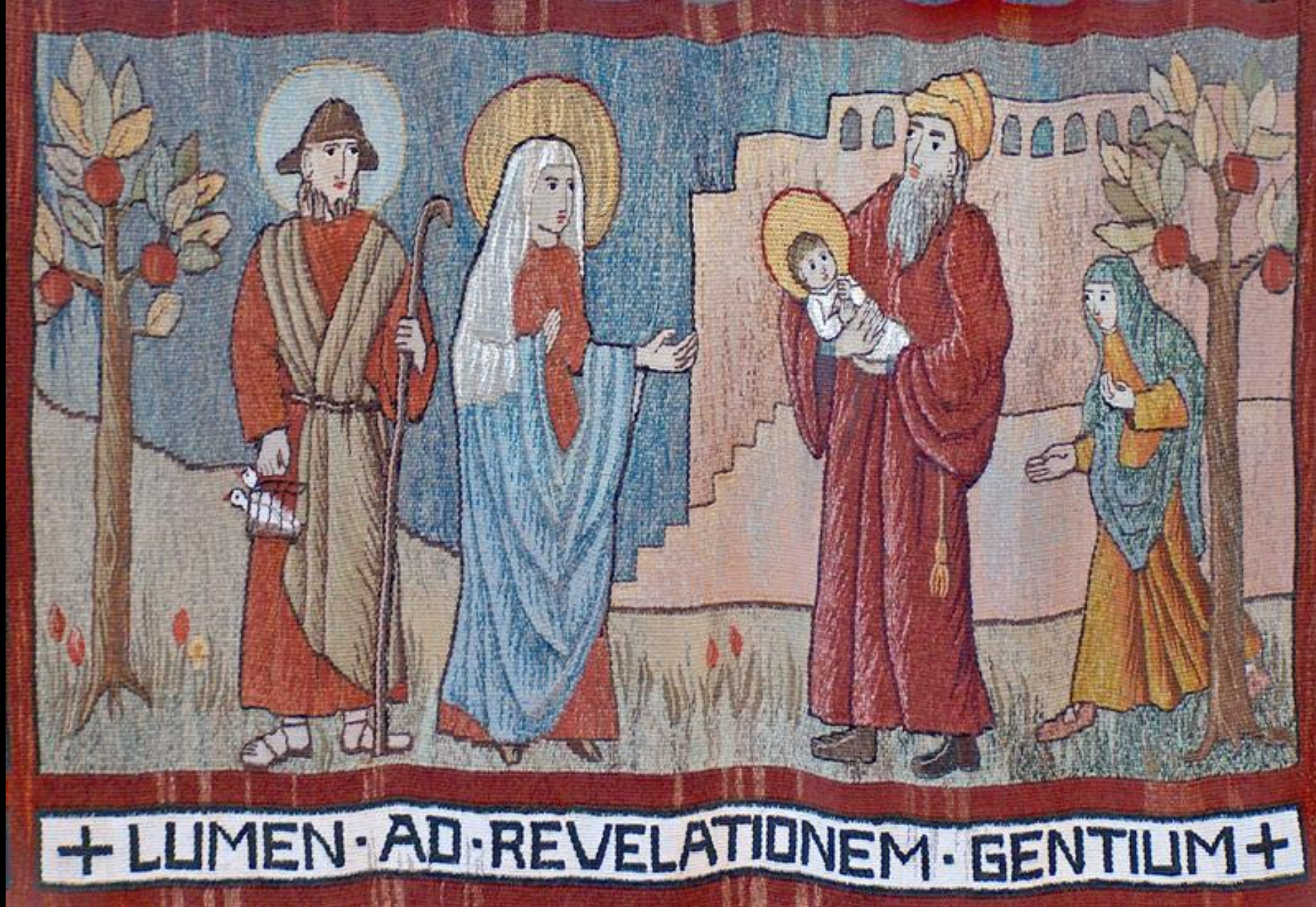
Presentation in the Temple -- Abbey of St. Walburga, Virginia Dale, CO