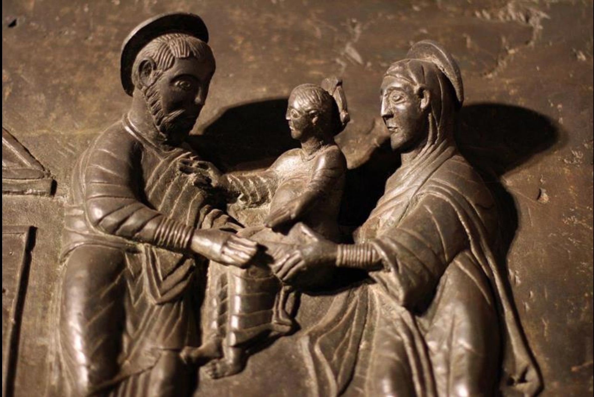
Presentation in the Temple -- Bernward's Doors, Hildesheim Cathedral, Hildesheim, Germany