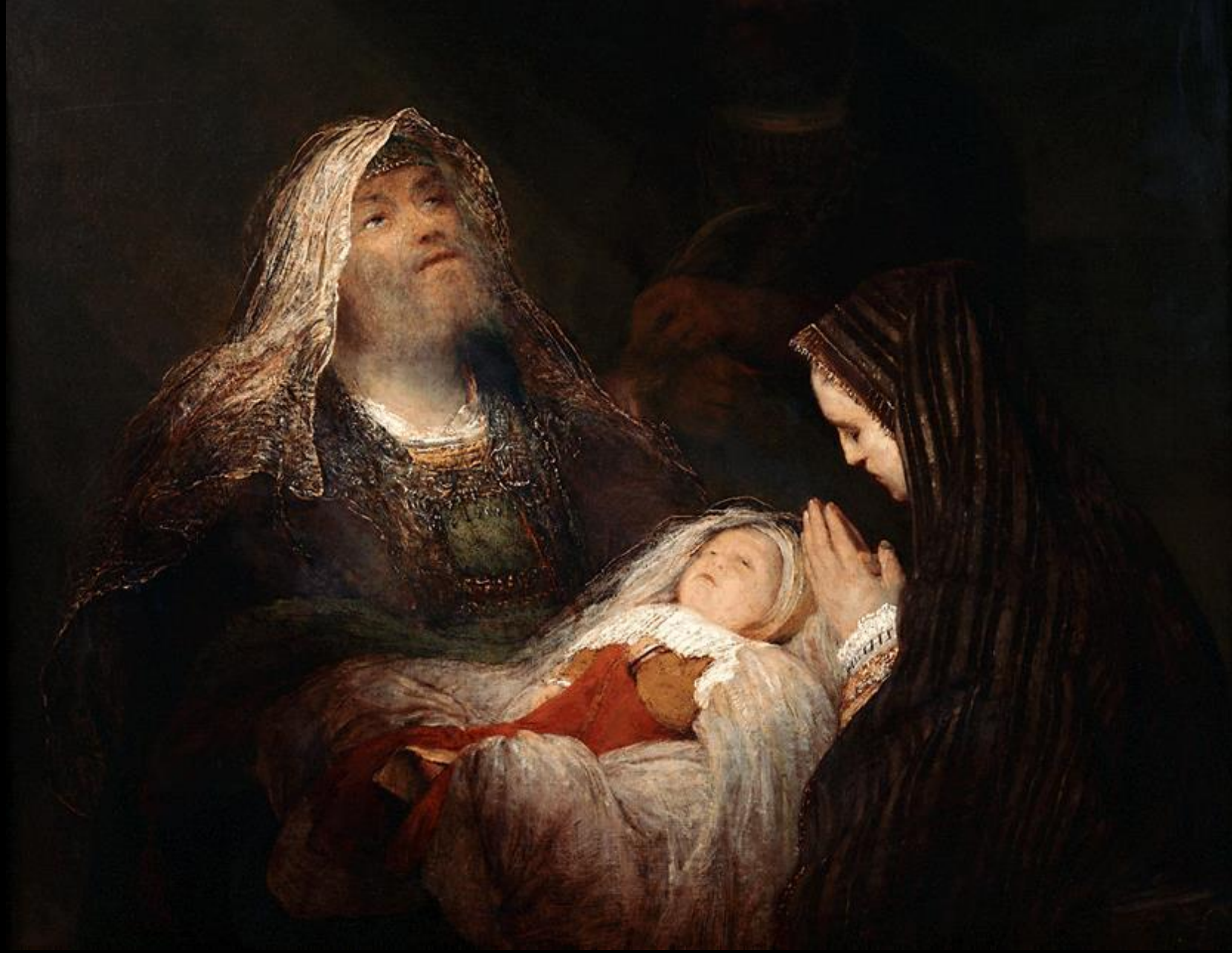
Simeon's Song of Praise (Nunc Dimittis) -- Aert de Gelder, Mauritshuis, Hague, Netherlands