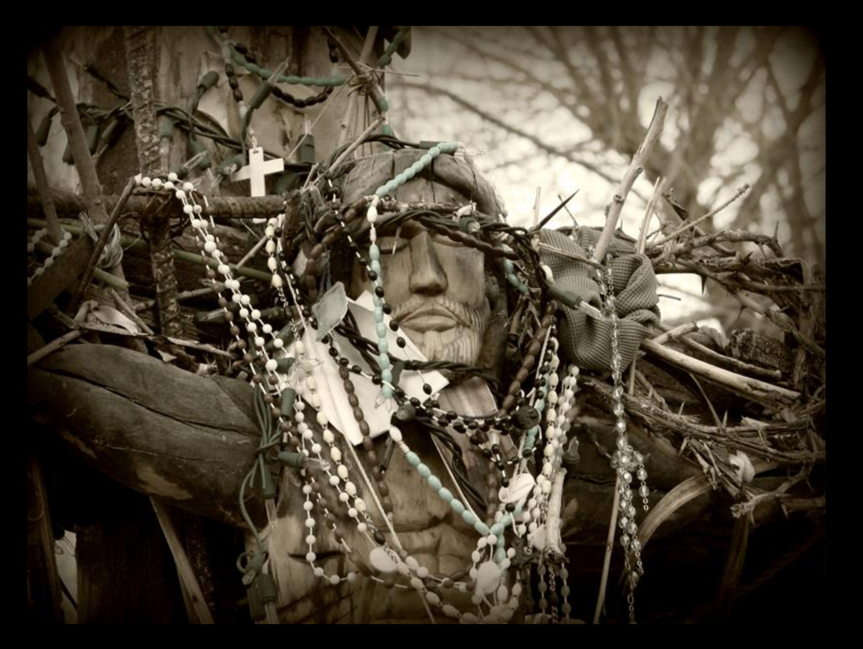
Crucifixion -- Chimayo, New Mexico