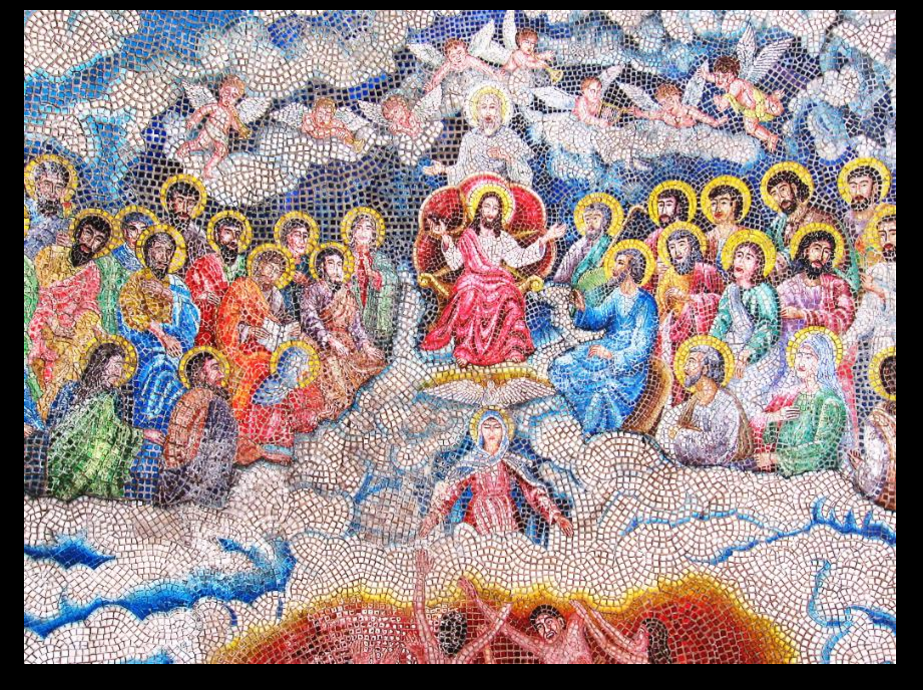
Heaven-- Tigbauan Church, Iloilo, Philippines