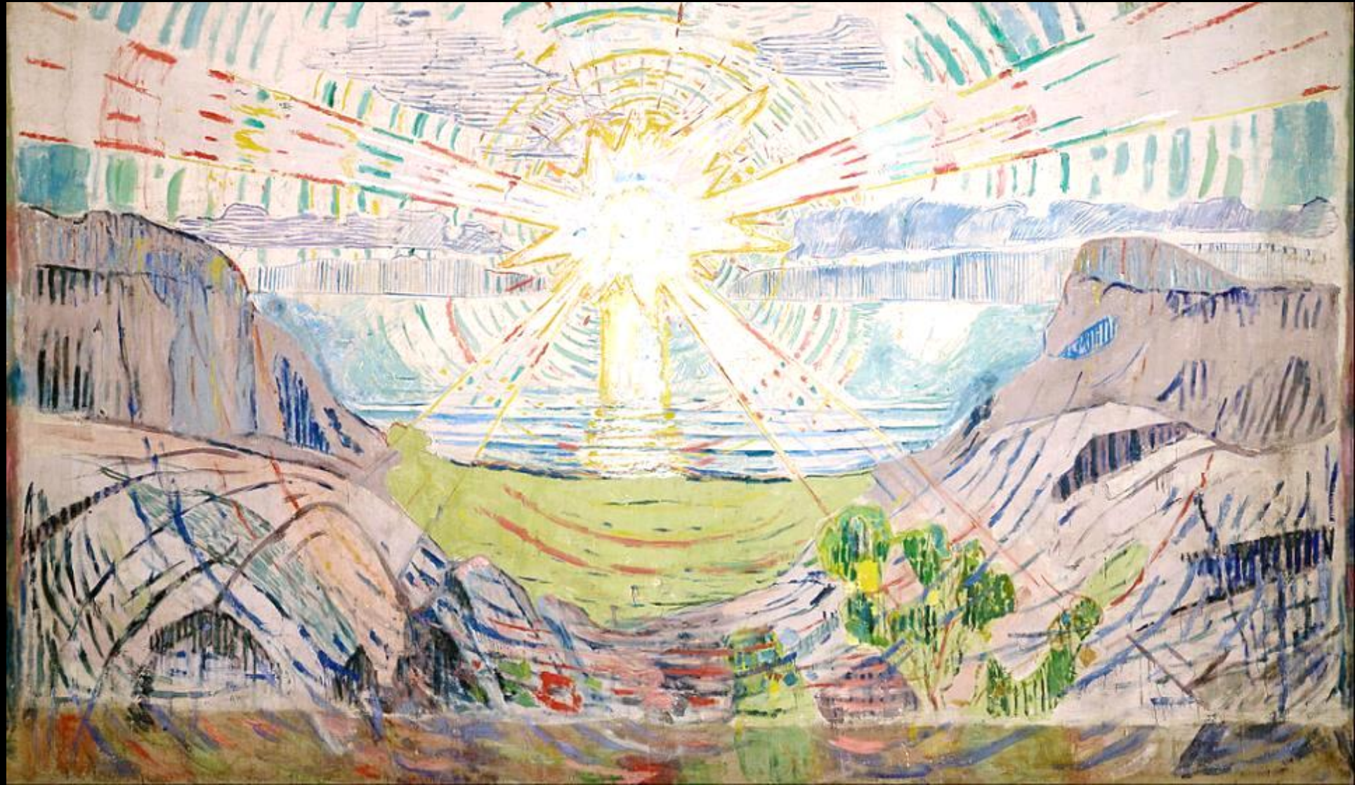
The Sun -- Edvard Munch, Munch Museum, Oslo, Norway