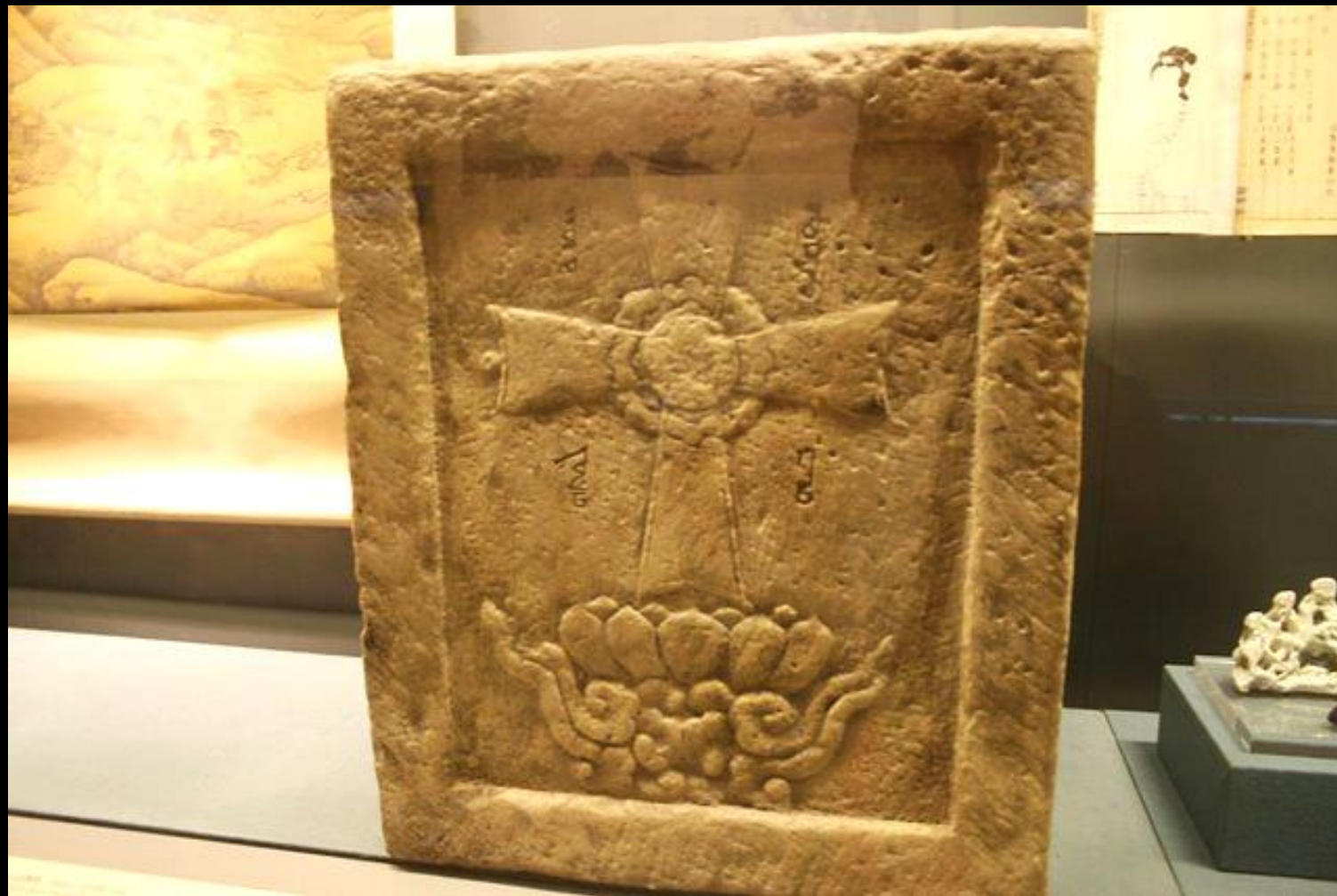
Nestorian Stone Cross from location of ancient monastery, Beijing, China, 1271-1368