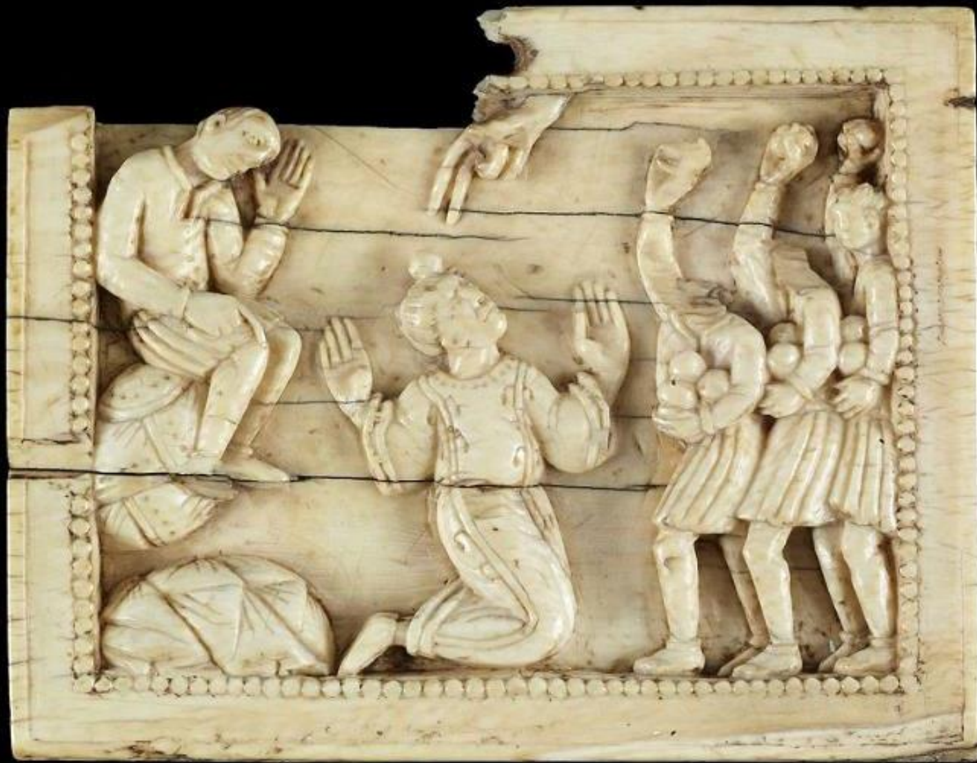
The Stoning of Stephen -- Mosan Workshop, Walters Art Museum, Baltimore, MD