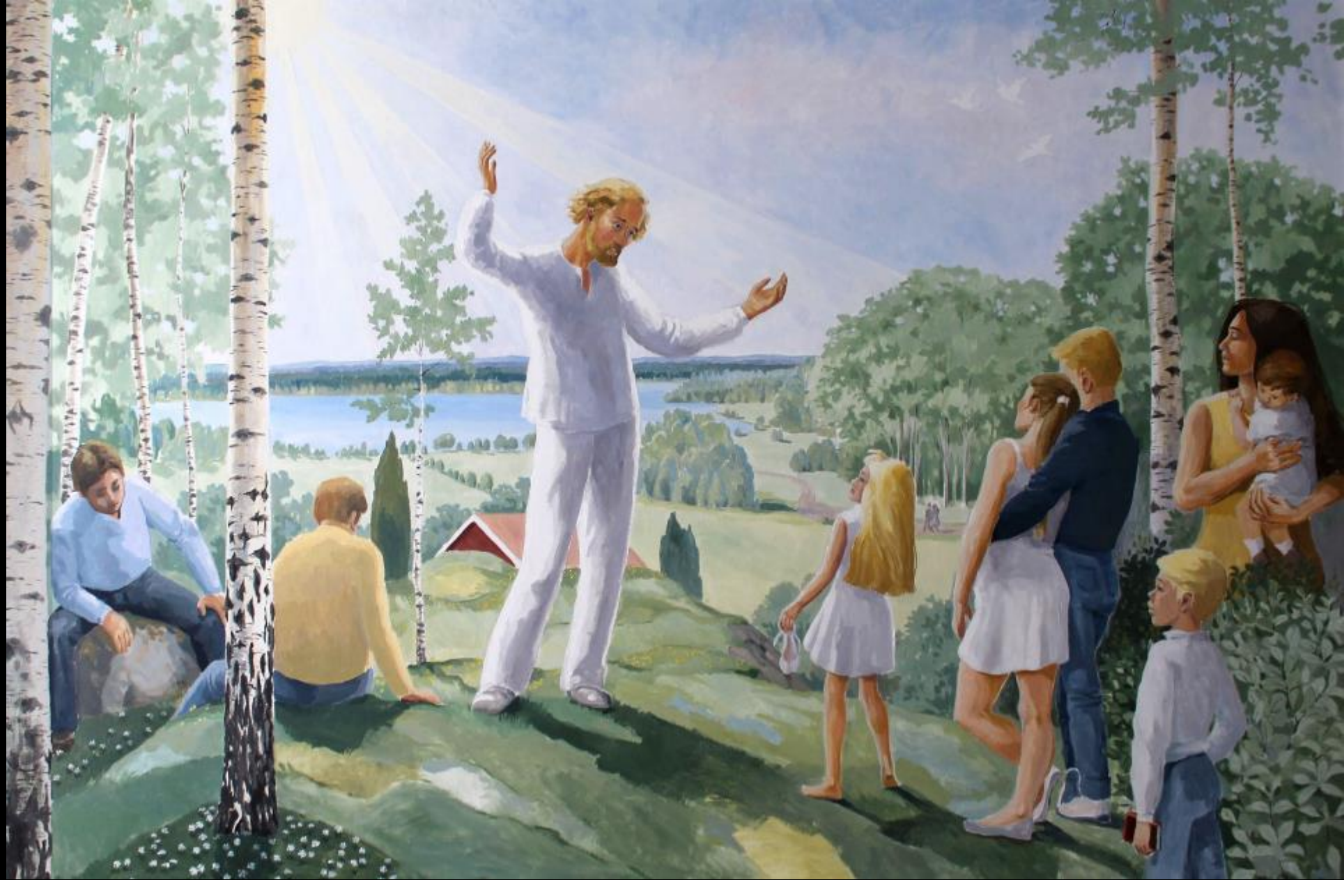
Jesus Preaching in the Present -- Soraby Church, Vaxjo, Sweden