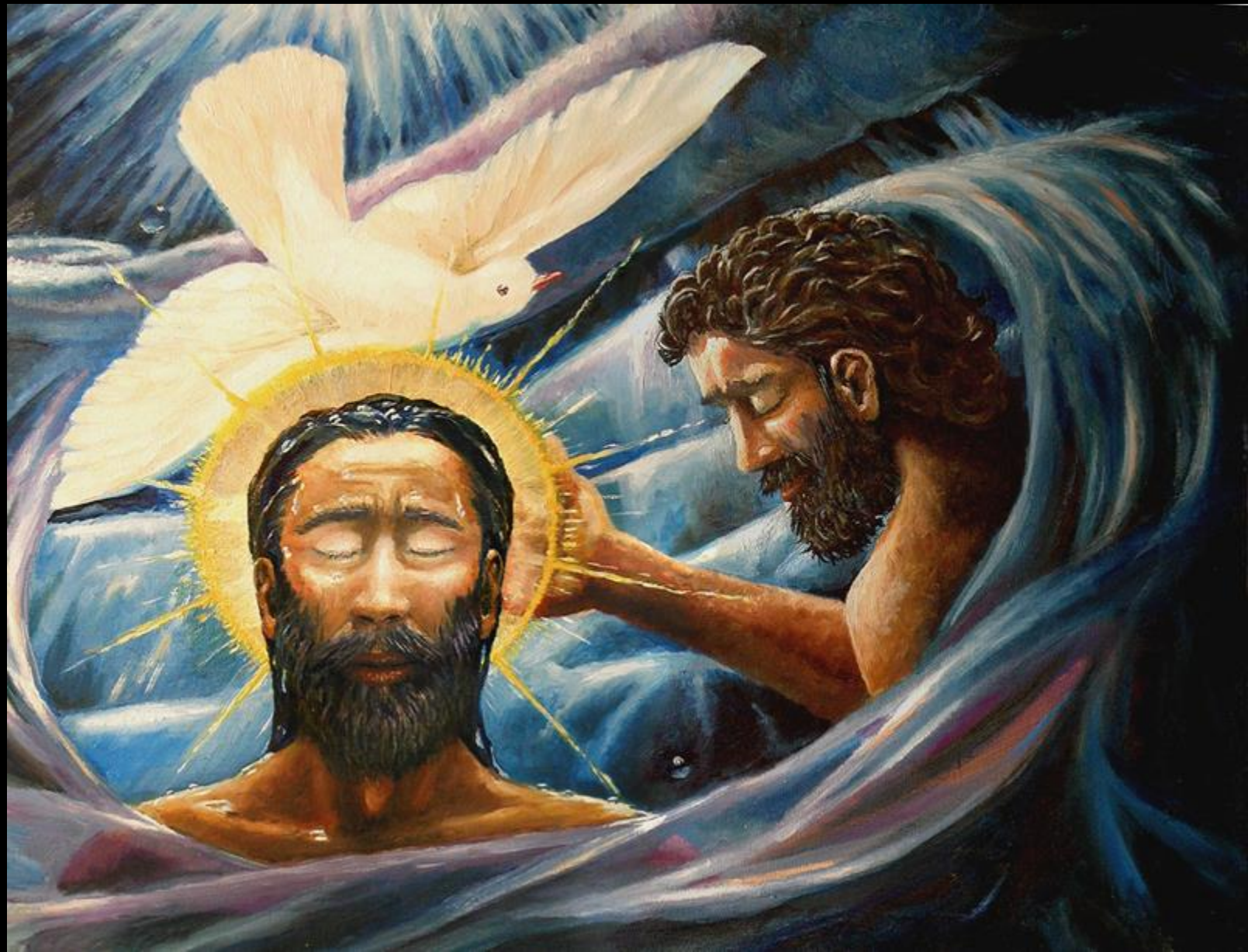
Baptism of Christ -- Dave Zelenka