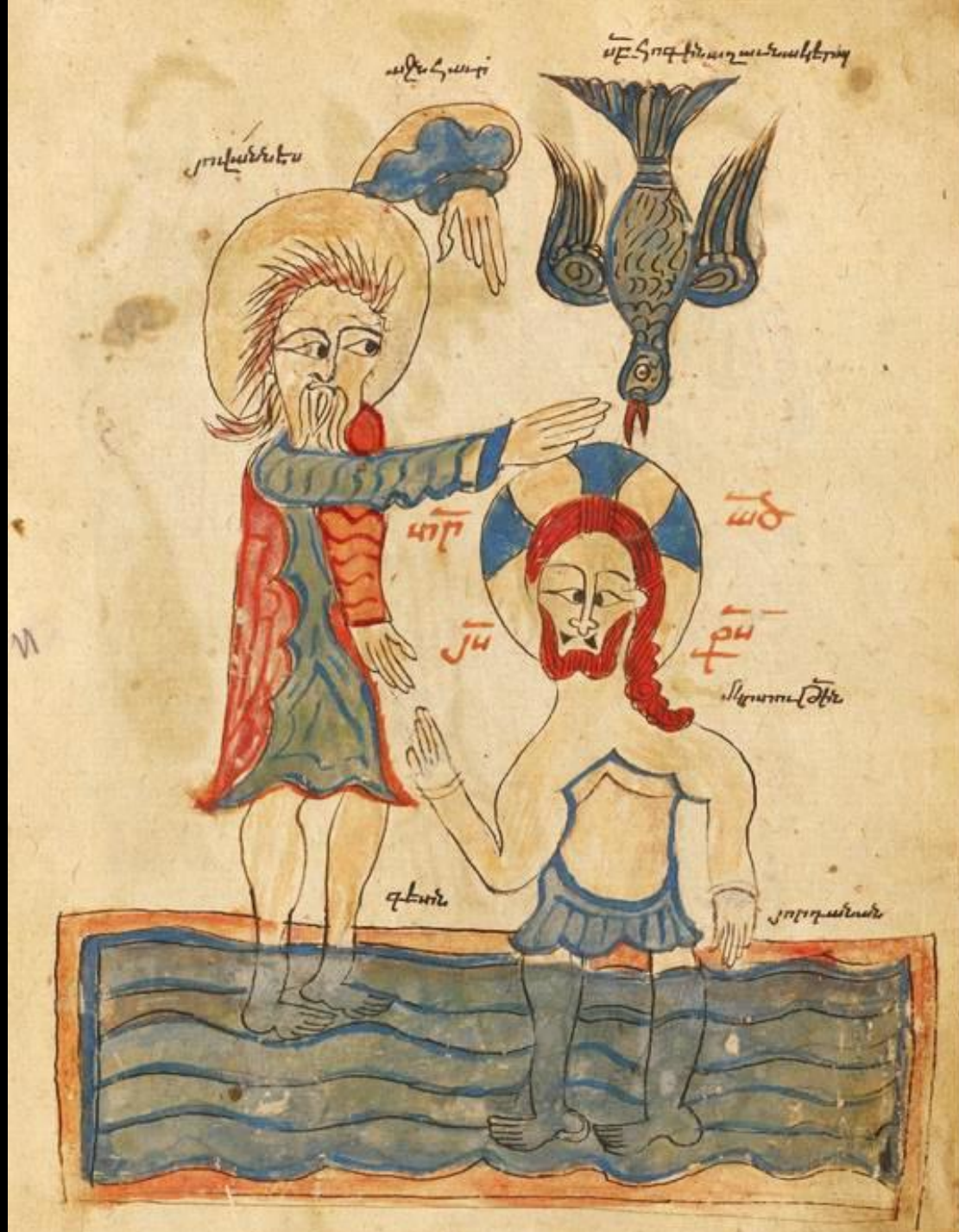
Baptism of Christ 14 th century Turkey J. Paul Getty Museum Los Angeles, CA