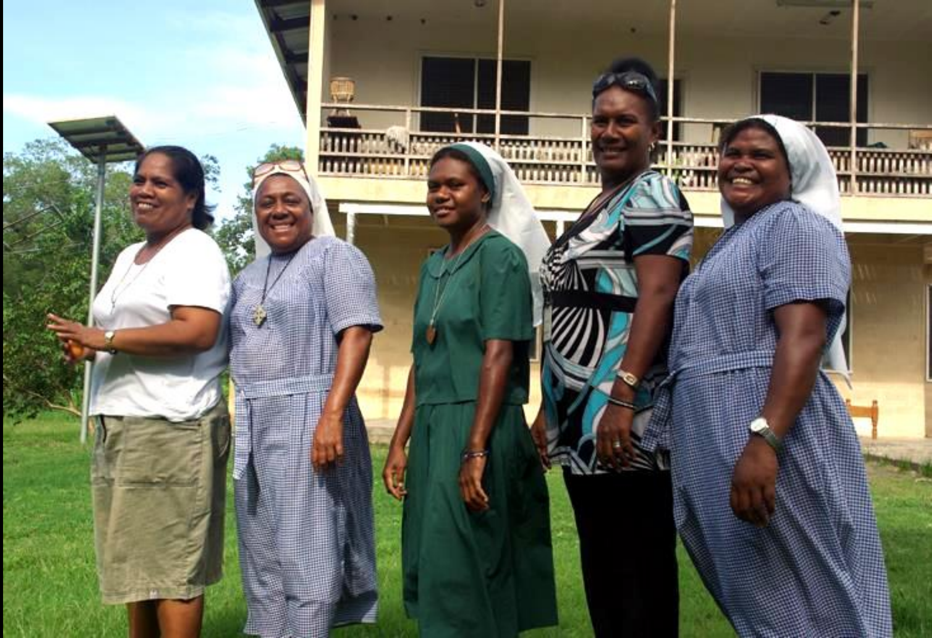
Nuns of the Christian Care Centre Community of Sisters of the Church, Honiara, Solomon Islands