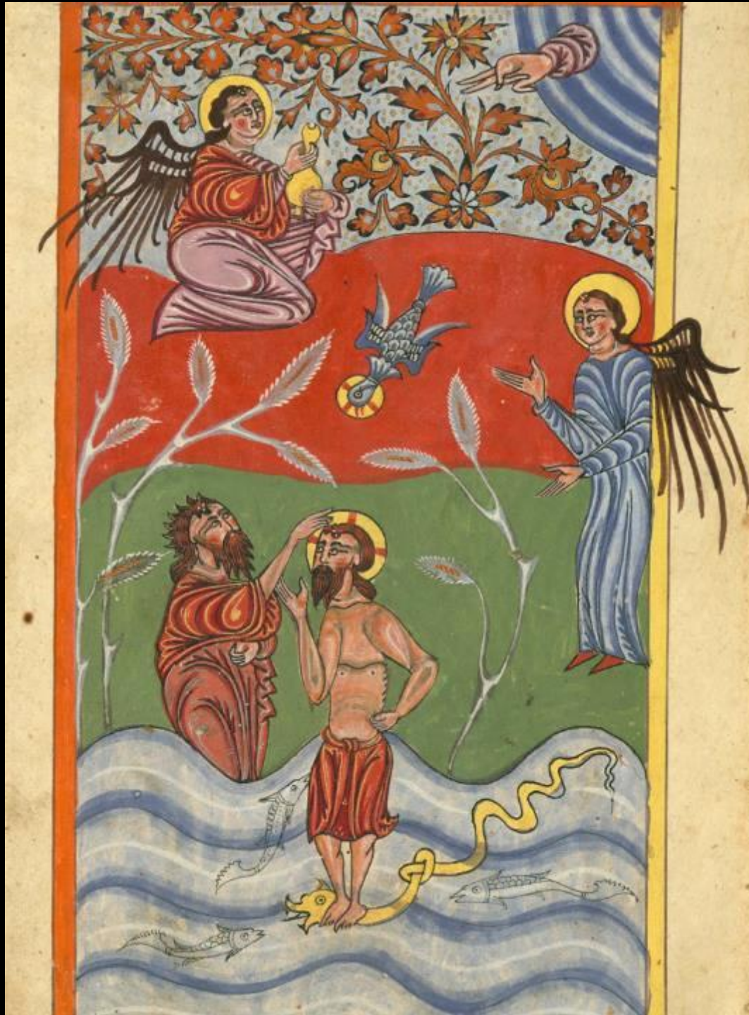
Baptism of Christ

15 th c. Armenian Walters Art Museum Baltimore, MD