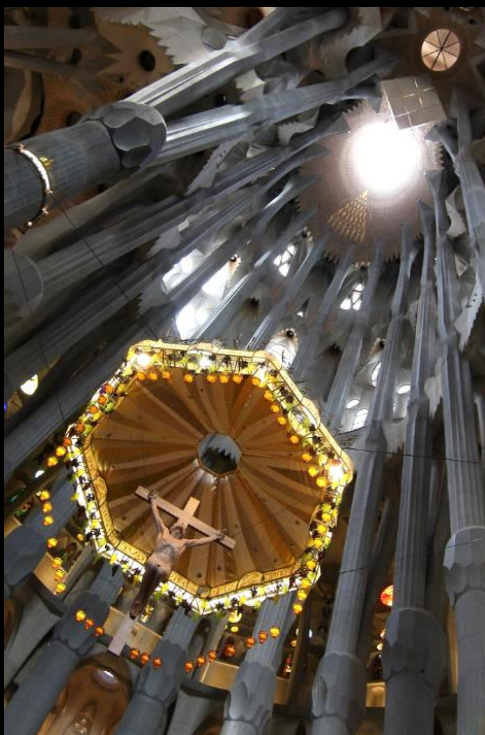
Ascension Bousure Sagrada Familia Barcelona, Spain