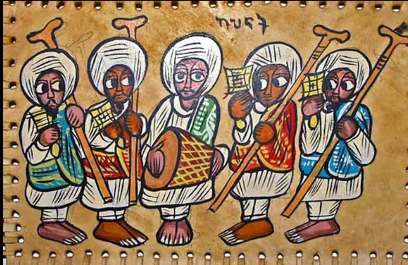
Ethiopian Orthodox Choir -- Paint on leather, 20 th century