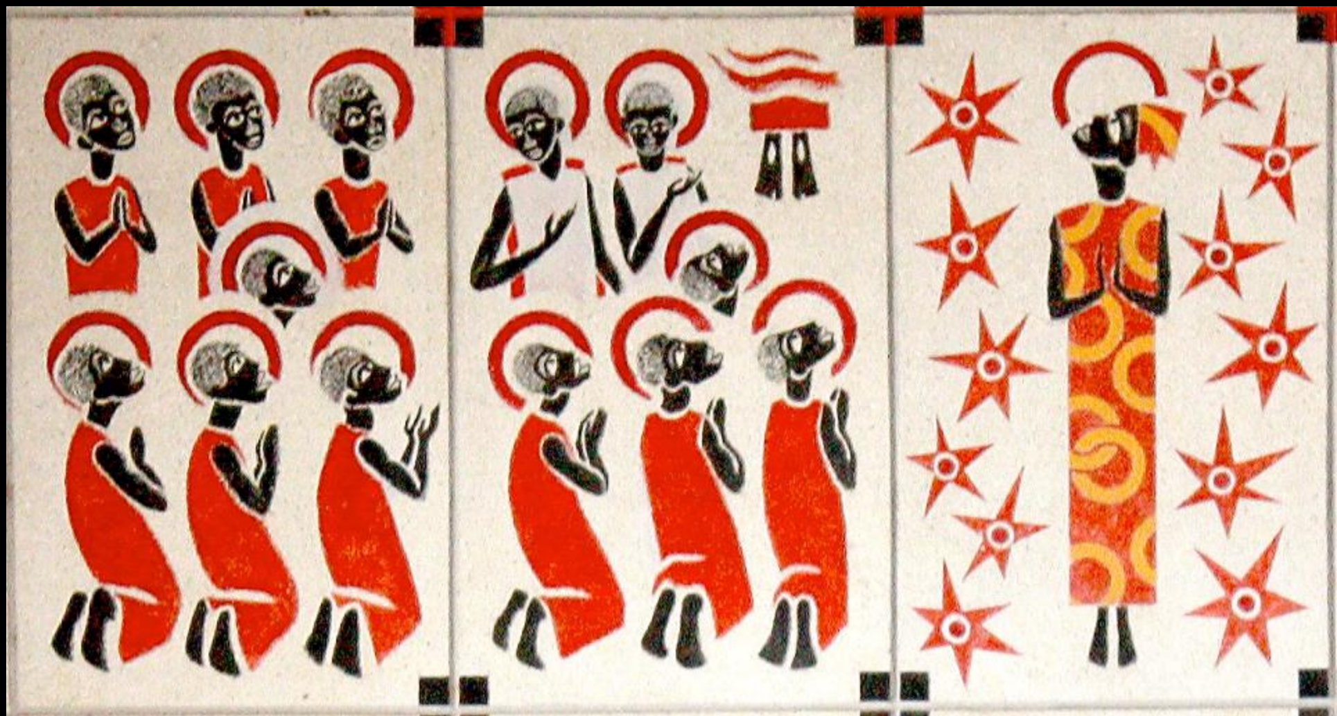
Ascension -- Keur Moussa Abbey, Keur Moussa, Senegal