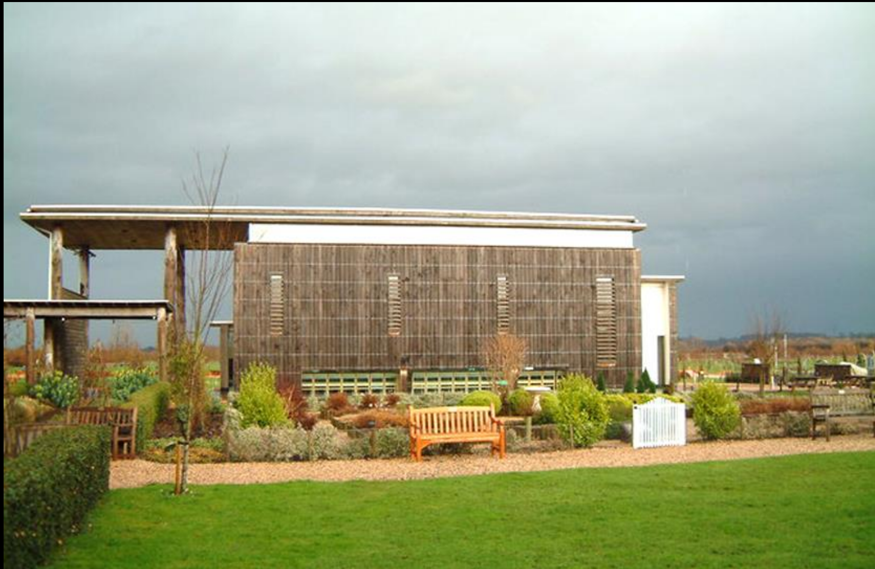
Millenium Chapel of Peace and Forgiveness, Alrewas, England